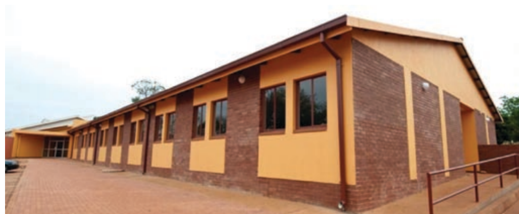
Disabled Student Unit.