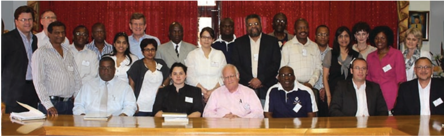
Legal practitioners from around the country gathered on the Univen campus for the Legal Practitioners' Forum.

Topics discussed included the Protection of Information Bill and its implications for universities, the Consumer Protection Act and implications for universities, the position of legal advisors and practitioners in a university structure, the difference between disputes of rights of interest and the right for senior managers to join a trade union.