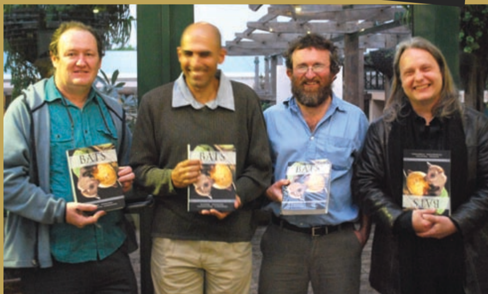
All you need to know about bats, all in one book - authors of Bats in Southern and Central Africa.