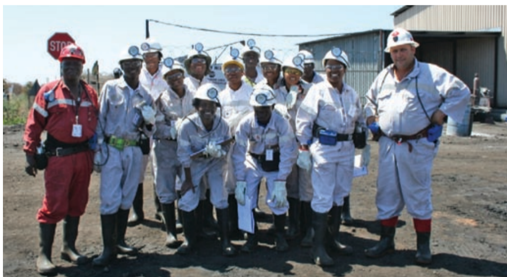
Ready for the decent – into the Tshikondeni mine.