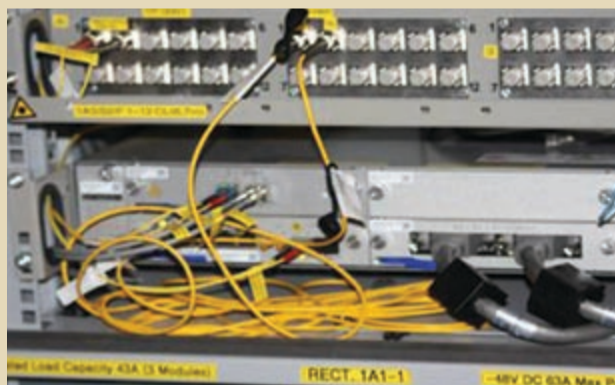
Connecting all wires to upgrade Univen’s internet service.