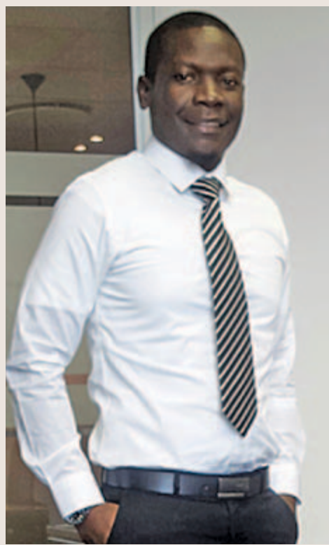
"I see motivation everywhere"