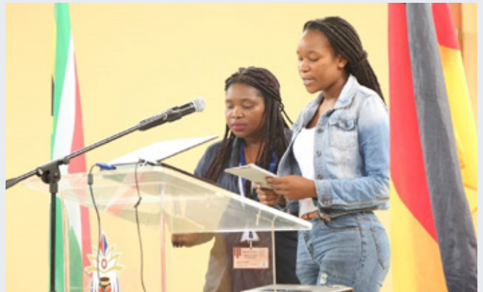
Univen social work students rendering a poem about the pride of being a social worker