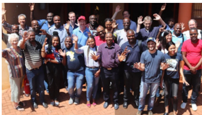
Some of the participants at the seminar