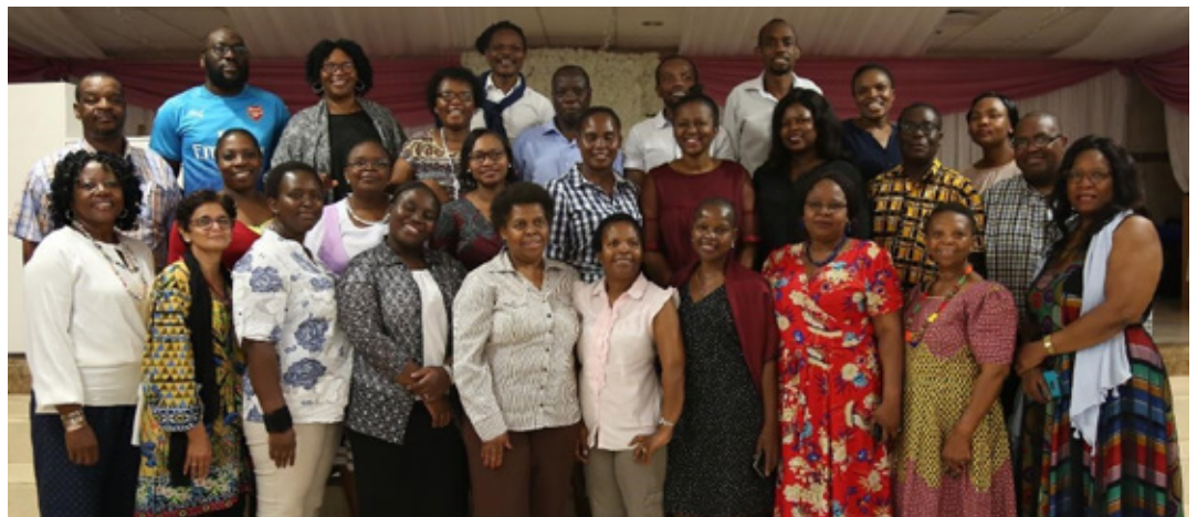
The first group of academic staff that attended the workshop on day one of the workshop.