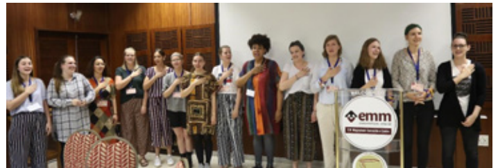
Hawk students singing the German national anthem