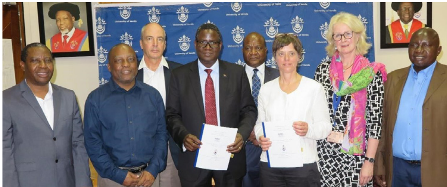
Some of the participants took a group picture during the signing ceremony