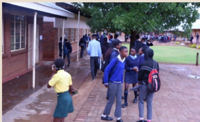
Learners getting into different classes to attend career guidance sessions after a formal programme.