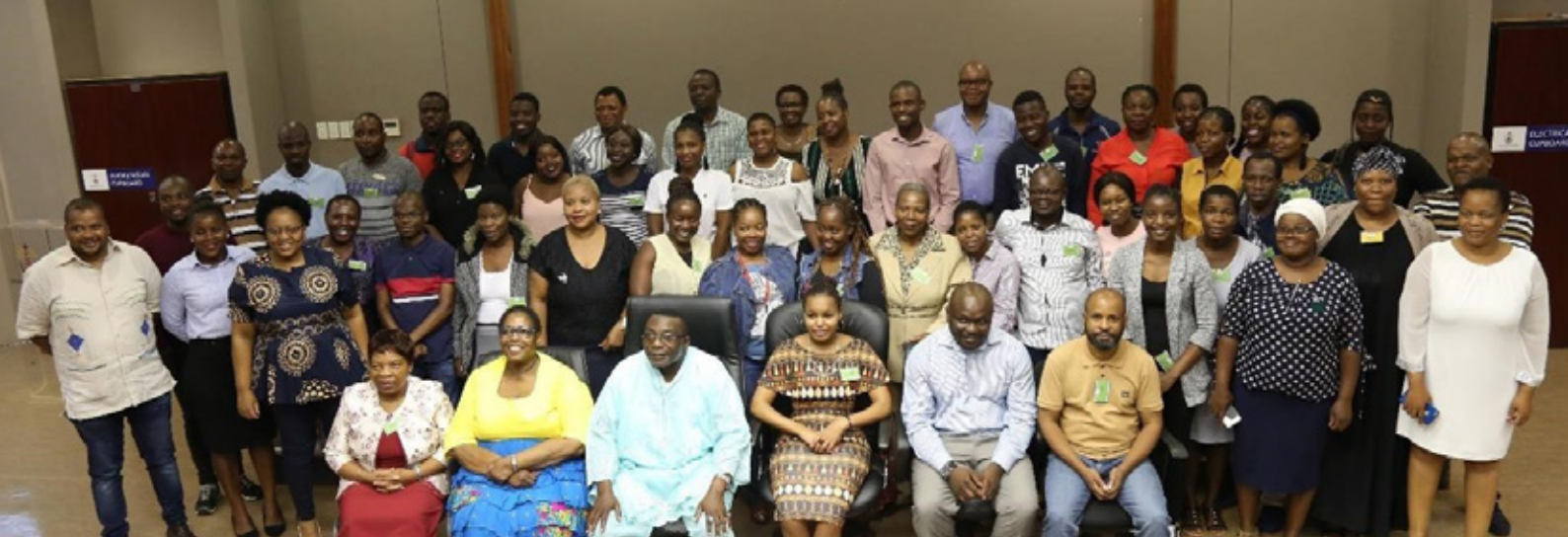
Group photo of the attendees on day 2 of the Research Data Management Workshop