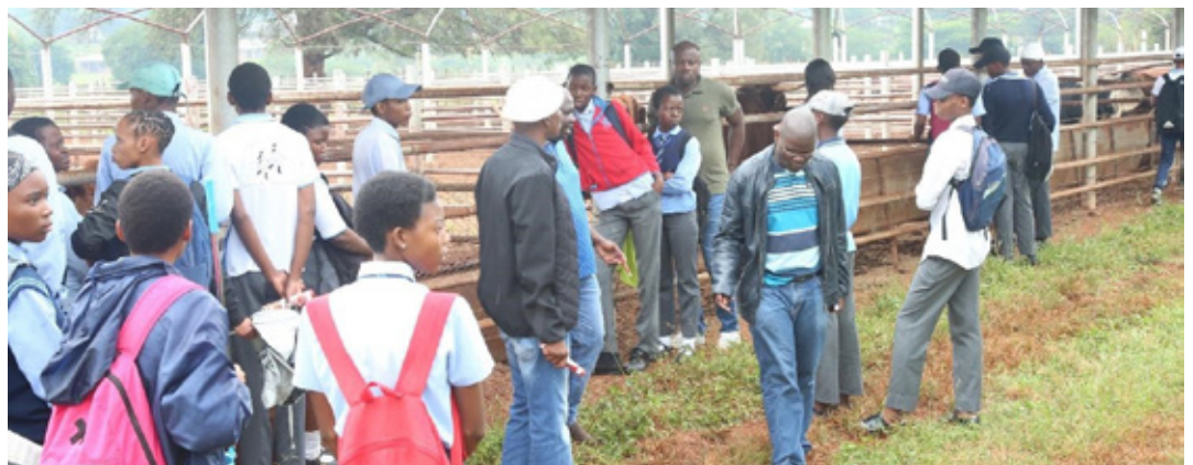
Above: Learners and teachers at the School of Agriculture