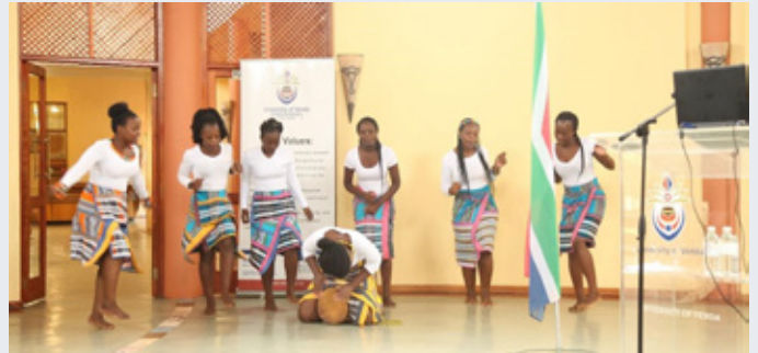
Students entertaining the audience with cultural dance