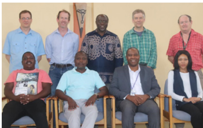
Members of the USDP Steering committee during the annual meeting