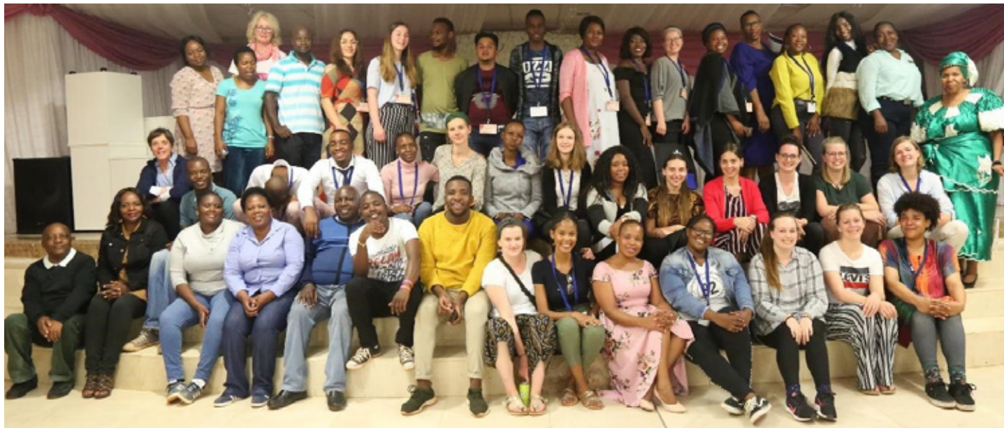
Group photo of students and staff of Univen and hawk