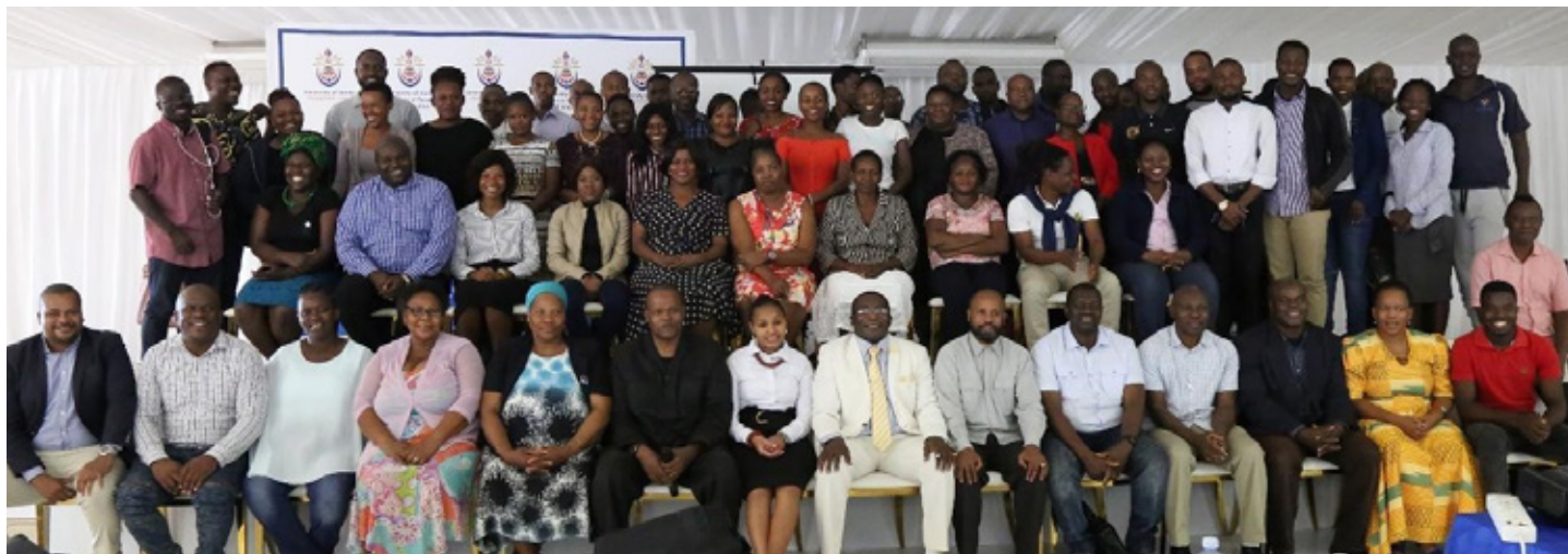
Group photo of attendees of the 5th University of Venda Research Indaba Day in 2019