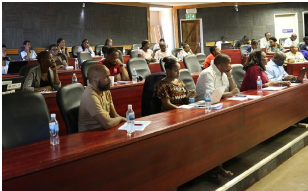
Researchers and postgraduate students listening to speakers during the workshop