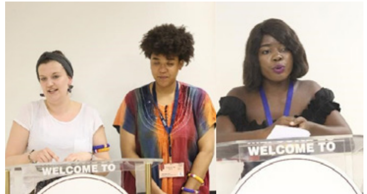
Vote of thanks was rendered by students of both partnering universities