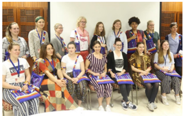
Hawk Students posing with handcrafted bags as a gift of appreciation from Univen