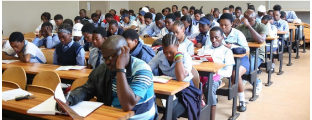
Above: Learners and educators from Diphale Secondary School going through Univen Prospectus during the career guidance session at the Univen's UIGC Seminar room