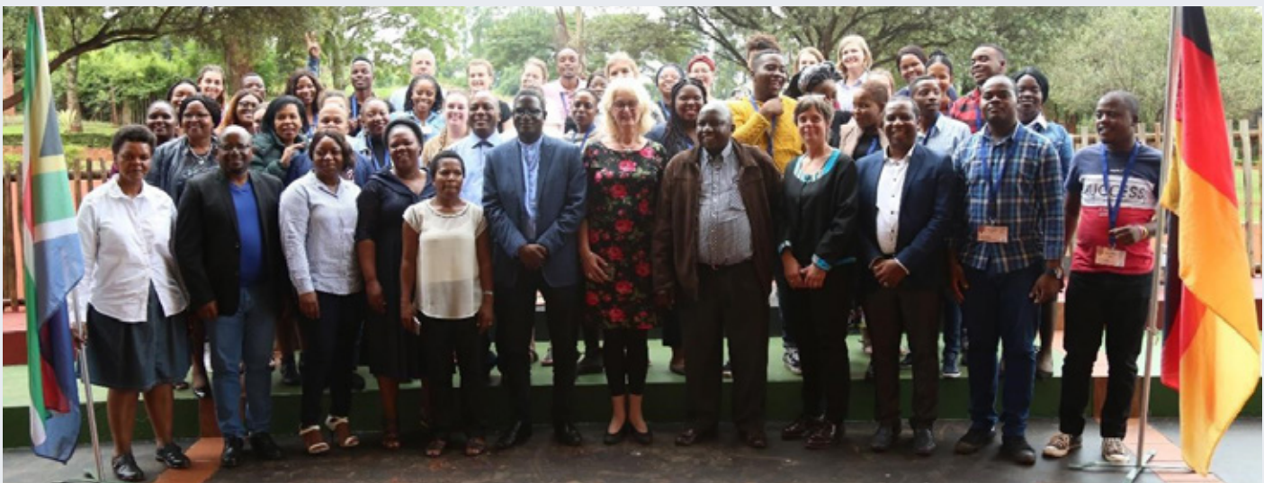
Univen staff, Hawk staff and students from the two collaborating universities posing for a group photo outside Art Gallery