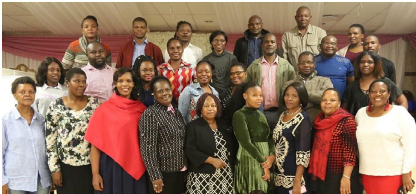
The second group of academic staff that attended the workshop on day two of the workshop