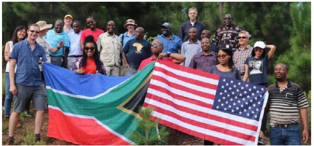
Delegates during their Venda cultural tour at Lake Fundudzi and the Thathe sacred forest

The USDP is fortunate to receive support from world class researchers and scientists from both South Africa and the United States. Subject to the availability of funding, it might be necessary to run similar seminars throughout the entire duration of the project. Also, if financial resources permitted, the seminars could be lengthened so that both facilitators and scholars are accorded enough time to interact and to apply the knowledge that is transmitted through the seminars.