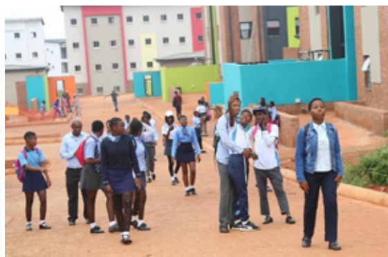
Learners and Teachers also visited the University's student residences.