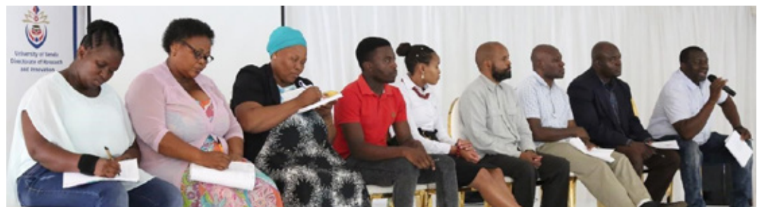
A panel discussing about the challenges that are being faced by the postgraduate students at Univen during Indaba

Students shared their experiences and challenges that they come across as postgraduates and researchers. A panel discussion was set to come up with the possible solutions to challenges being faced by Univen research community.