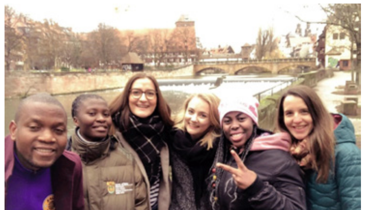
Some of the participants at the Summer School

The participants acquired variety of skills and learnt a lot with regards to the German cultures. They learnt how to interact and live with people of different cultural backgrounds. They learnt the importance of time management and punctuality as they noticed that Germans are always punctual. The deliberative dialogue between UNIVEN and German Students was very productive. Students managed to interact and share various sentiments on the prevention of violence in South Africa and Germany.