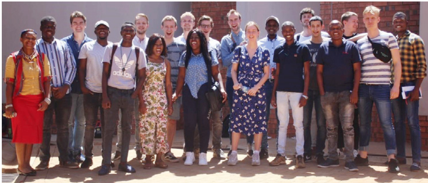
Some of students who participated in the research projects posing for a photo