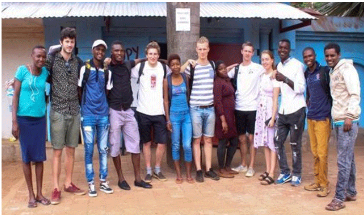
Other group that participated in the research projects posing for a photo