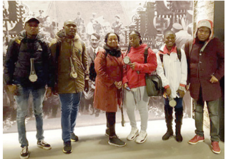
Participants at the Documentation Centre of Nazi Party Rally Grounds