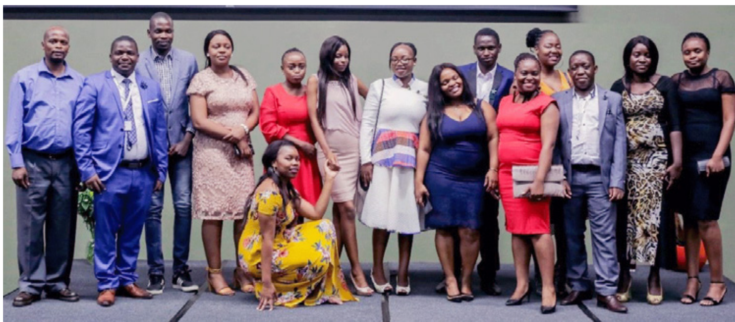
Univen delegates who attended the SACI conference posing for a group photo