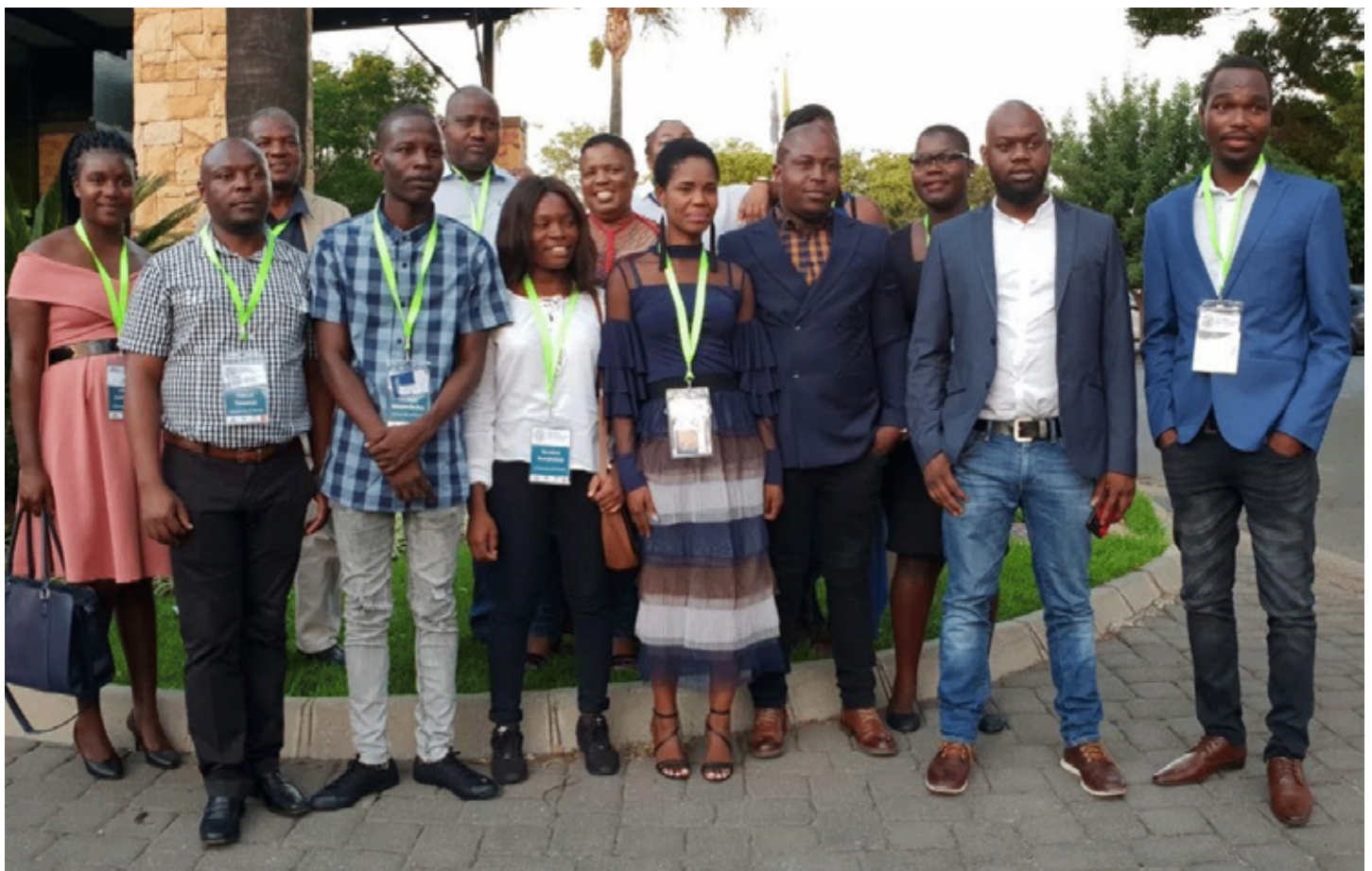
University of Venda SAAB 2019 delegation