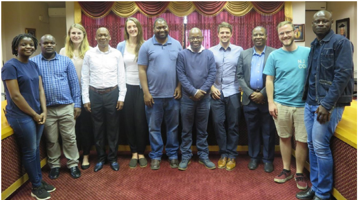
Some of the participants at the STEP TTT workshop