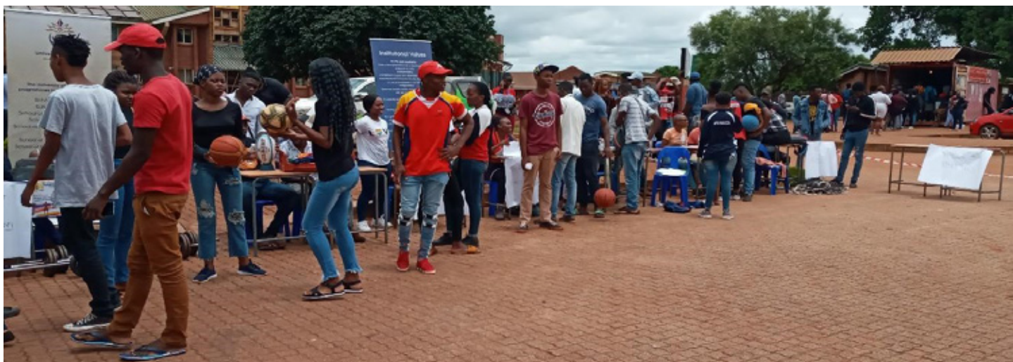
Prospective players and athletes visiting recruitment desks