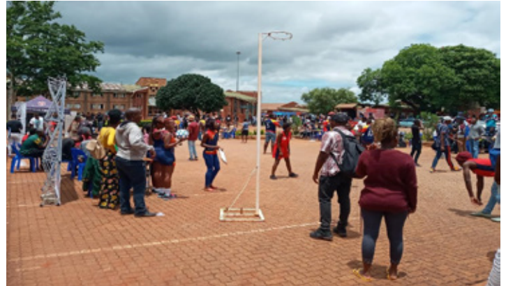
Display of sports specific skills by netball team

The purpose of the recruitment drive was aimed at drawing the interest and attention of prospective players and athletes who are keen to participate in various sports, recreation, arts and culture teams and groups of their choice. The target group was primarily first entering students who considered the University of Venda as their university of choice to study and other senior students who were not participating in other activities.