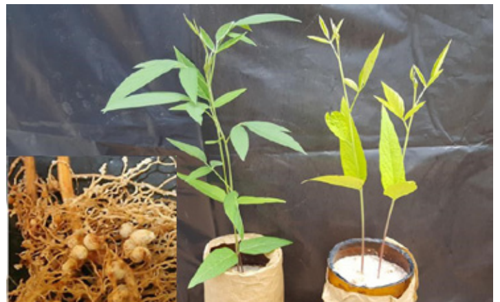
Root nodules (round brown structures) on pigeonpea seedlings able (left) and unable (right) to manufacture organic nitrogen.

Part of Ms Bopape's research project is aimed at helping small-scale farmers who produce bean crops. Some field crops, particularly the bean types such as soybean and others are unique in the sense that they take up nitrogen gas (from the air) and convert it into nitrogen fertilizer. In general, all field crops require this fertilizer for growth and ultimately the production of grain yield. It is for this reason that farmers apply commercial chemical nitrogen fertilizer (which is quite expensive) on crops. However, the bean types of plants can circumvent the need for this expensive fertilizer if they are grown in a soil that harbors indigenous bacteria (called soil Rhizobia) which then form small round structures on the roots (called nodules – see insert) which enable the manufacturing of the organic nitrogen fertilizer by the plant. During planting, commercial farmers often mix (or inoculate) the bean seed with commercially available soil bacteria in order to enhance the subsequent manufacturing