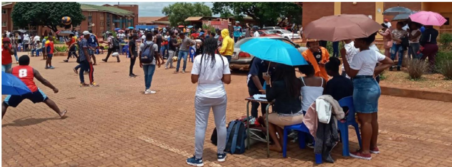
Display of sports skills for various sporting code(s)