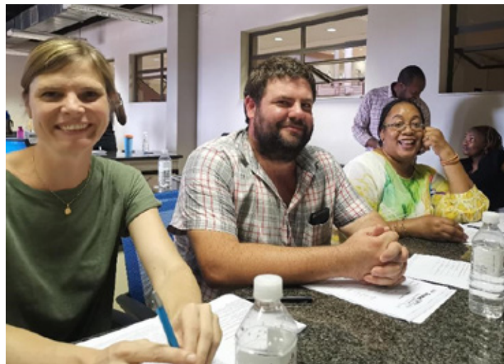
Judges of the Famelab regional competition hosted by UNIVEN's Zoology Department

"Science, when it is well done, can influence a sector. When it is well done and well communicated, it can change the world".