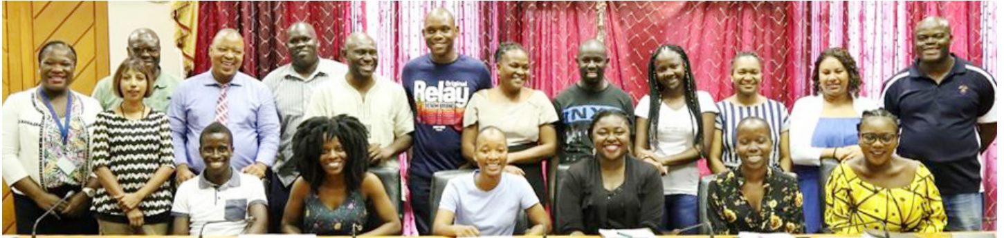
A group photo of workshop participants and facilitators

Ethical conduct involves doing the right thing, and research ethics focus on the moral principles that individuals must uphold in conducting research.