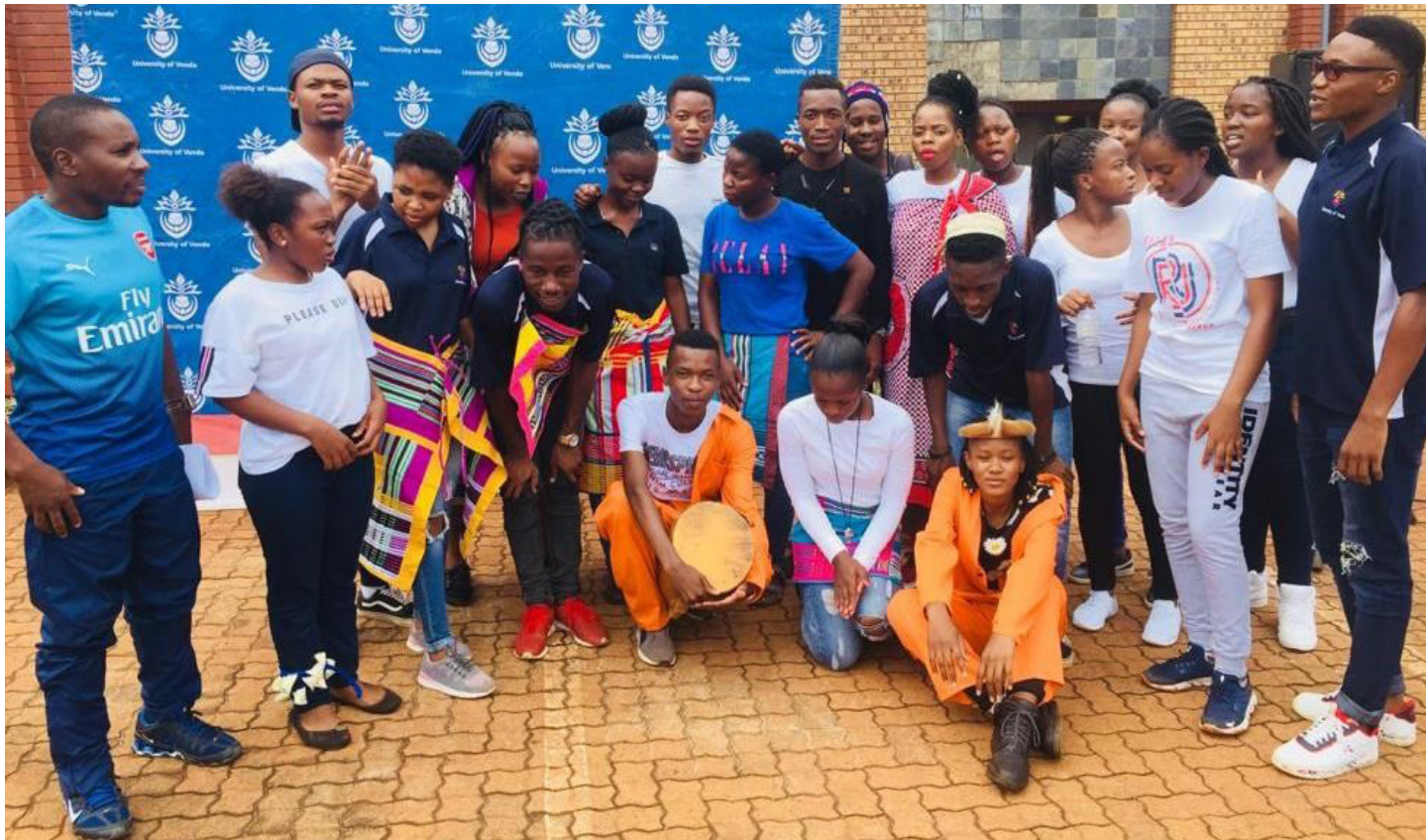
Group photo of the organizing team with UNIVEN Arts Society