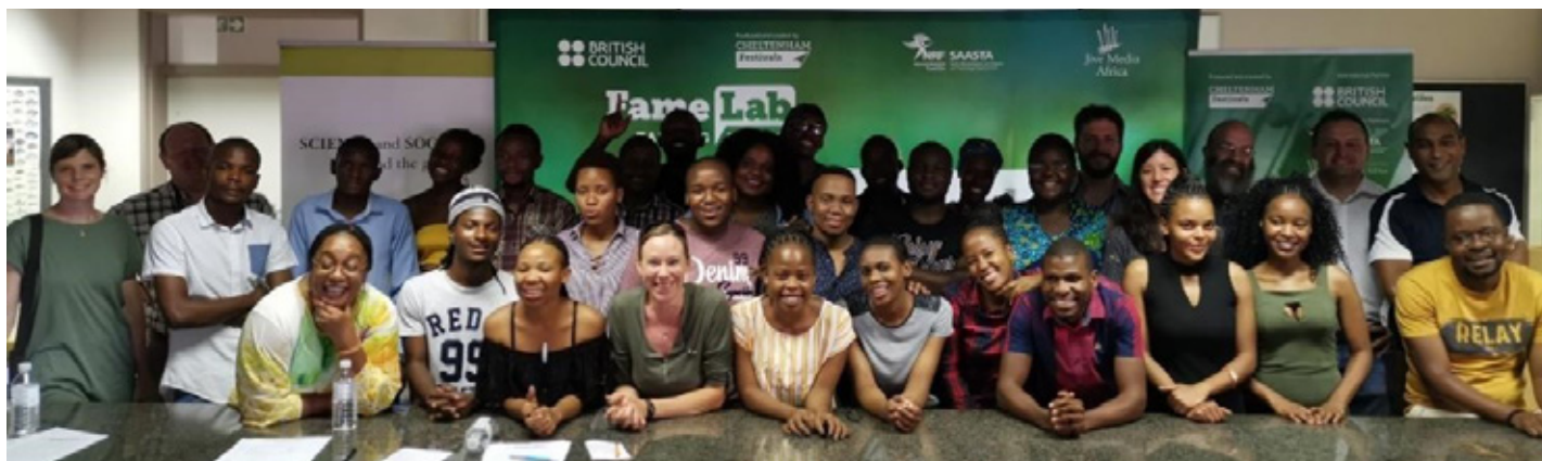
Judges, students and supervisors at the Famelab competition

"Science, when it is well done, can influence a sector. When it is well done and well communicated, it can change the world".