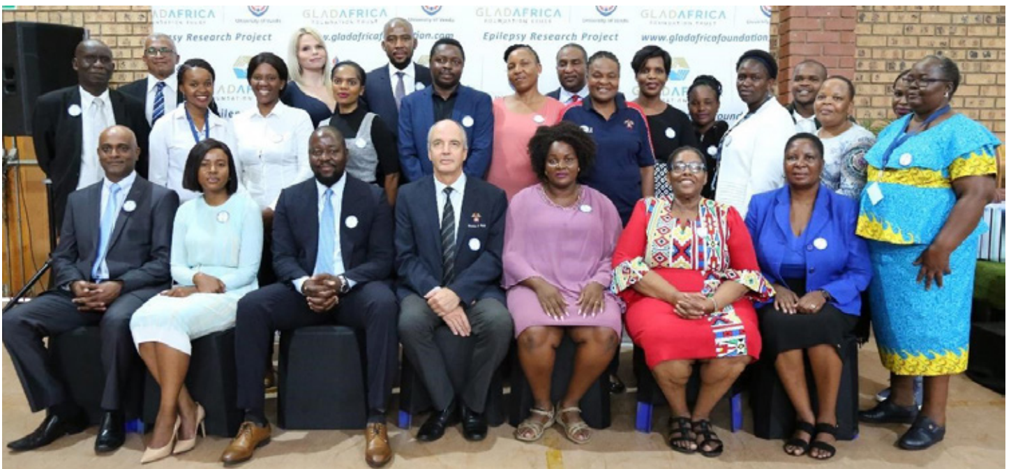
Representatives of the University Management and Staff, GladAfrica Group and Foundation Trust Executives, GERP team and partnering stakeholders posing for a photo