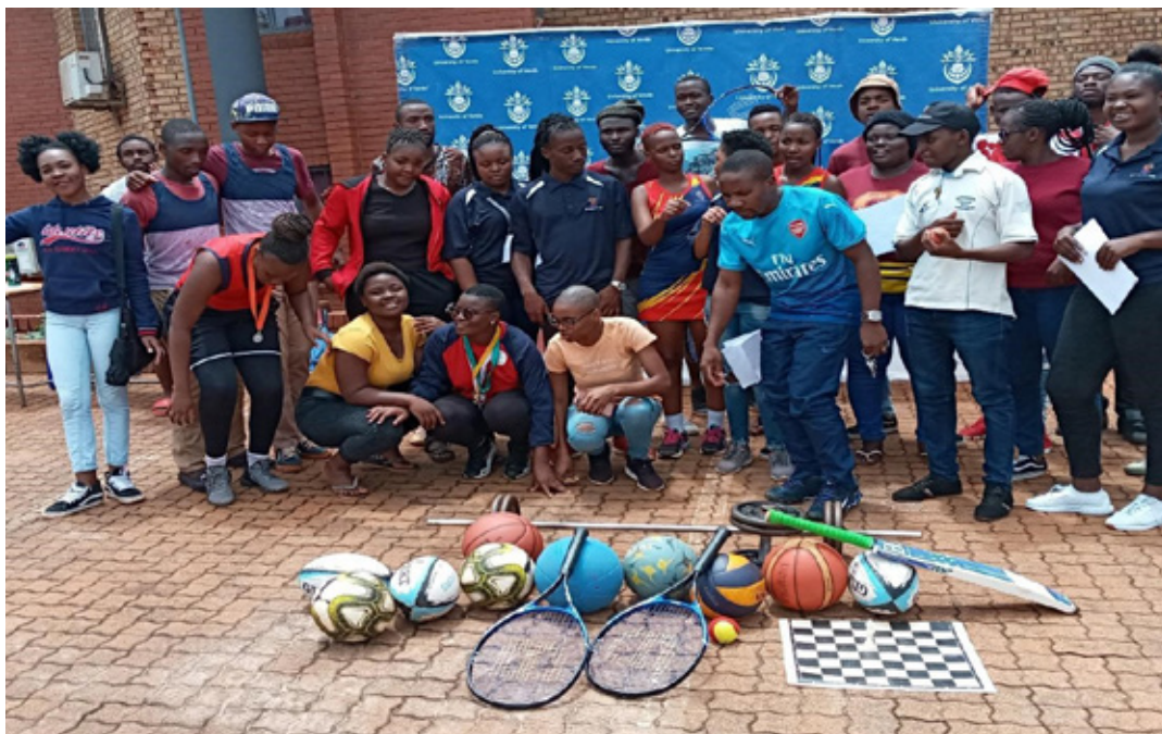
Group of students displaying equipment for various sports