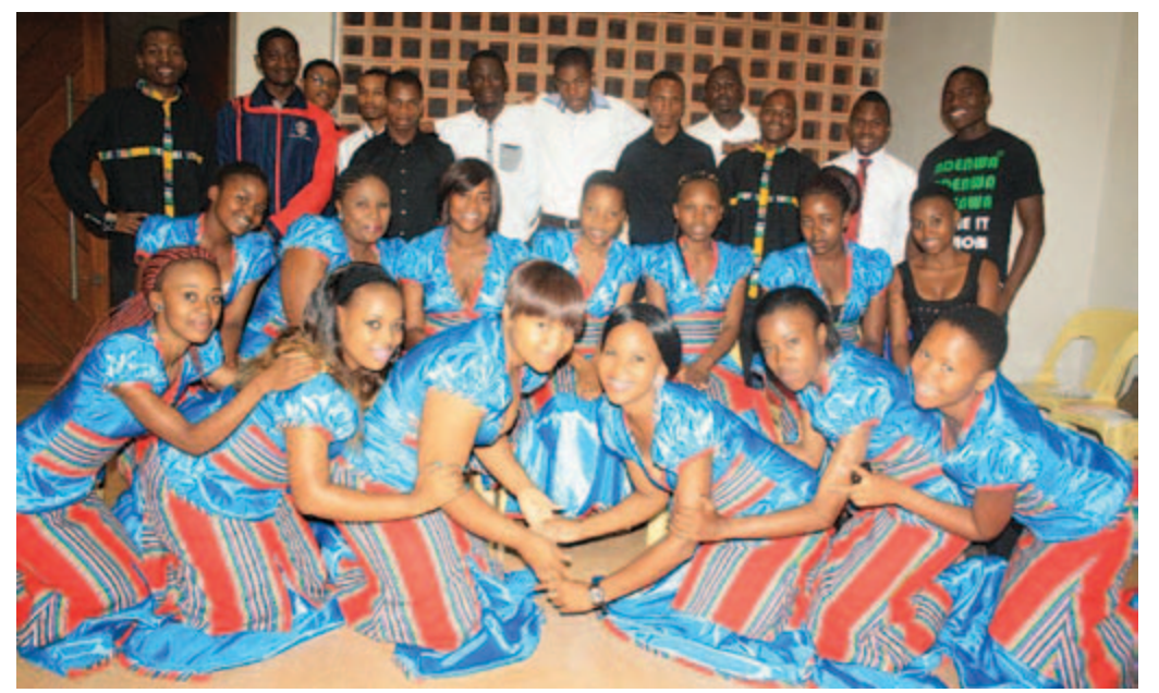
Singing the praises of the Class of 2014 – the Univen choir.