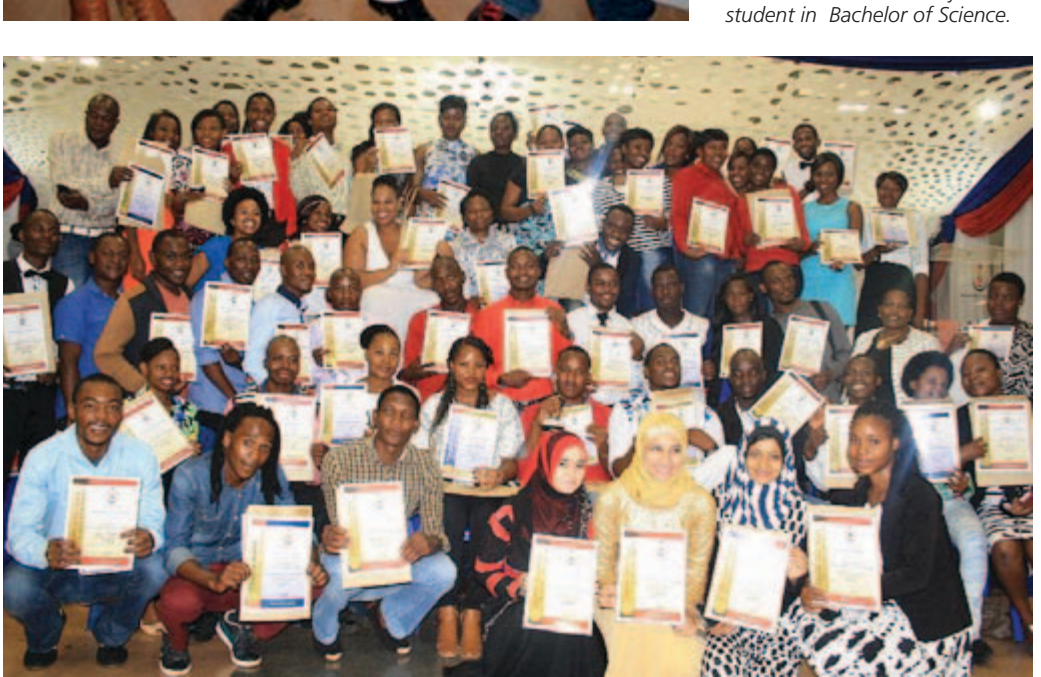
The cream of the crop – 2014's best performing students.