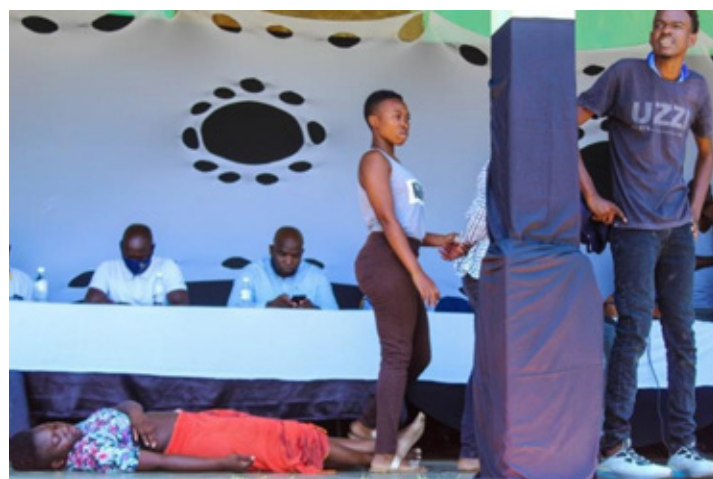
Drama performance at the event