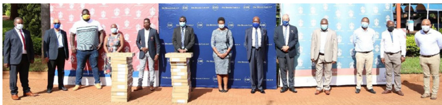
Group photo of attendees of the handing over event

De Beers Group is aware that quality education needs to continue online hence there is a serious need for organisations to donate devices that will assist and enable student participation.