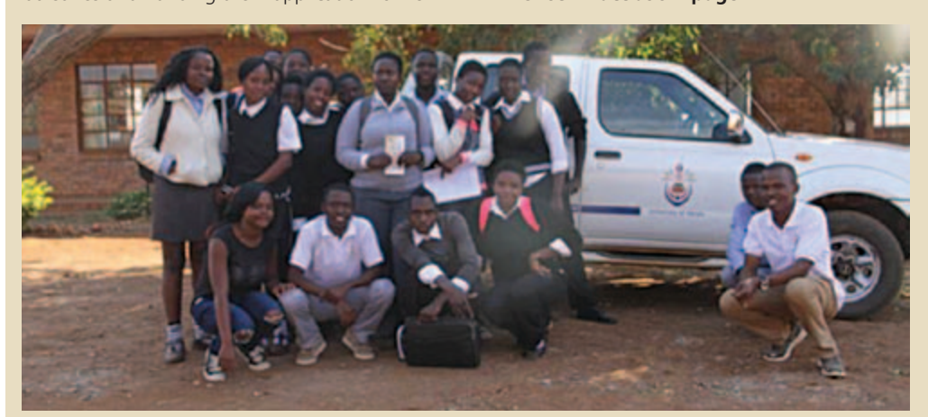
Meeting with learners of the Alfred Nngwedzeni Secondary School

For more information visit the Amplifying Community Voices Students Association- ACVoSA Facebook page.