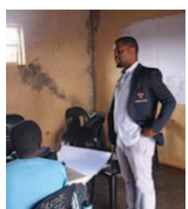
Univen SRC General Secretary talks to children at Malavuwe.