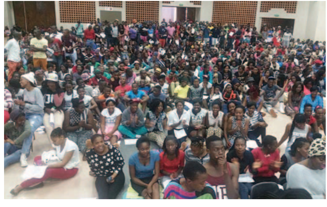
Learners came, they listerned and they left informed.