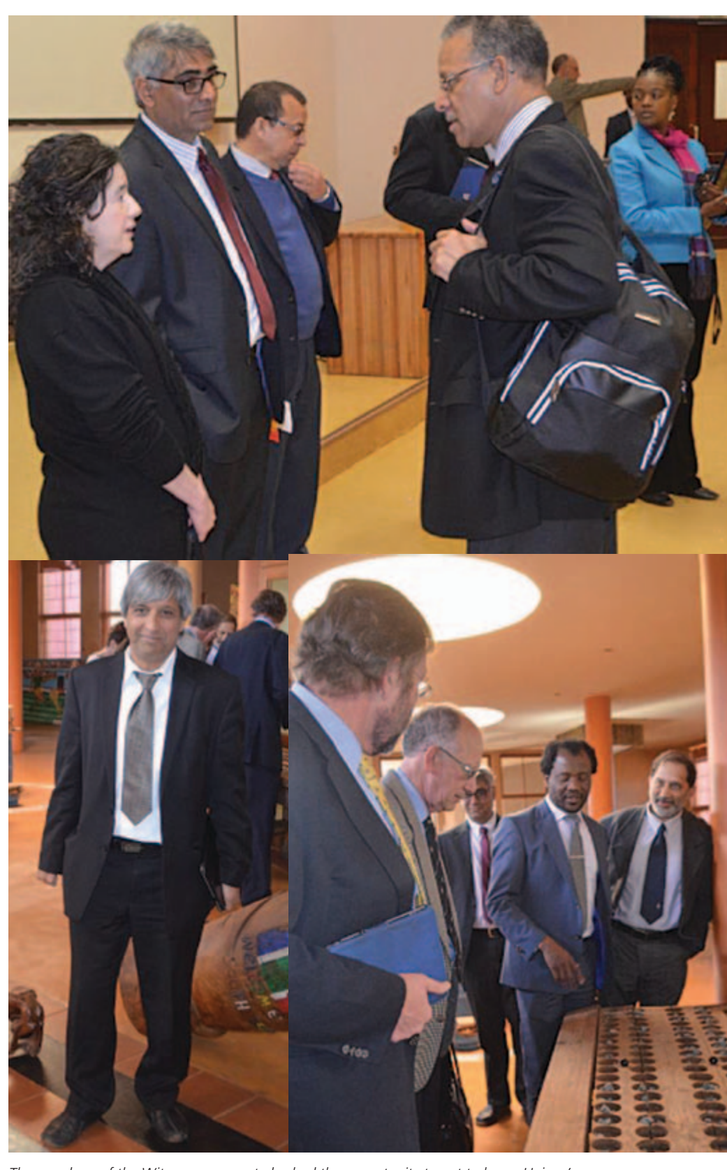
The members of the Wits management also had the opportunity to get to know Univen's campus.