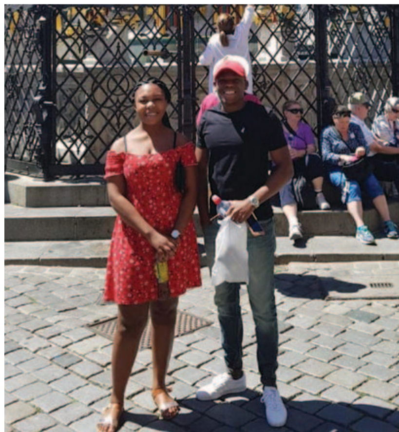
Doing a bit of sight-seeing!