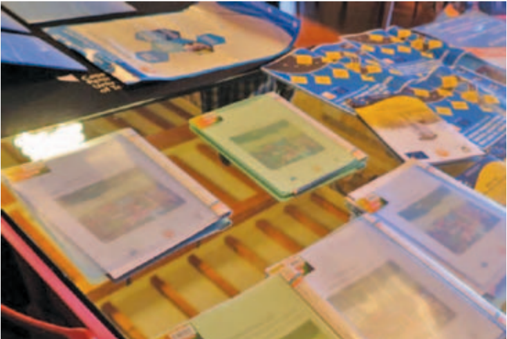
Products from partner universities.