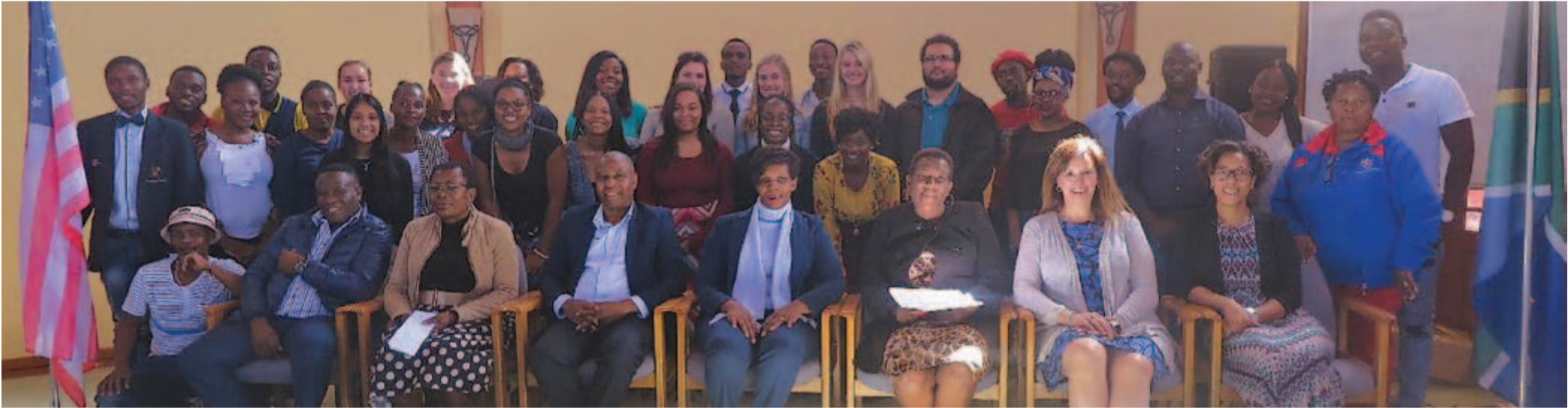
Participants at the orientation.