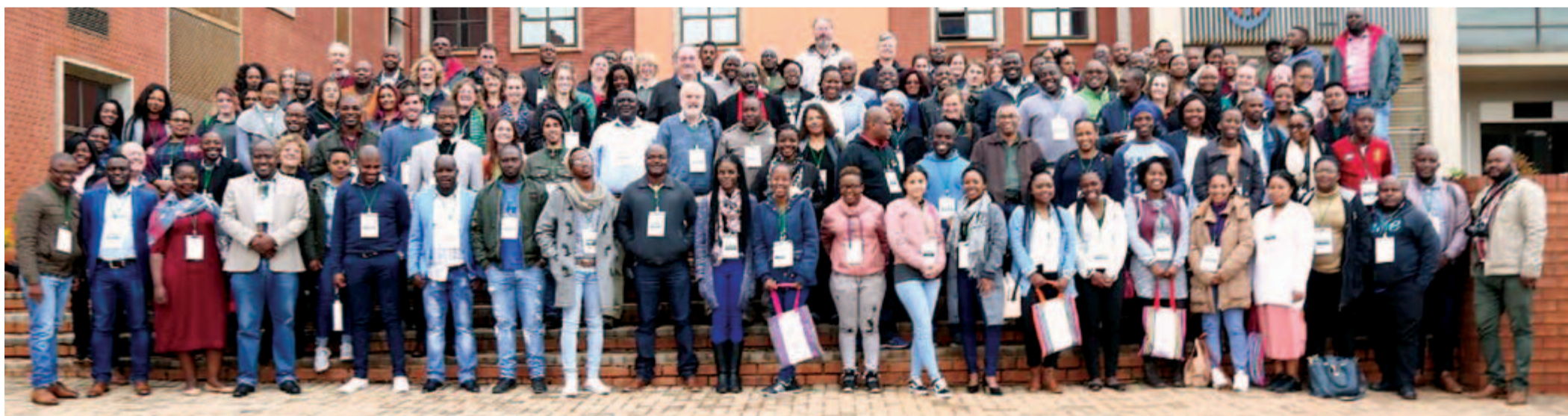
Delegates from various participating institutions came to witness the occasion.