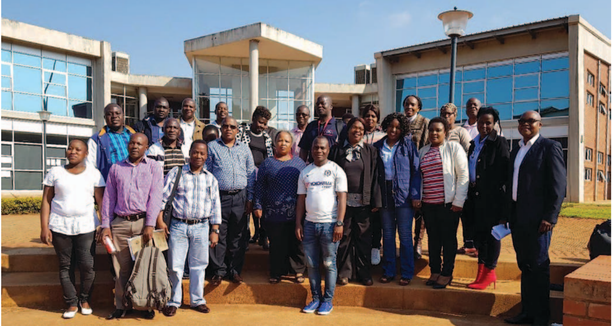
Taking in good advice - Postgraduate students, PhD candidates, research supervisors and promoters at the workshop.