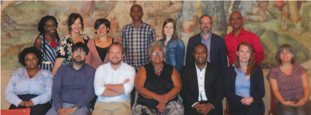
IMPALA steering committee members in Bologna.

Participants were requested to improve on their deliverables for a final submission by August.