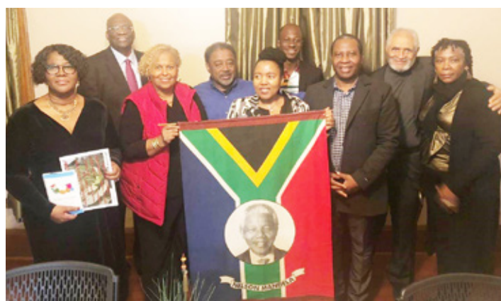
Some of the delegates with Atlanta Urban Agriculture Group

The IVLP on Demand programme invited representatives from seven universities in South Africa (University of Pretoria, Rhodes University, University of Fort Hare, University of Venda, University of Zululand, Central University of Technology and Mangosuthu University of Technology).