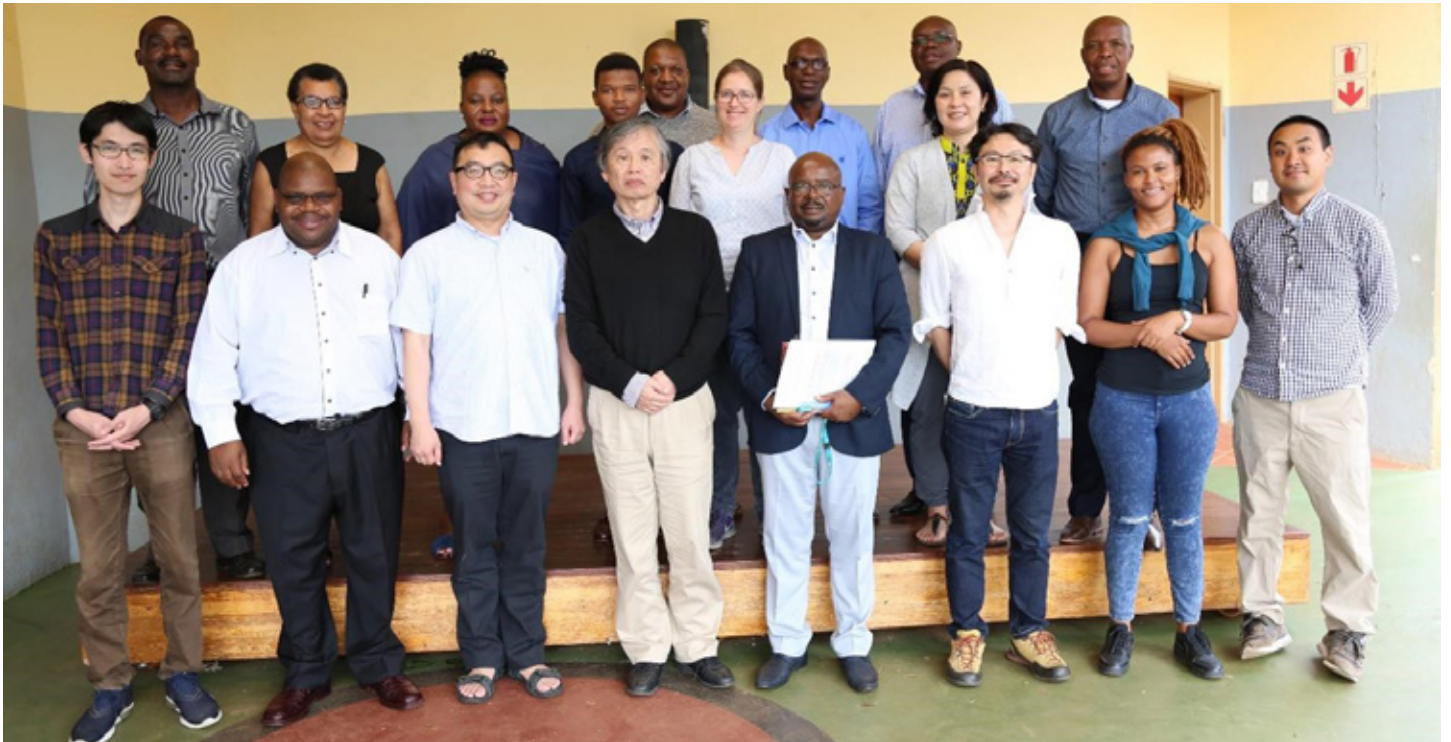
Workshop participants posing for a group photo outside the University's Art Gallery

Language is important in every aspect of our lives because it allows people to communicate in a manner that enables the sharing of common ideas. Likewise, the University of Venda (UNIVEN) is currently the only institution that teaches more languages than any other University in South Africa.