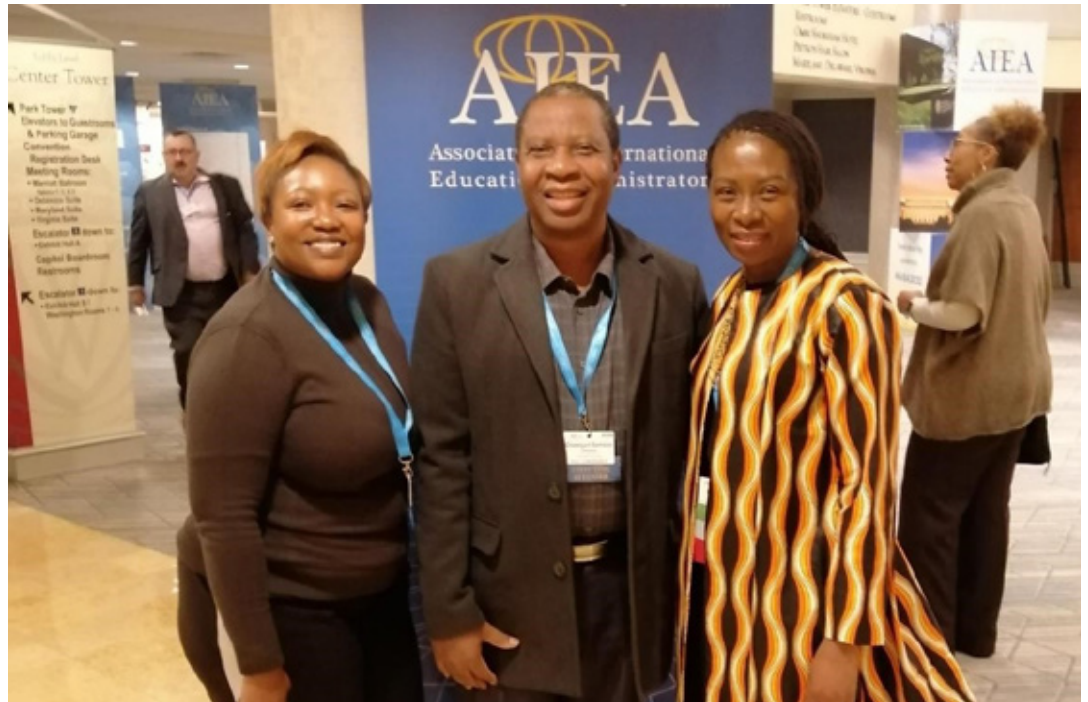
Some participants at the Conference

The theme of the conference was: Rethinking Comprehensive Internationalisation for a Global Generation.