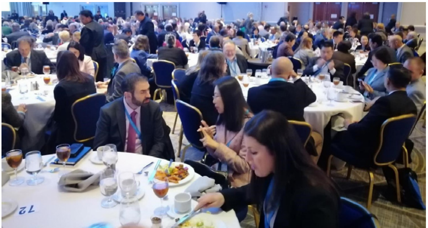
Cross-section of participants at AIEA conference