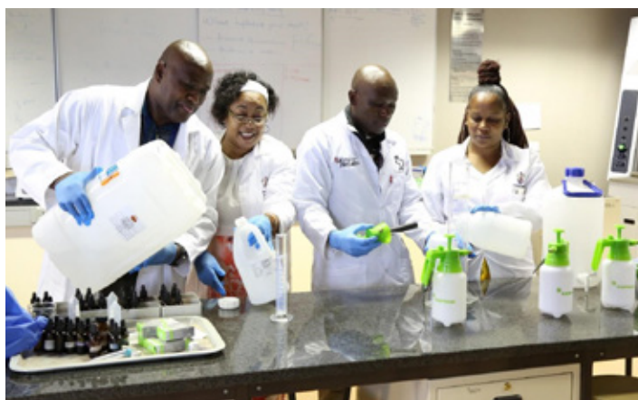
Some members of a hygiene group busy producing sanitiser and surface disinfectant at the Lab

The hand sanitiser is made from ethanol, glycerol and essential oils (sourced from different plants) to keep your hands moisturised while disinfecting them. The surface disinfectant is a diluted hydrochloride solution and is used to disinfect windows and working surfaces. The University is in the process of looking at the potential of making these products available to the community at a reasonable price together with proper hygiene education brochures as part of the community engagement activities and social responsibility.