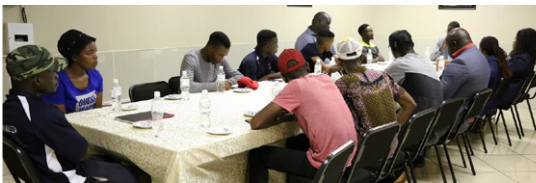
SRC members engaging with the Vice-Chancellor and Principal

Some members of SRC expressed that there is a need to build proper channels to interact with the Management of the University and hopefully this meeting is the beginning. They also mentioned that the matter of outdated books in the Library should be given the attention it deserves.