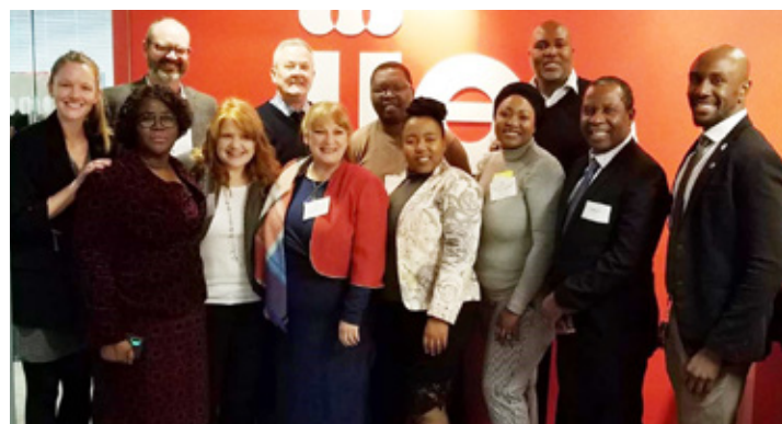
SA delegates and hosts at the IIE office, Washington DC