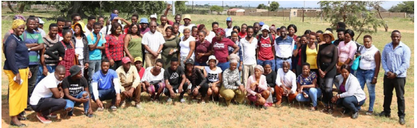
Group photo on day two (2) of the workshop