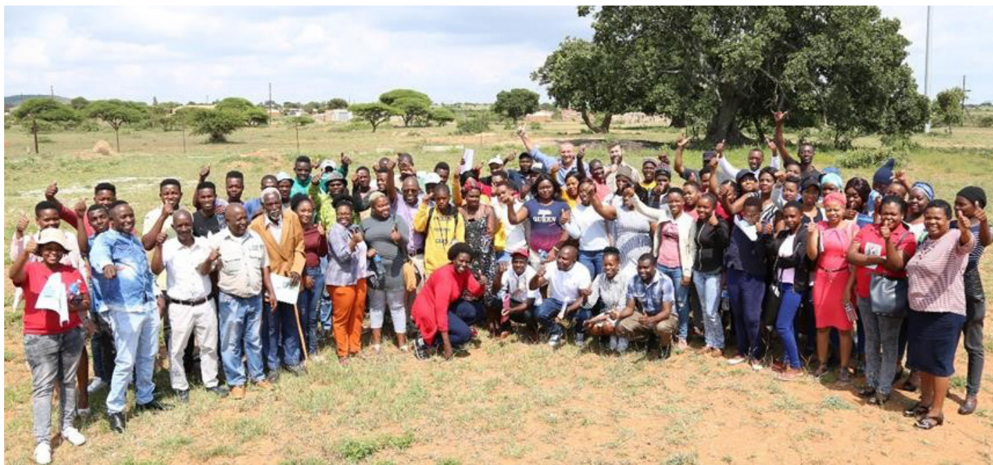
Workshop attendees posing for a group photo outside the hall in which the workshop was held