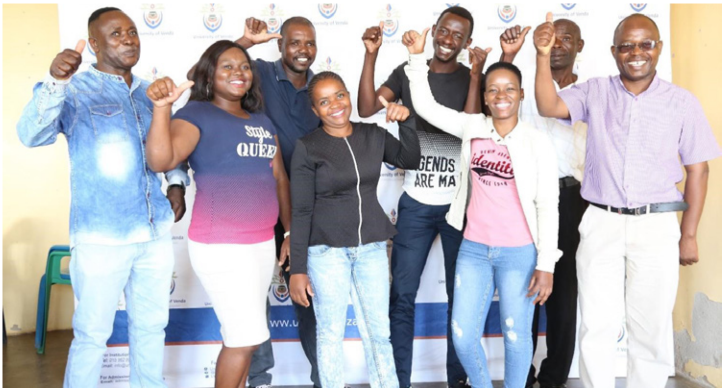
Thumbs up for the project by facilitators and participants of the workshop