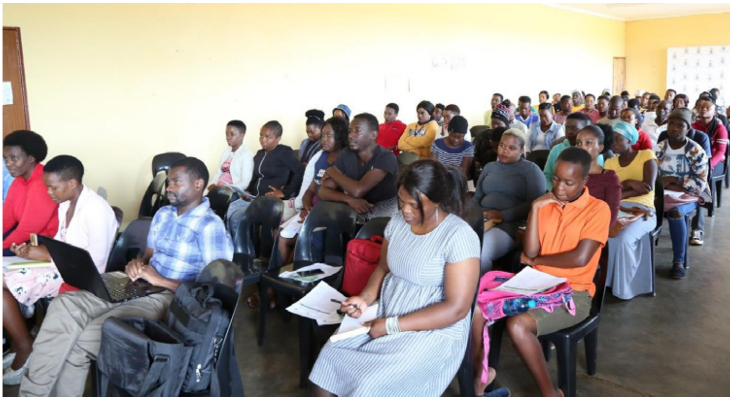
Workshop attendees listening to the facilitators

The main aims of this project are to strengthen the institutional capacity as well as addressing the insufficient technical capacity through skills training, awareness raising and the development of knowledge products, in support of reducing risk of industry of waste to energy conversion.