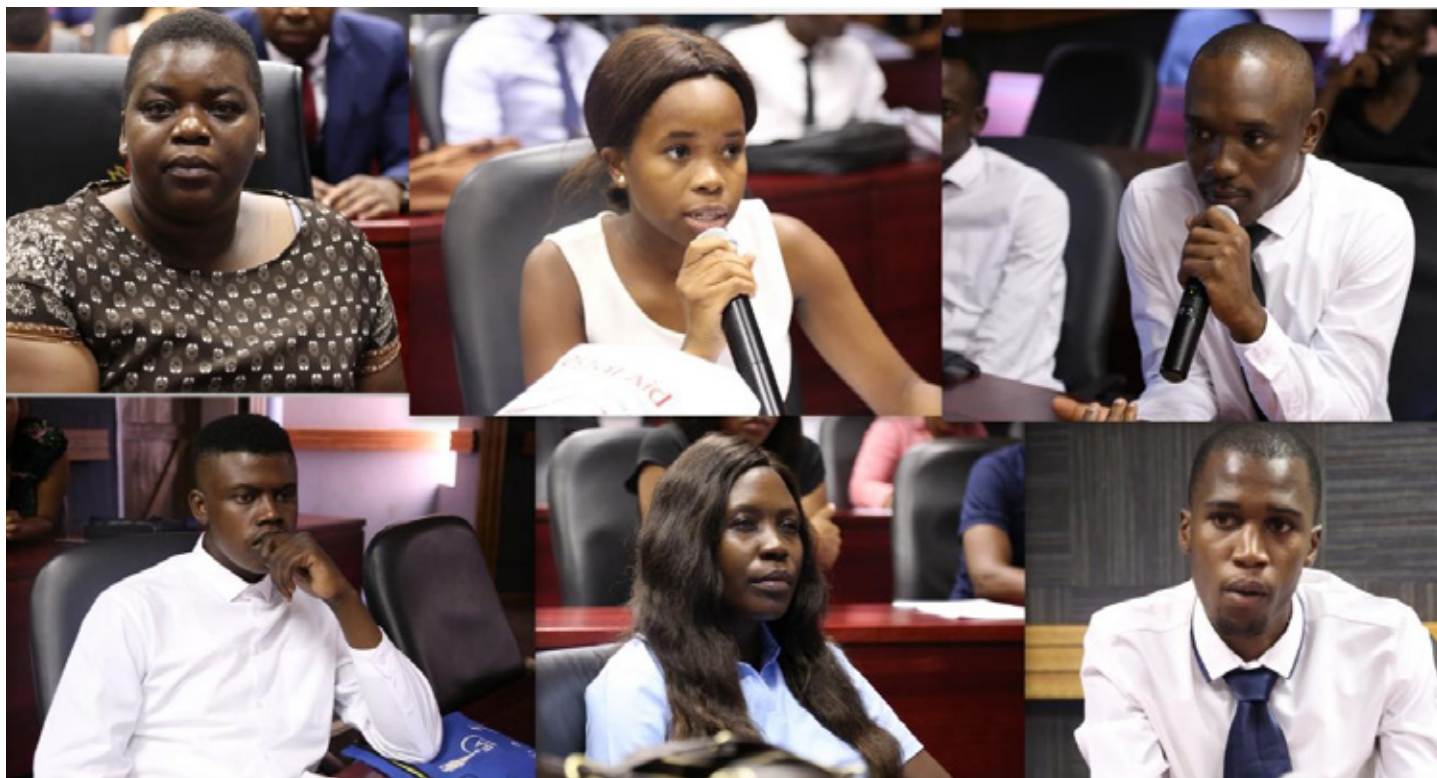
A very valuable informative discussion sparked a lot of interest as students kept asking questions even after the session