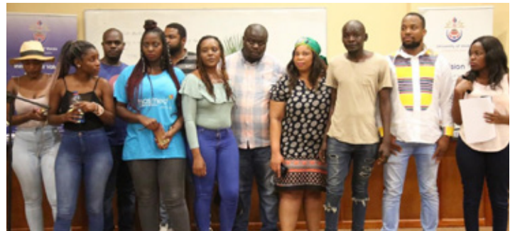
All-inclusive Executive Committee of Vhembe Alumni Chapter