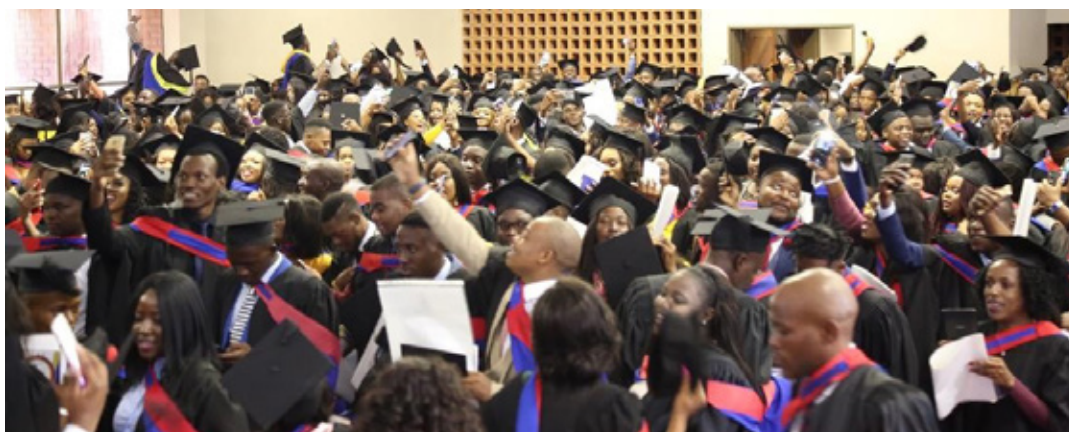
Univen graduandi celebrating their achievements at the university Auditorium

As every university's ritual, graduation is one of the most important occasions in the University's academic calendar where students, both undergraduate and post-graduate, receive their hard-earned degrees and diplomas.