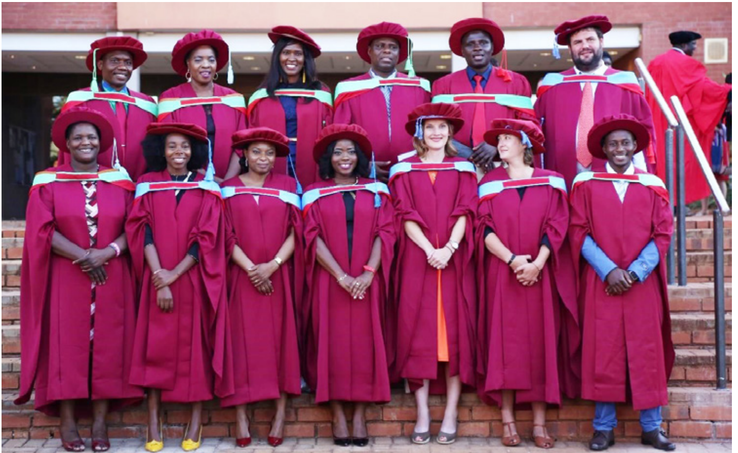
PhD Graduates posing for a photo