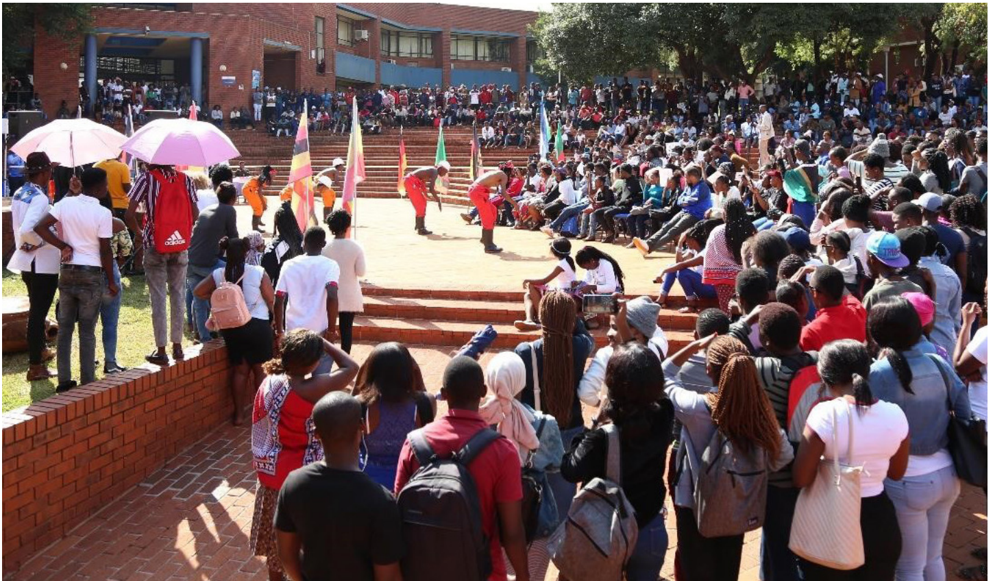
The audience during the 2019 Africa Day celebration at Freedom square