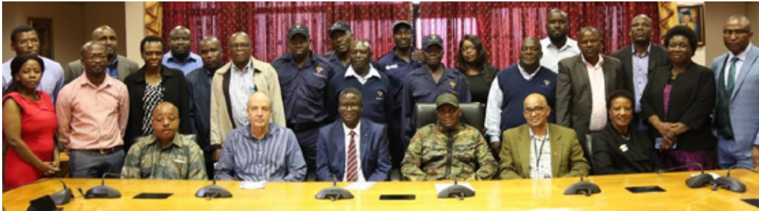
Members of senior managers, Protection Services staff and representatives from SAPS pose for a photo after the event

everywhere you go. I hope you will get an opportunity to make a mark where you are going. You are one person that every time there was unrest on campus, you would respond and handle things very quick". He further wished him and his family well even where he is going.