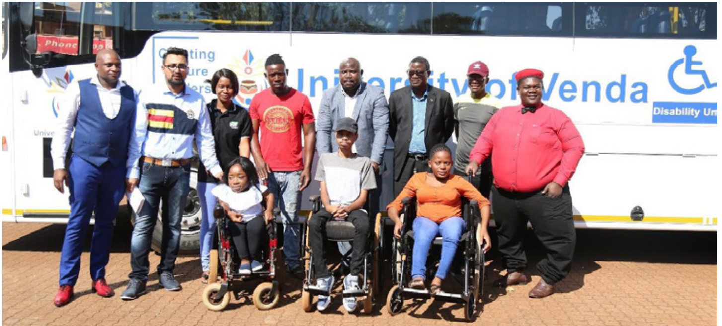
Students living with disability posing for a group photo with SRC President (in red t-shirt) and the Vice-Chancellor and Principal (Standing third from right) and other SRC and staff members