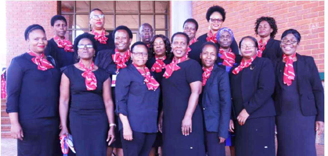
Above: Beautiful team that provides professional ushering during graduation ceremonies