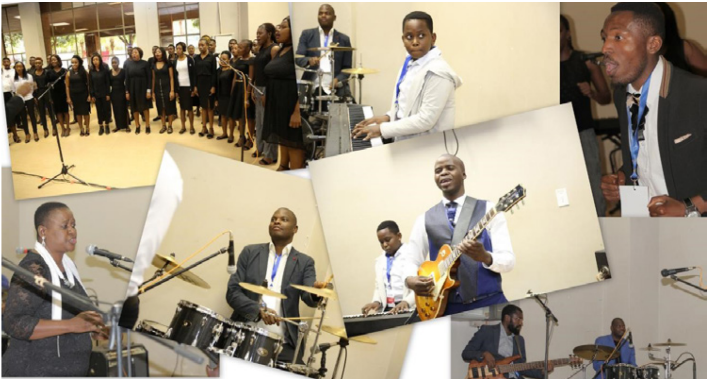
Above: Univen choir entertaining the audience