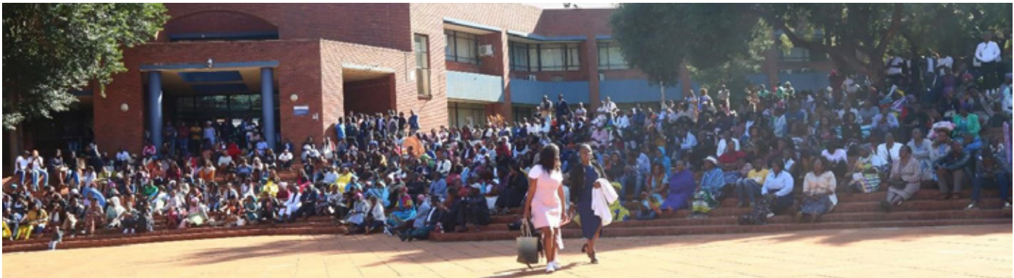
Friends and families of graduandi watching their loved ones graduating on the screen outside the University Auditorium