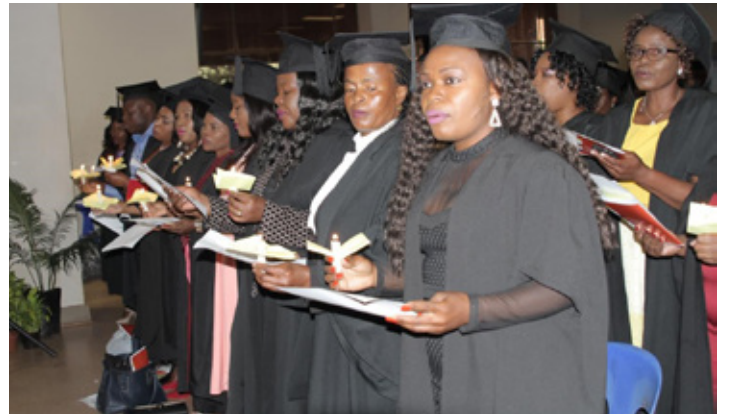
Above: Ready to serve the nation: Students in Nursing Science taking oath during graduation