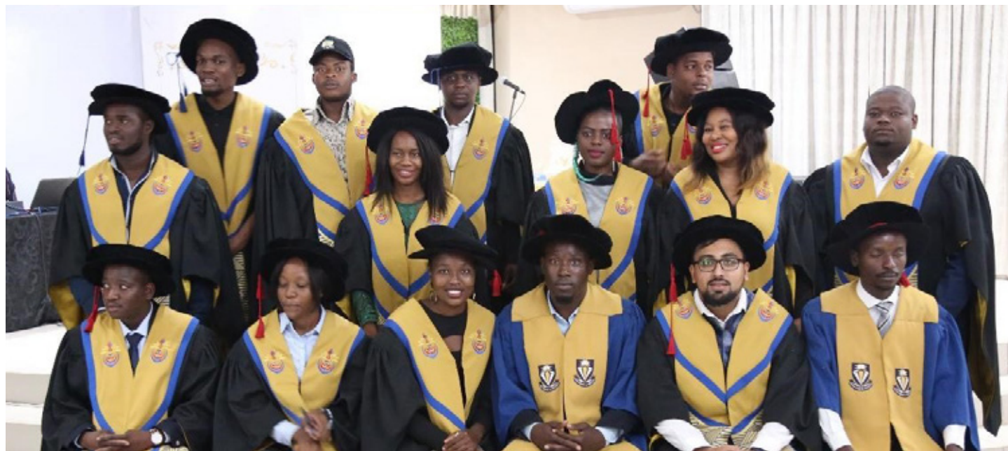
SRC Cabinet Members posing for a group photo after the oath taking ceremony