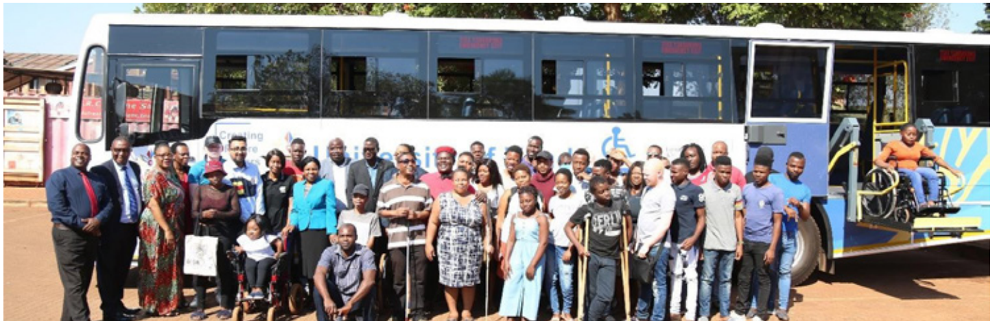
A group photo of students living with disabilities with the Vice-Chancellor and Principal, some of SRC Members and other staff members posing for a photo in front of the adapted bus