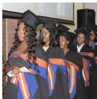
Female students graduating in numbers during 2019 May graduation

During this graduation ceremonies, Honorable Kgalema Motlanthe, conferred 3066 certificates, diplomas and degrees to deserving students who have achieved high levels of academic excellence in the fields of law, human and social sciences, mathematical and natural sciences, health sciences, environmental sciences, education, agriculture and management sciences. 20 doctoral degrees, 53 masters, honours 188 and 2807 bachelor's degrees, diplomas and certificates were awarded during these graduation sessions. The majority of graduates for the 2019 May graduation ceremonies were female students compared to their male counterparts. A total of 1830 female students received their degrees