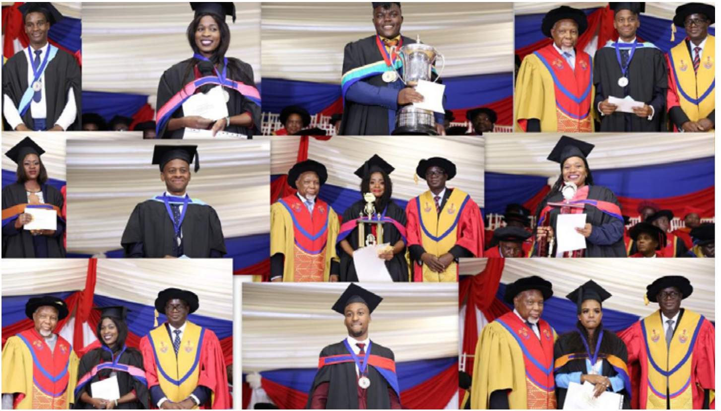
Above: Recipients of the awards during the 2019 May graduation ceremonies posing with the Chancellor together with the Vice Chancellor and Principal