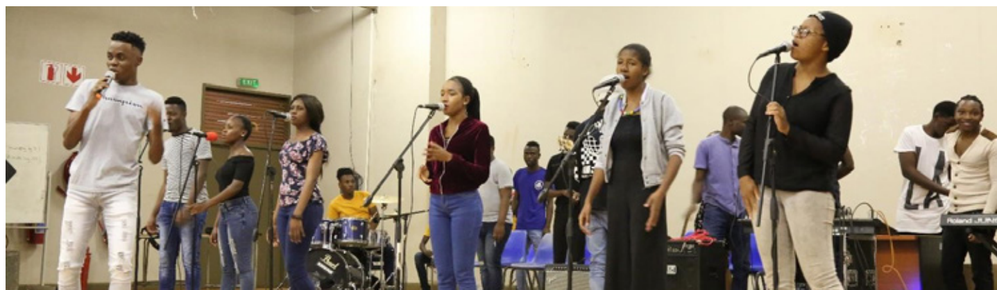
Worship team singing during exam prayer service