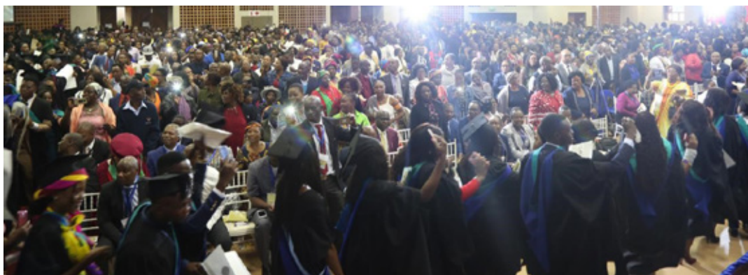
Happy moments: students celebrating their achievements during graduation