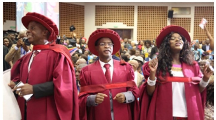
PhD graduates dancing at the Auditorium after being capped