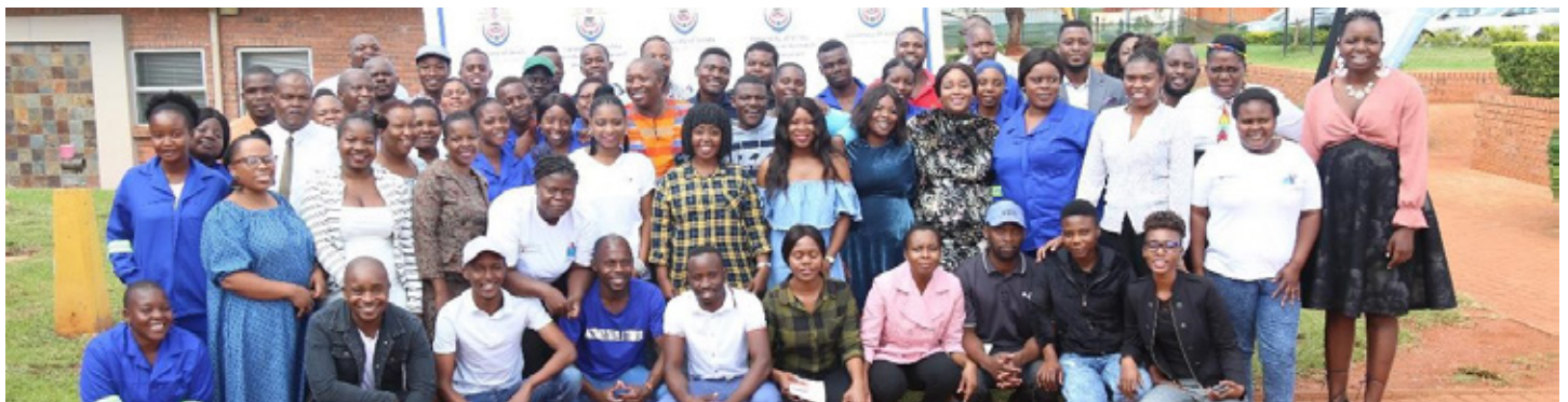
Attendees of the workshop posing for a group photo outside Research Conference Centre