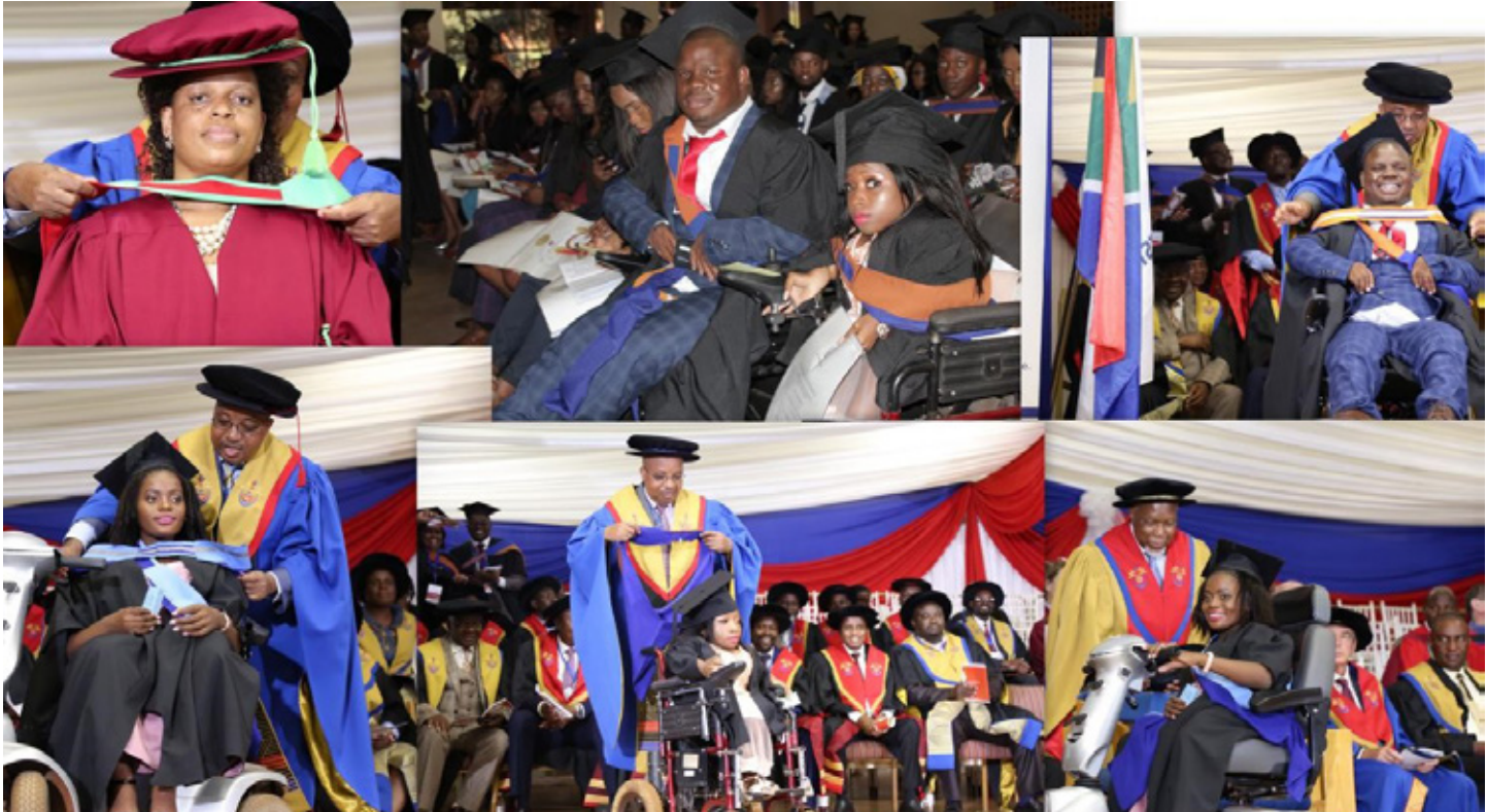
Against all odds: Students living with disability graduating during 2019 May graduation