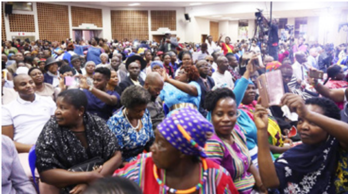
Parents of graduandi looking at their children and relatives who were dancing after being awarded with their degrees