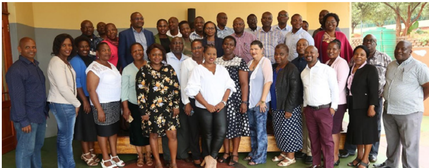
Above: group photos that were taken on different days of one day series of the workshop