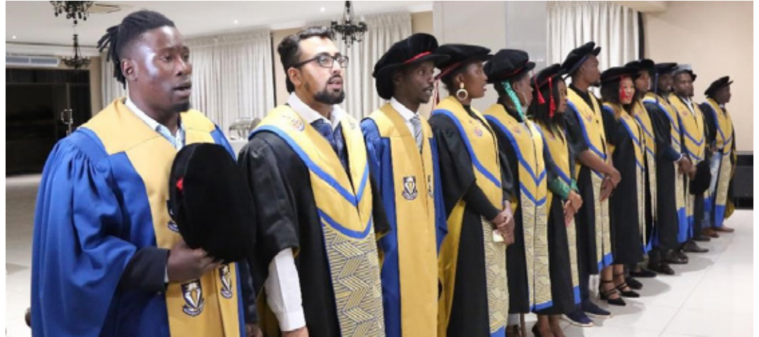
SRC Cabinet members singing the national anthem before they could be inaugurated

"This University will produce entrepreneurial products. We want our students to create their own jobs. Once you complete your degrees, you will be competing with other people from other institutions. We will also build reputation for our University. We need