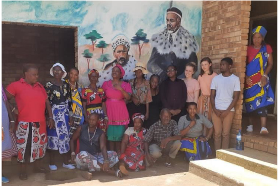
Some of the group members posing for a photo in-front of the Muhlava royal house

Amongst other things, students learned that as young indigenous knowledge practitioners, they should admit that learning should go beyond boundaries; there is a need for knowledge holders to be informed about ways of interacting with researchers and other stakeholders in a manner that does not make them vulnerable; there is a need for traditional healers to be informed about intellectual property rights to prevent them from constantly becoming victims of the loss of their innovations and knowledge for commercial purposes.