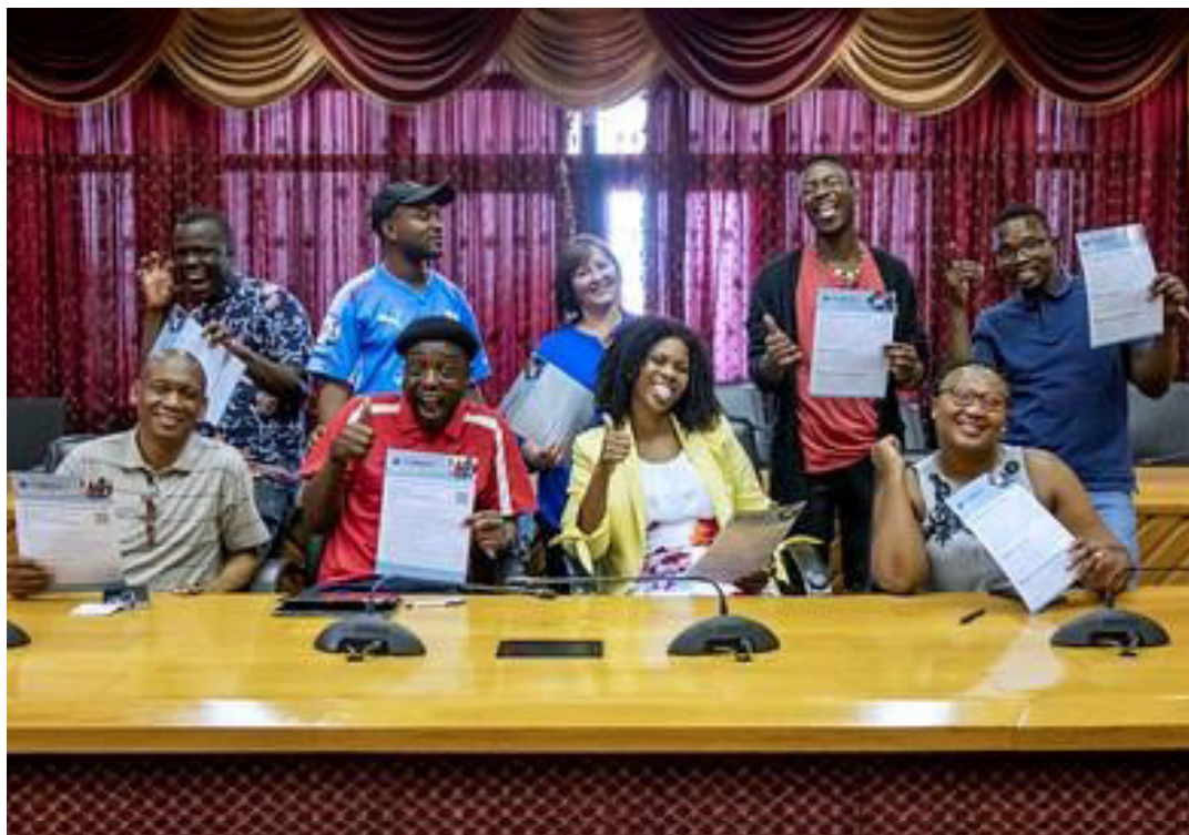
Some of the participants at the Information Session