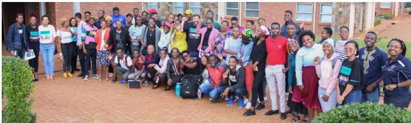
Group photo for all the participants