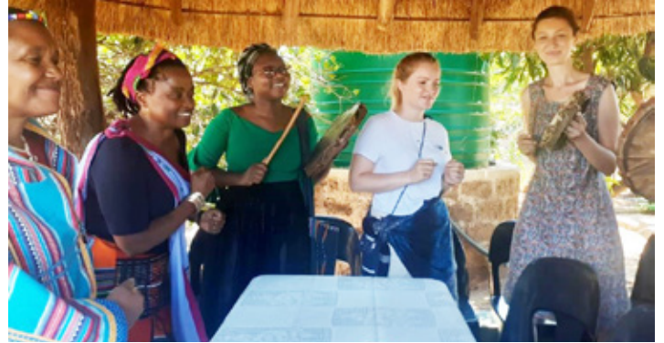
Conversational songs and drumming during one of the sessions

Community Engagement Directorate intend to organise a workshop aimed at empowering knowledge holders and traditional health practitioners. The UNIVEN IKS Student Chapter further intends to organise a workshop with supervision of the respective mentors in IKS.