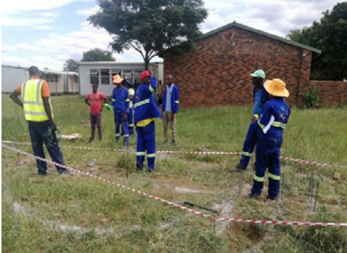
Trainees at Tiyani Secondary School in Magoro marking an 18 cubic metre digester