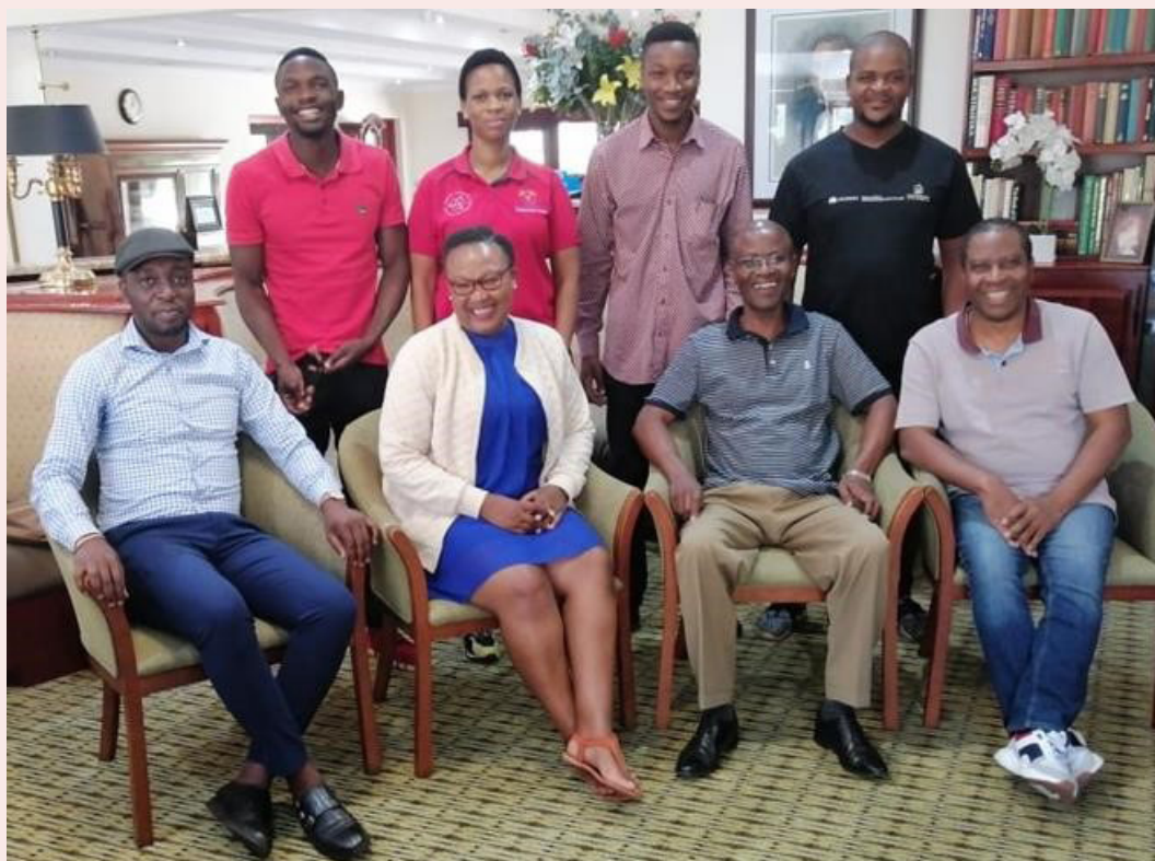
Some of the participants at the Workshop

career exhibitions both nationally and internationally by the two offices and at the same time monitoring and evaluating the numbers.