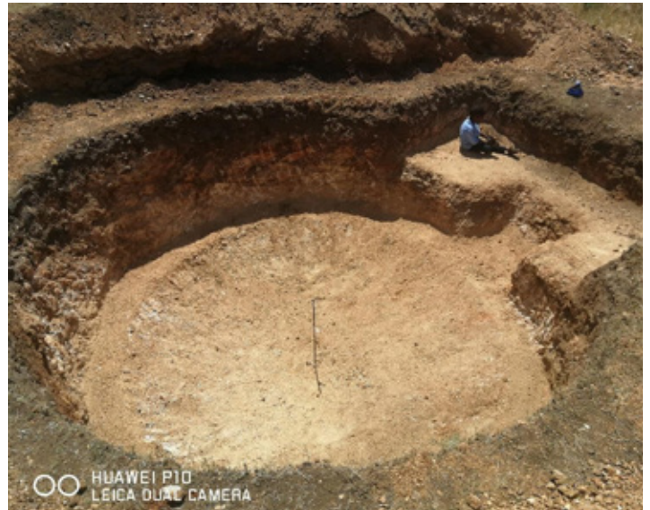
Prepared digester hole ready for foundation cast at Njhunga Primary School in Bungeni