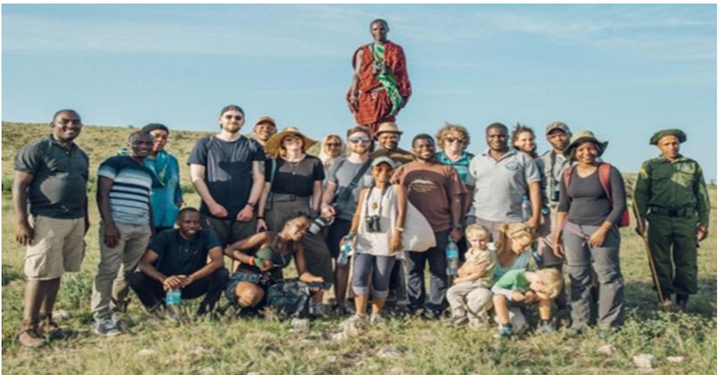
Some of the participants during the Safari game drive