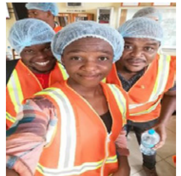
UNIVEN students during the workshop in Tanzania