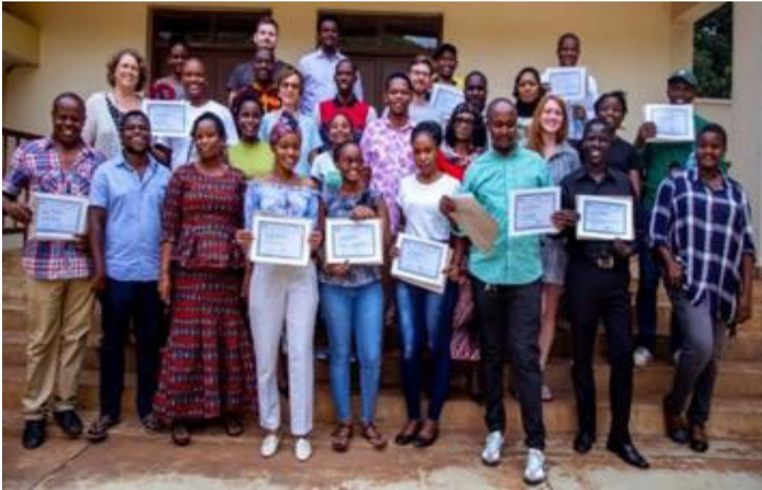
Participants showing their certificates after the workshop

Finance Management (IFM) in Dares-Salam. The Baden-Wuerttemberg Cooperative University in Heidenheim, Germany is the African-European collaborative project for student and staff exchange who participated in the event. The main objective of the workshop was to brainstorm and develop a prototype or agricultural plan to assist the Kilimanjaro region to enhance their tourism potentials and crop yields.