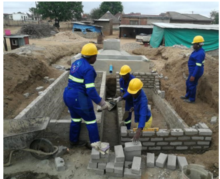
Trainees finalizing the construction of the compost pits for a twelve cubic metre digester constructed at Manjorjo Farm in Magoro

The University represented by the Department of Physics was in 2014 sponsored by the Limpopo Department of Economic Development, Environment and Tourism (LEDET) to enhance its awareness programmes on the development of green economy in the province with the intention of establishing a Green Economy Centre of Excellence. Building on the positive results achieved from the technology awareness and training activities done around communities of Vhembe District, several sponsors from both within the country and international got interested to support the drive's efforts. One of the most impactful project is the Global Environment Fund (GEF) funded project, "Promoting Organic Waste-to-Energy and Other Low-Carbon Technologies in Small, Medium and Micro-Scale Enterprises (SMMES): Accelerating Biogas Market Development", administered by the United Nations Industrial Development Organization, (UNIDO).