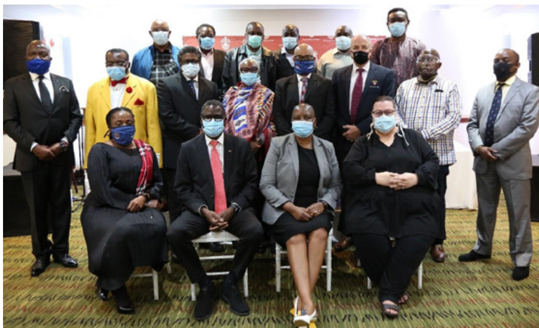
A group photo of UNIVEN Senior Management