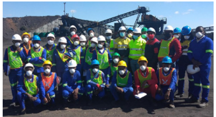
A group photo taken during the visit at Maboko Colliery