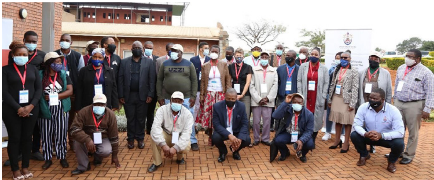
Some of the attendees of 2021 PEER Conference

It was acknowledged during the conference that many smallholder farmers in South Africa and Zambia are already responding to water security challenges; they have initiated a number of initiatives in that regard. The delegates reaffirmed the role of water security in ensuring food productivity and sustainability. They observed that achieving basic water security along agricultural value chains for local economic development was of major regional and national priority. Improving water security for smallholder farmers will require significant investments in local institutions and infrastructure for meaningful progress to be made. Opportunities for successful investments in water security projects will largely be contingent on strong commitment and dedication from all the concerned parties including government, financiers, and local communities. In that regard, the delegates endorsed and supported the notion of having ongoing water security dialogue involving smallholder farmers and other major economic players.