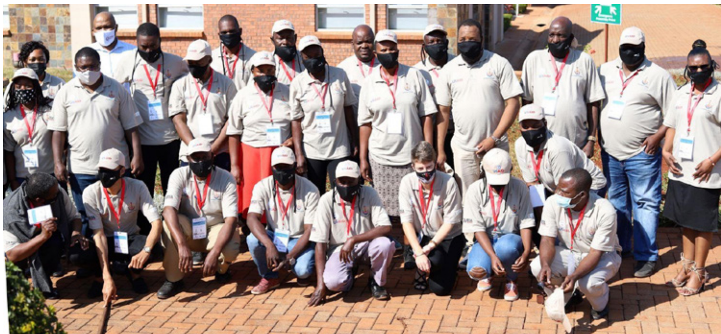
PEER Conference 2021 attendees with DSI delegate on the second day of the conference