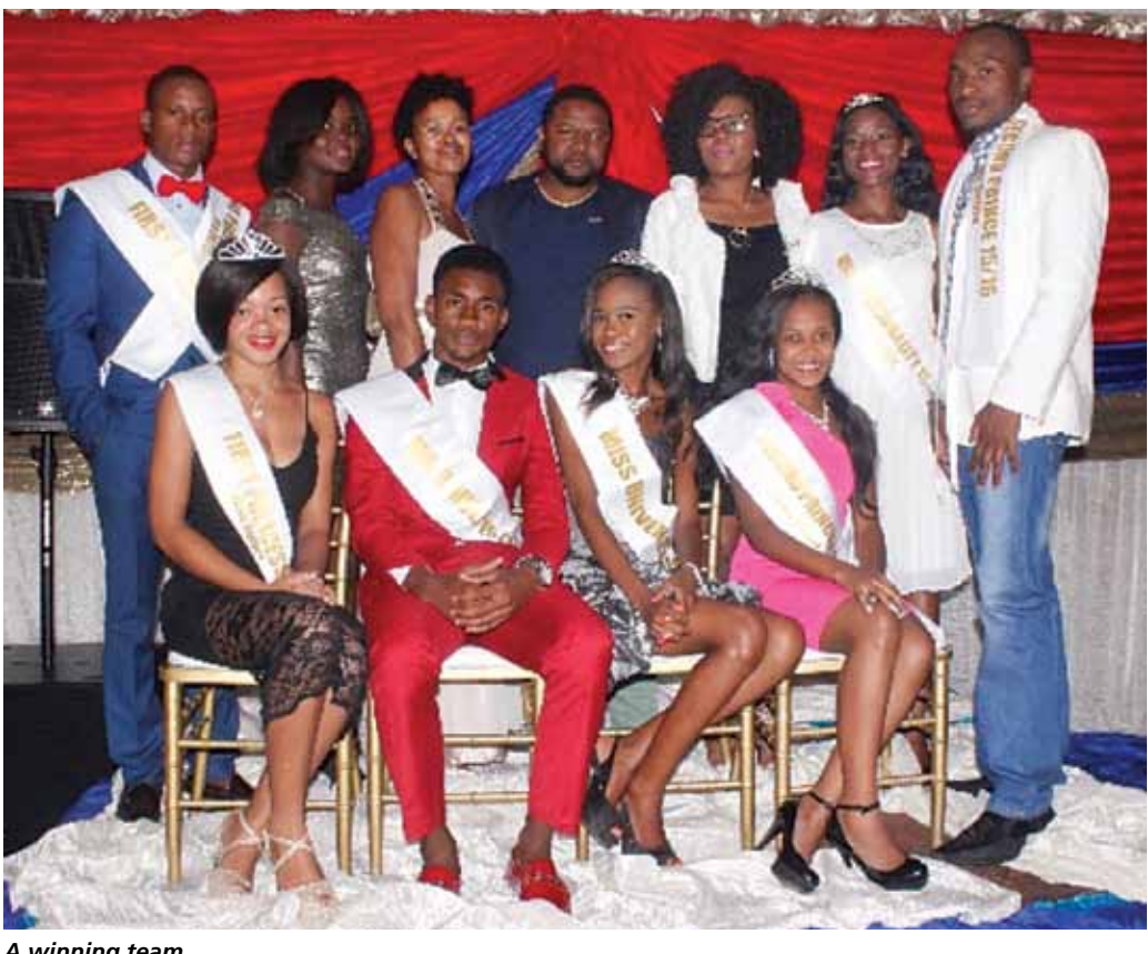
A winning team.