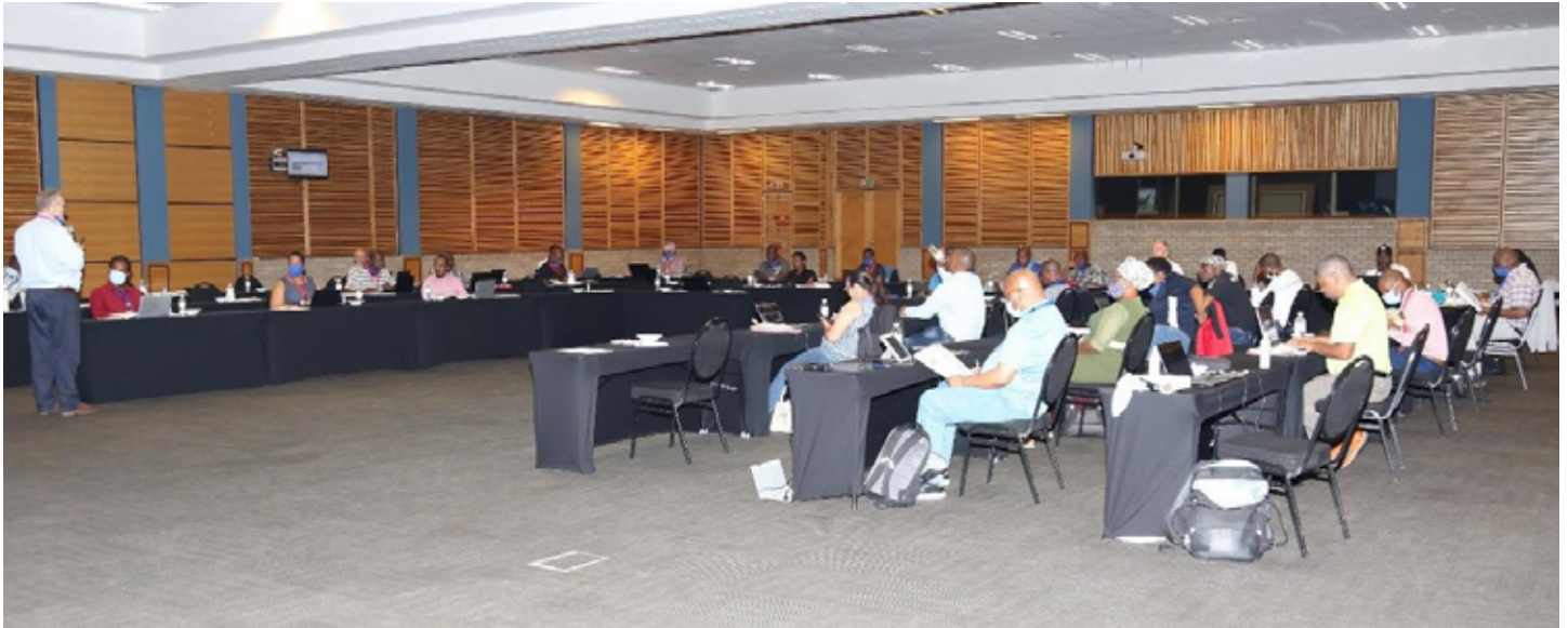
Workshop participants listening to the facilitator during the workshop