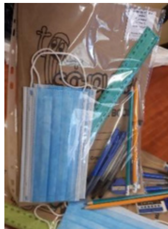
Right: Packed stationery packages ready to be delivered.