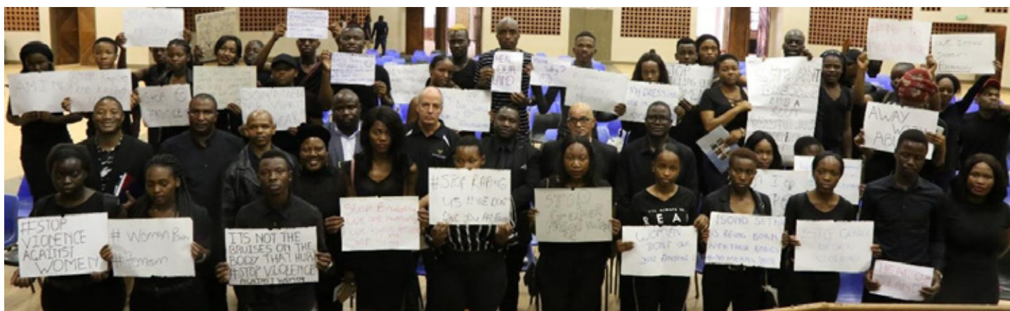
Students and Executive Management posing for a photo with posters with messages on gender based violence