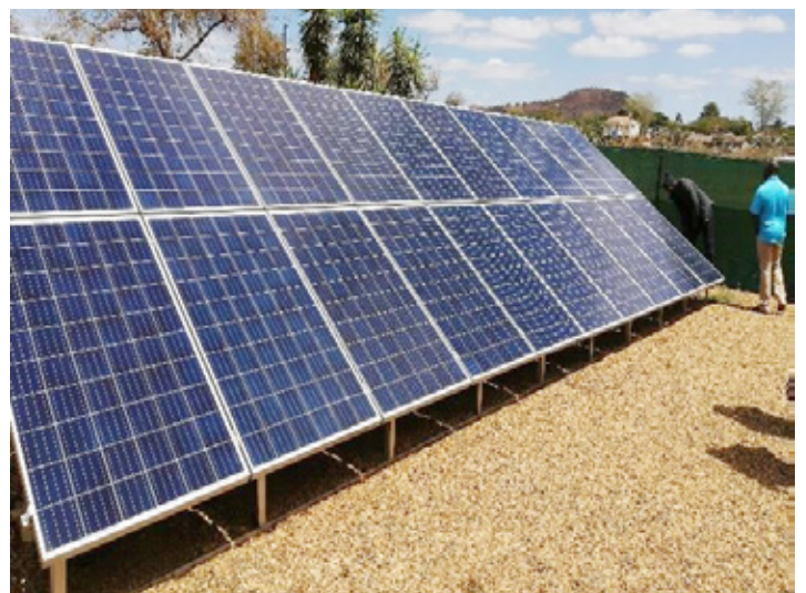
Eddy Covariance Flux Tower and the Solar Plant Available at Vuwani Science Resource Centre