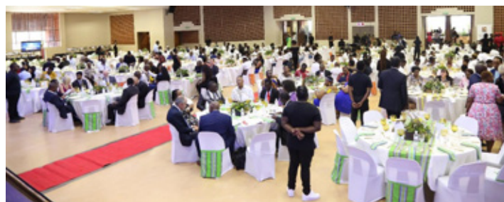
A view of the audience during the celebration