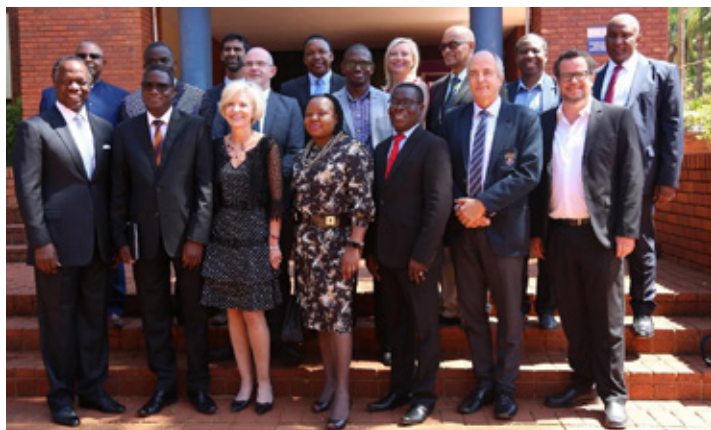
Officials from all partnering organisations pose for a group photo outside the Main Administration Building