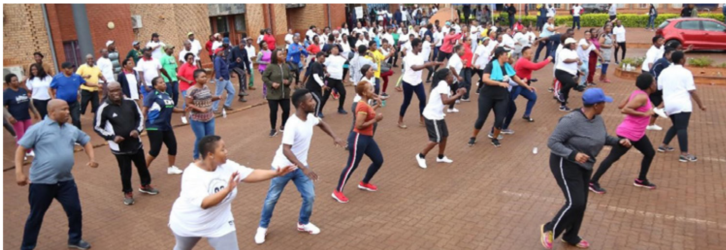
UNIVEN employees participating on aerobics