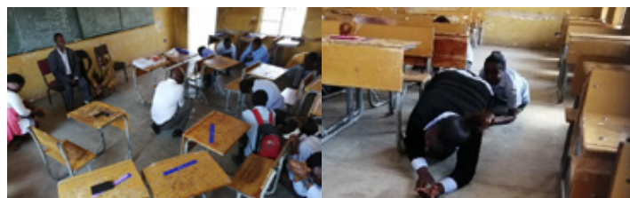
Learners and teachers bow in respect to the Chief