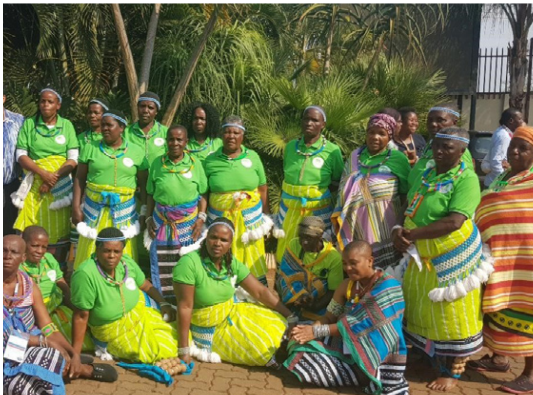
Delegates were entertained by Dzomo La Mupo (ladies in green golf shirts)

He advised students to write selling CVs.