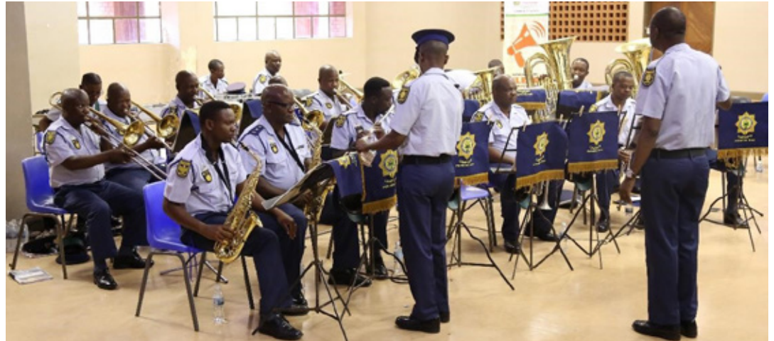
SAPS Band entertaining the audience