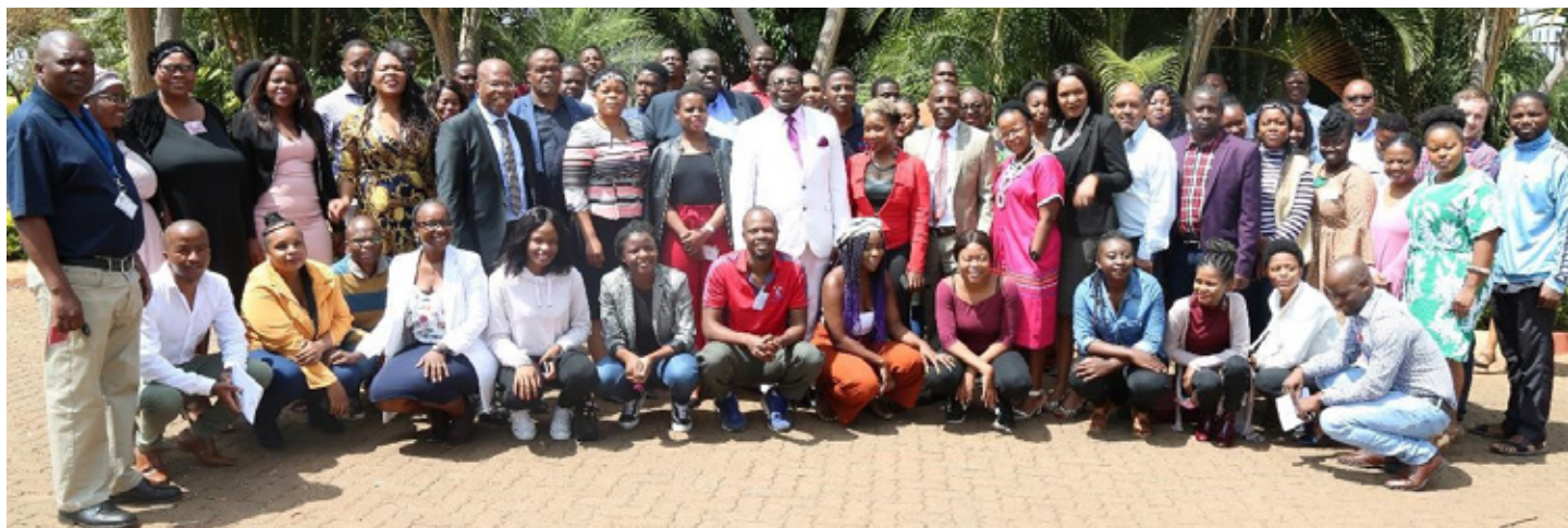
UNIVEN Researchers pose for a group photo with research indaba invited guests