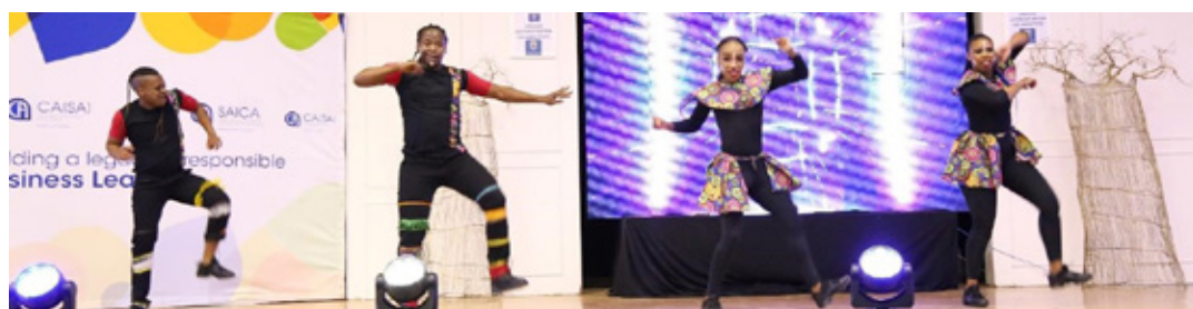
Performers entertaining the audience during the celebration ceremony of the SAICA accreditation

More than two million people in Limpopo live below the breadline. It is no wonder that there was great joy in the province as students, academics, members of the chartered accountancy profession, government officials and VIP guests gathered in the University of Venda's (UNIVEN) Auditorium to celebrate the accreditation of the University's BCom (Accounting Sciences) undergraduate degree by the South African Institute of Chartered Accountants (SAICA). This Accreditation celebration ceremony took place on Friday, 18 October 2019.