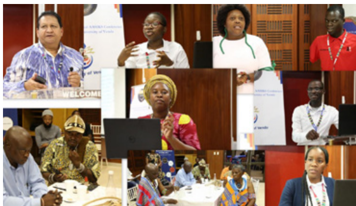
The 5th AASKIS Conference was organised by the Community Engagement Directorate at UNIVEN.