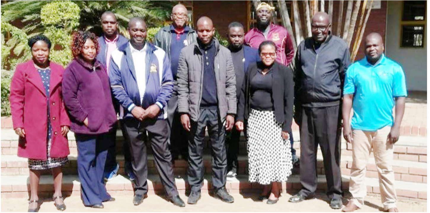
Workshop attendees and UNIVEN staff members posing for a group photo at Vuwani Science Resource Centre

As most of the researchers in the department of Physics are focusing on the renewable energy research, the workshop plays an important role in the department as part of renewable energy awareness and community engagement. The workshop is crucial since it was also part of skill transfer where the