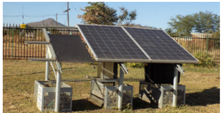
The solar plant with different types of solar panels for research purpose at Vuwani Science Resource Centre