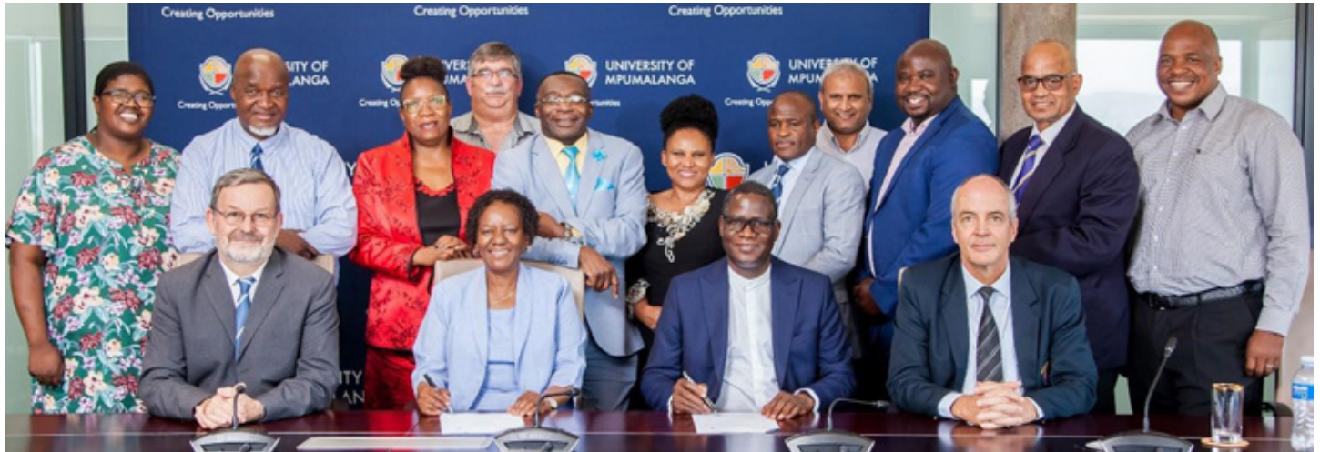
Colleagues from both UNIVEN and UMP who witnessed the MoU signing ceremony