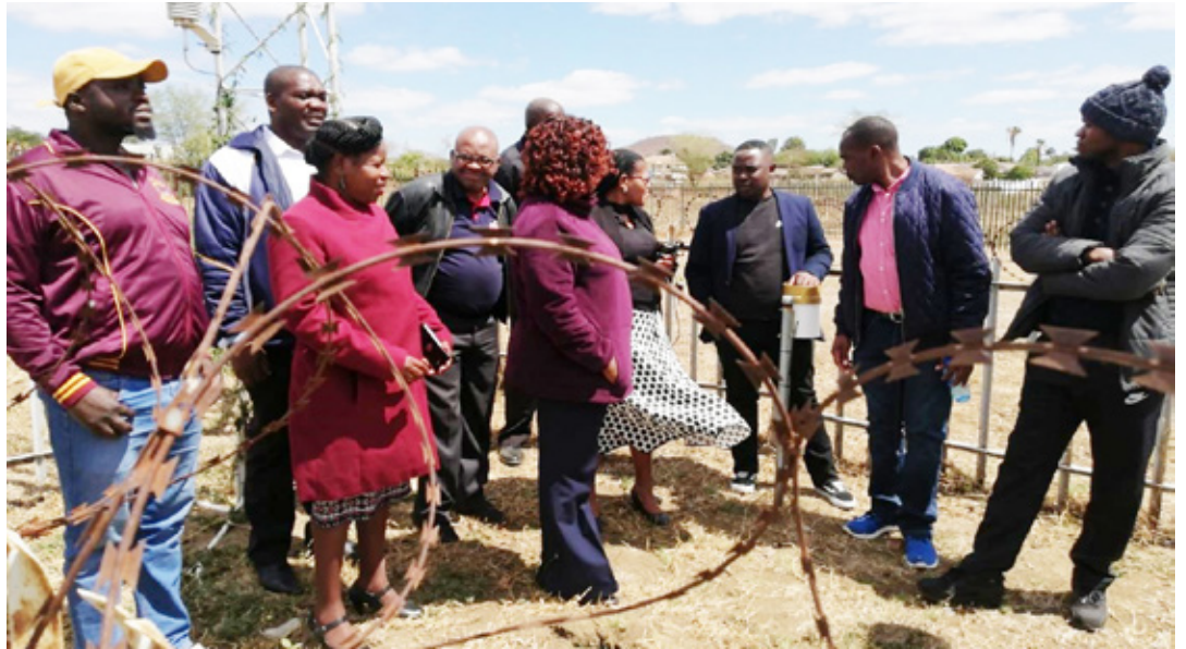
Participants at the weather station at Vuwani Science Resource Centre

More of the discussion was based on the renewable energy technologies like Biomass, Photovoltaic, Wind and Geothermal. Currently the most suitable technology in our region is the Solar Energy. A typical photovoltaic system employs solar panels, each comprising several solar cells, which generate electrical power. PV installations may be ground mounted, rooftop mounted, or wall mounted. The PVs may be fixed or use a solar tracker to follow the sun across the sky. This technology is currently one of the technologies which can be used in our region due to high availability of solar radiation throughout the year.