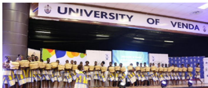
Cultural group entertaining the audience