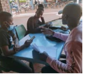
IRP officials promoting the ABE BAILEY opportunity to UNIVEN students