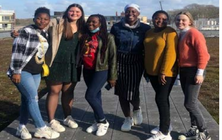
UNIVEN students at VIVES University of Applied Sciences

UNIVEN Students with other Students from VIVES University of Applied Sciences The students received a chance to work with people with disabilities, they learned a lot about them and acquired more skills that will assist in diversity and inclusion. Moreover, the students gained knowledge of different activities and equipment that is used in different sports codes and discovered a new