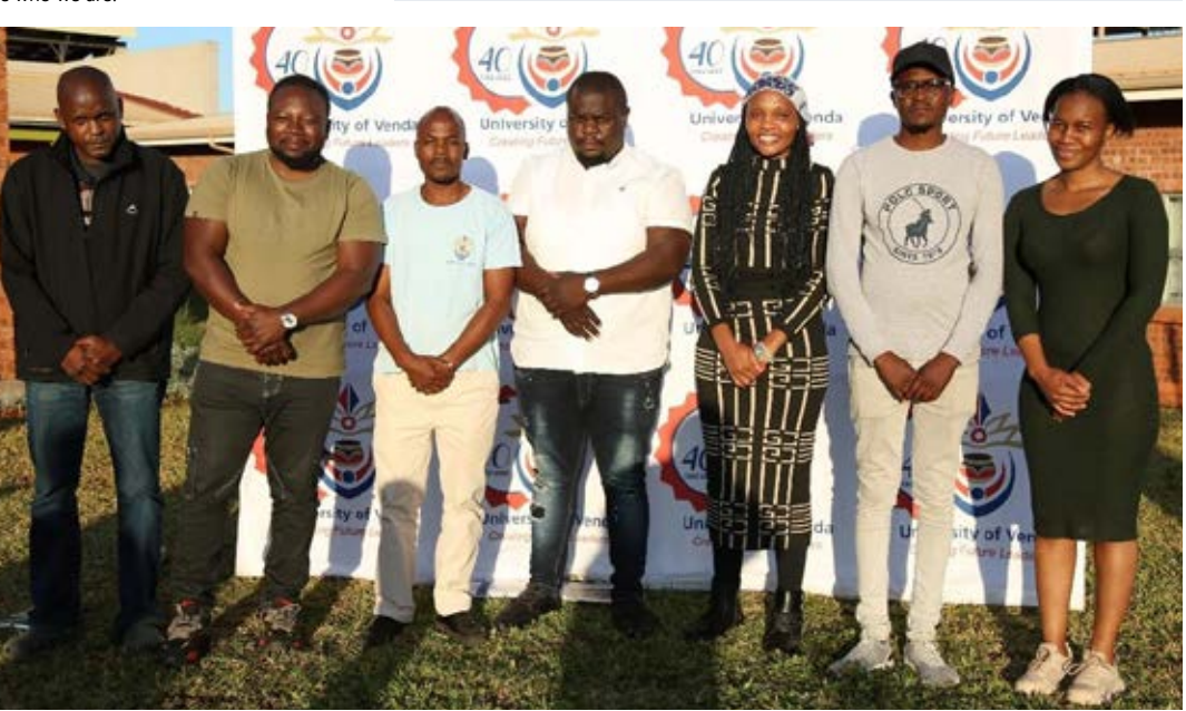
The newly elected UNIVEN Vhembe Alumni Chapter posing for a group photo