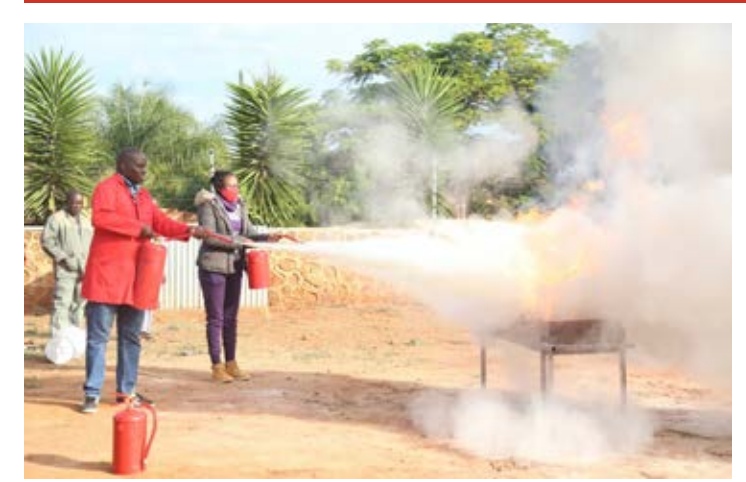
Staff members during the firefighting training

From Monday, 18th July to 22 July 2022, the University of Venda's Occupational Health and Safety (OHS) Office held the Health and Safety Workshop that included various courses to train the selected employees of the University about health and safety in the workplace. This training took place at Jericho Hotel and Resort. The courses/ modules that these staff members were trained on were: First Aid Course level 2 and Fire Fighting course. Amongst the trainees were committee members for Occupational Health and Safety representatives, members were selected from different departments, directorates, and faculties