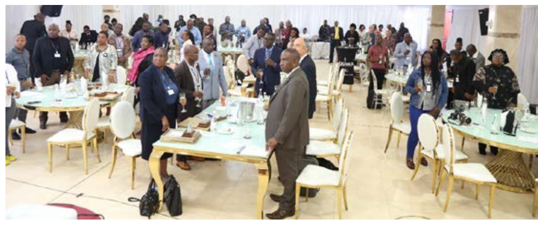
Attendees during the awards ceremon

Awardees posing for a photo with Senior and Executive Management