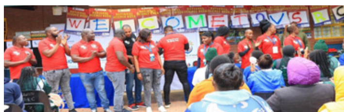
The team of staff and interns from Vuwani Science Resource Centre celebrating the good work they do in the surrounding community and are encouraged to continue making impact in the 2022 National science week.