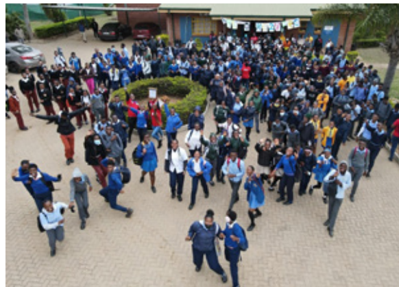
Left: Learners celebrating the official opening of the 2022 National Science Week shortly before refreshments.