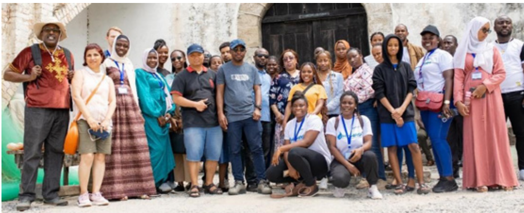
The Summer School participants visited the Cape Coast Castle