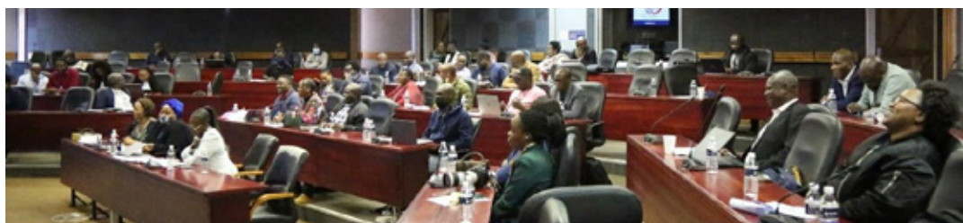
Attendees of Limpopo Research Forum during the meeting at Research Conference Centre

The University of Venda (UNIVEN) in partnership with Vhembe District Municipality, hosted a two-day Limpopo Research Forum (LRF) meeting that took place at UNIVEN's Research Conference Centre on 06-07 July 2022. The meeting was attended by representatives and presenters from Limpopo Office of the Premier, government departments, various institutions of higher learning, research organisations and independent researchers from across the country. The meeting was also attended by UNIVEN alumni who were coming from different institutions. Presentations focused on community engagement research, which fits under promoting science for societal impact. Of great importance, was the need for research uptake. Each should work diligently within the value chain to reach the outstanding mark of societal impact through research, innovation and transfer.