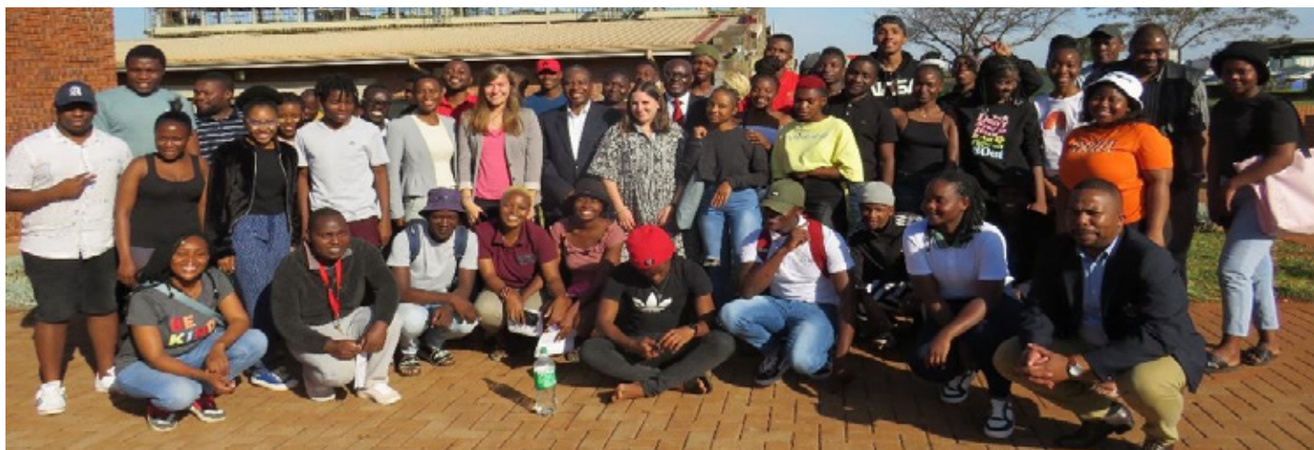
Delegates who attended the STEP Launch

The STEP 2022 launch was hosted at the University of Venda's Research Conference Centre on 15 August 2022. The event was attended by a total of 160 delegates including delegates from the University of Venda, University of Limpopo, Leuphana University (Germany) and United Nations Educational, Scientific and Cultural Organisation (UNESCO).