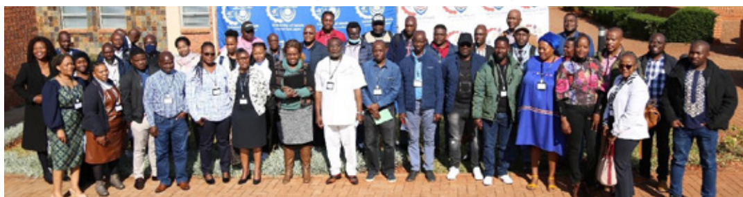
Members of Limpopo Research Forum posing for a picture outside Research Conference Centre on day two