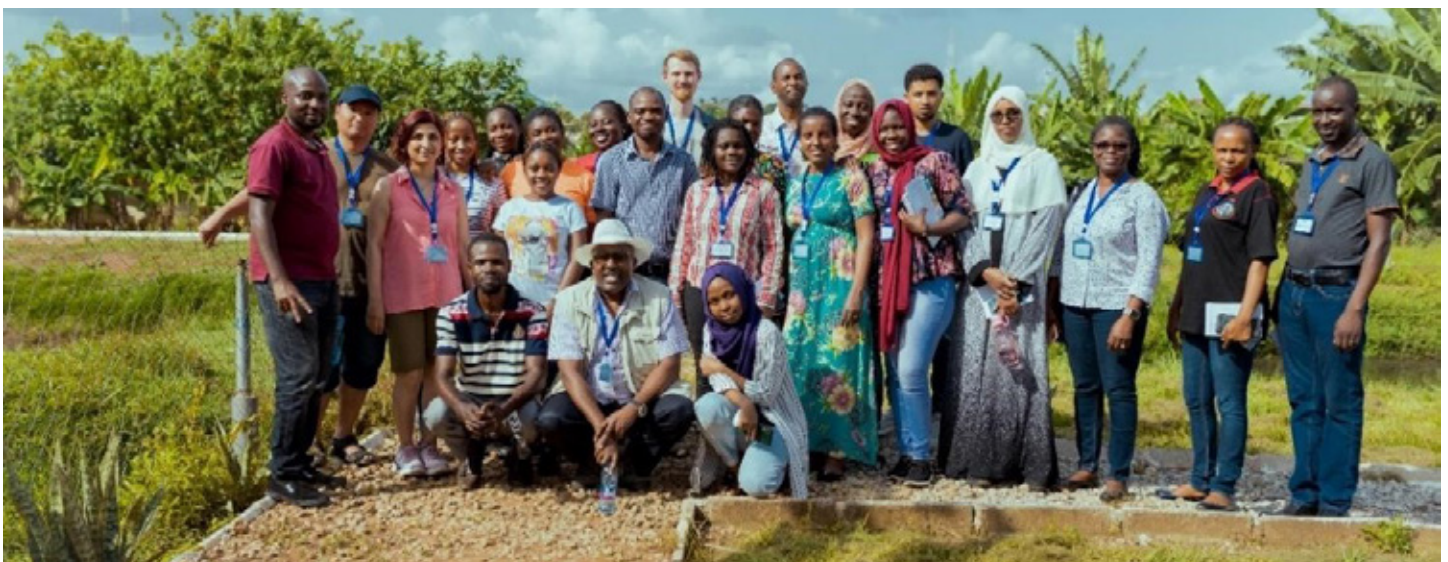
The Summer school participants visited an aquaculture plant (Compost farm)