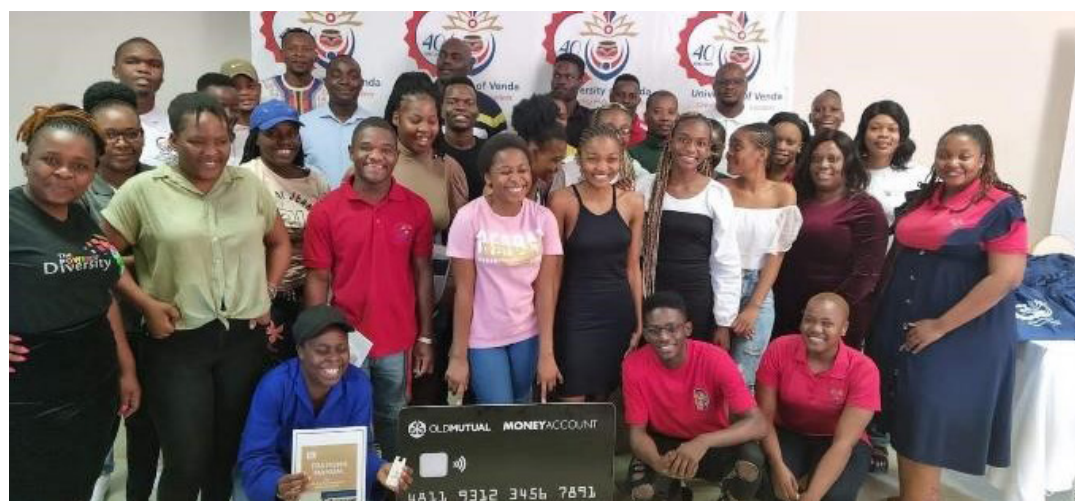
A group photo of attendees on day two