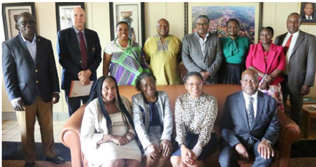
A group photo of UNIVEN representatives and the entourage of the Minister of Communications and Digital Technologies in the Vice-Chancellor's office