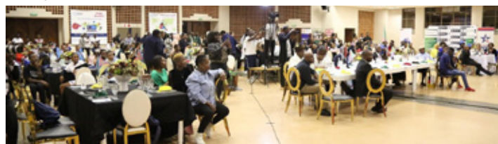
Attendees of the Internationalisation Evening