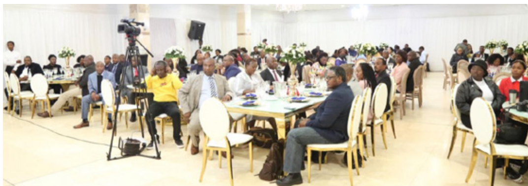
Attendees of the Vice-Chancellor's Merit Bursary Launch