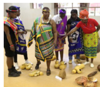
Indigenous pots (Tshidudu) and cups (Khavhelo) that were displayed