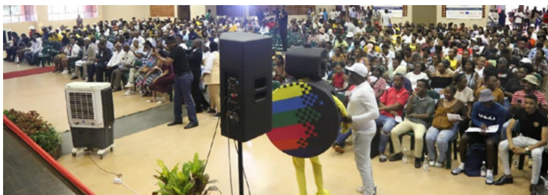
Some of the attendees listening to Minister Khumbudzo Ntshavheni during the Public Lecture