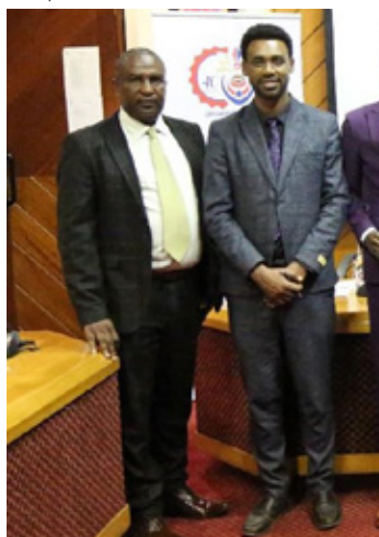
Group photo after the signing of the MoU