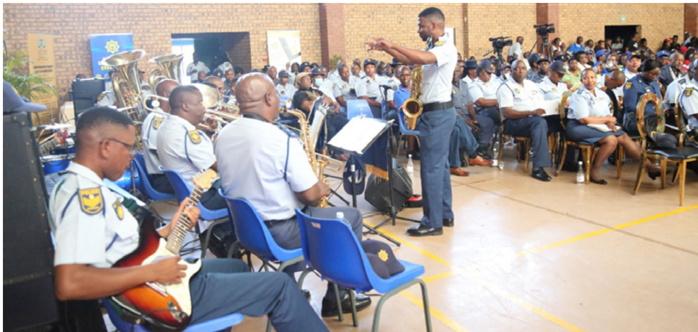
SAPS Band entertaining the audience