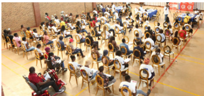
Attendees of the event at the Sports Hall