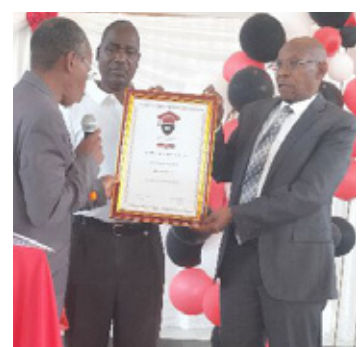
Mualuwa Shuma Foundation awarded living legends awards to stakeholders who are contributing to community development.