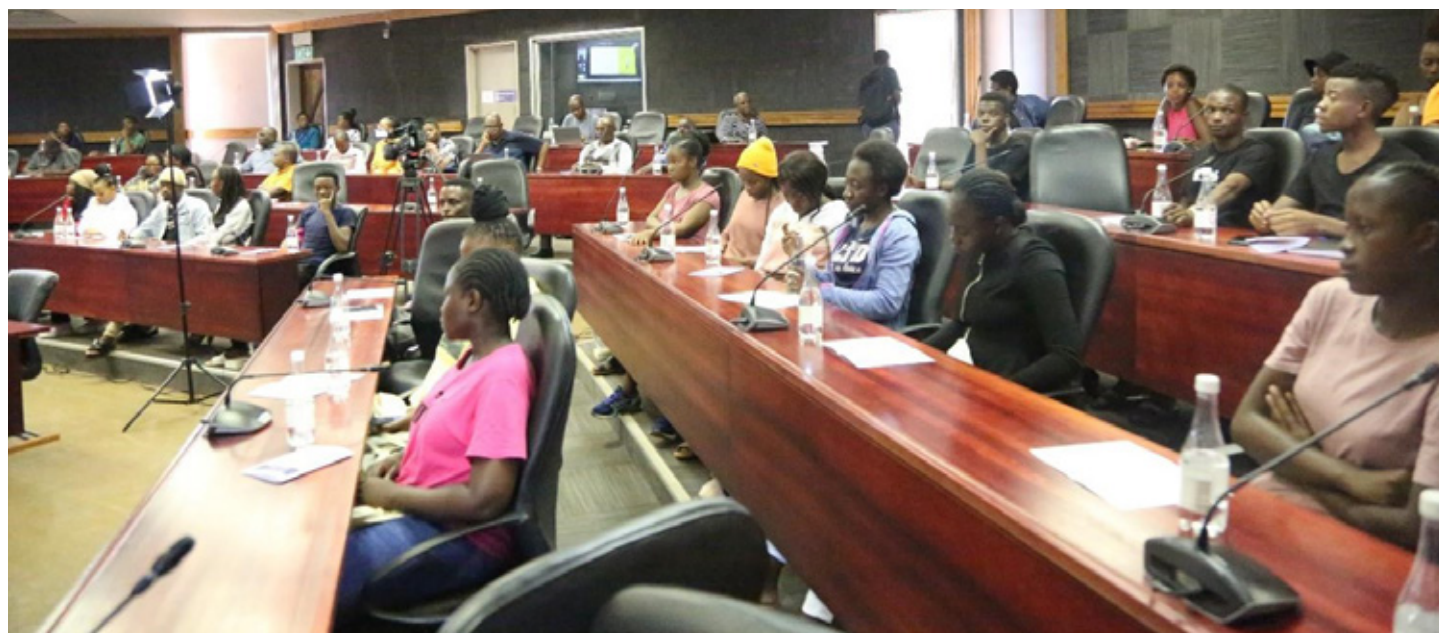
Some of the attendees of the public lecture at research conference centre