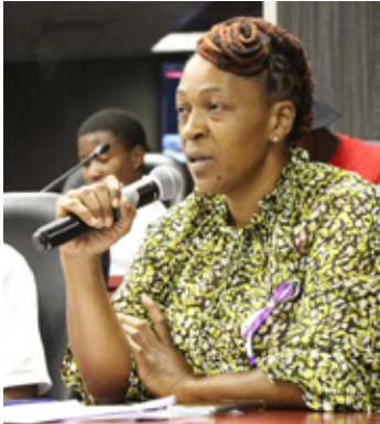
Staff members and students were also given an opportunity to comment and to ask questions