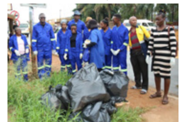
The Mayor of Thulamela Municipality together with UNIVEN Vice Chancellor and Principal posing for a photo with some of the cleaning campaign participants