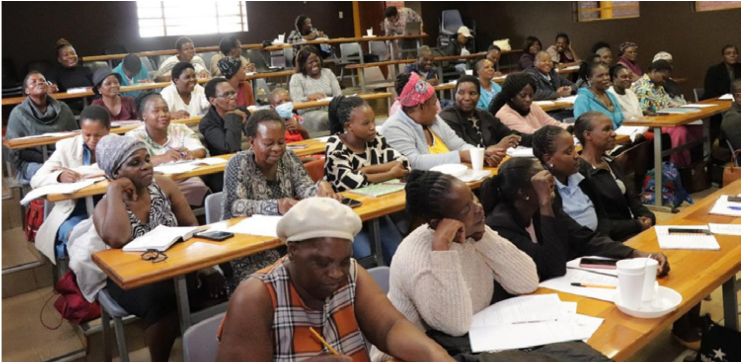
ECD Educators during the STEM presentation

Vuwani Science Resource Centre staff members are passionate about imparting science skills to ECD educators. They do it with the hope that children will gain interest in science at their earliest stages of life. Day Care Centres from Shayandima, Tshisaulu, Itsani, Vyeboom, Vuwani, and Tshivhulana (Tshimbupfe) areas were invited to participate in the skills nurturing workshop. More than eight Day Care Centres attended this Skills Nurturing Workshop. These Day Care Centres are: Superkids, Perseverance Day Care, Faranani Early Learning Centre, U a Londa Daycare Center, Aluwani, Mutshidzi Day Care Center, Vuwani Day Care Center, Tshikurukuru, Lotsha, and Ziggy Children Center.