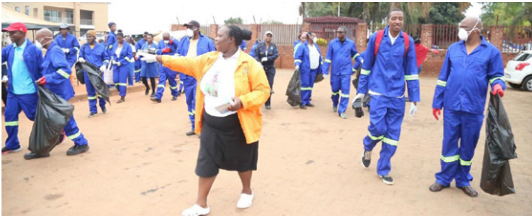
Participants during the cleaning campaign at Mvusuludzo Taxi Rank