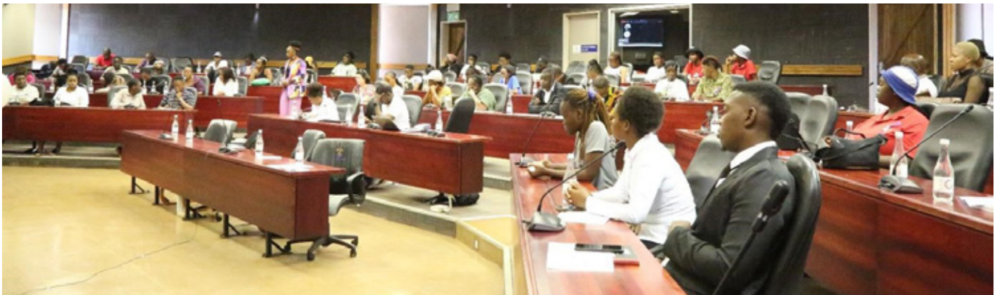
Attendees at Research Conference Centre during the International Women's Day Commemoration