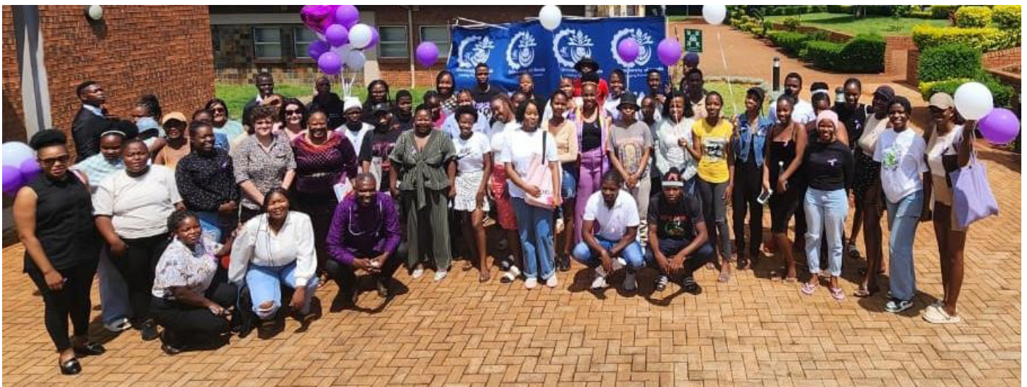
Group photo of attendees outside the Research Conference Centre