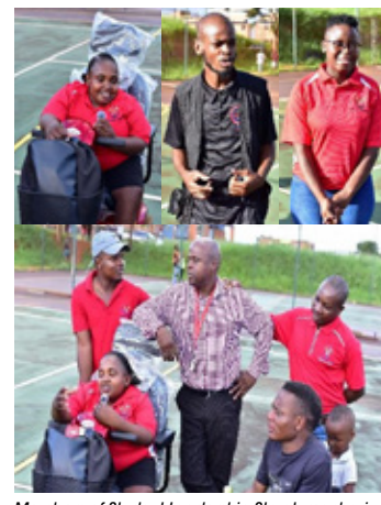
Members of Student Leadership Structures sharing message of support