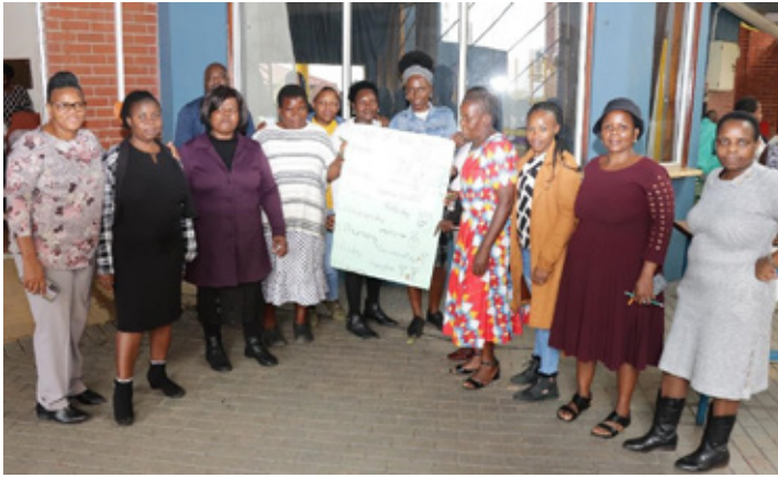
The winning group displaying their science activity