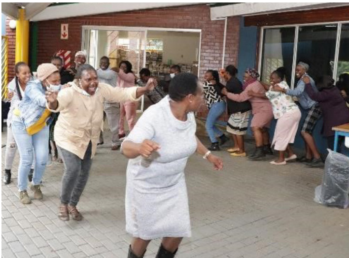
Above: Educators during the hands-on STEM and climate change activities