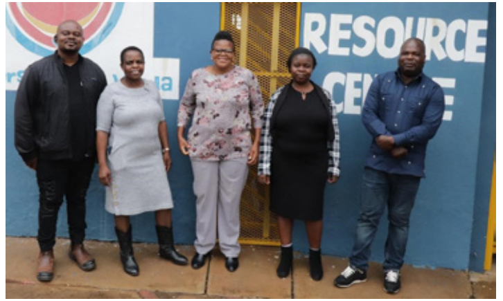
The workshop facilitation team made it possible on the day