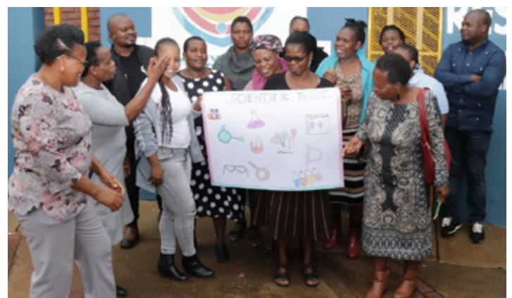
One of the groups displaying their science kit activity