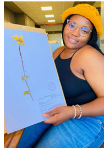
Displaying her project at the herbarium for herbarium orientation

This research has revealed multiple locations in the country where Ipomoea quamoclit can be found, and the researcher has contributed to this knowledge by discovering eight new locations. Moreover, the study indicates that Ipomoea quamoclit can withstand temperatures as high as 40 degrees Celsius, which was previously unknown. This is an incredibly significant finding, as it expands our understanding of this species' survival capabilities and resilience. With this added information, it is essential that we take measures to control this potential invader before the cost of controlling it becomes exorbitant.