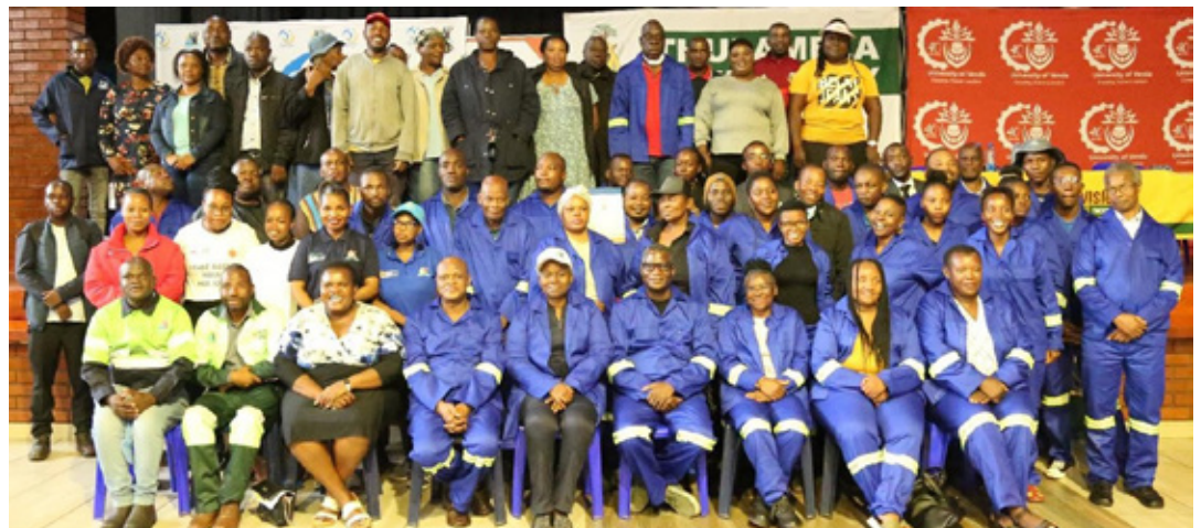
Executives pose for a photo with some of the participants