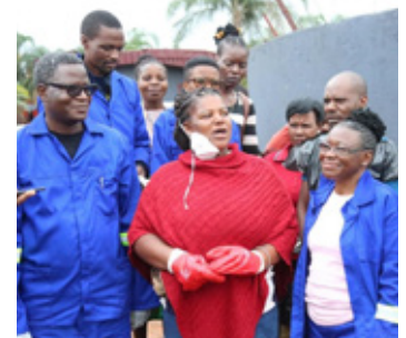
One of Mvusuluzo Taxi Rank hawkers (middle in a red top) talking to the participants about the importance of always keeping the town clean