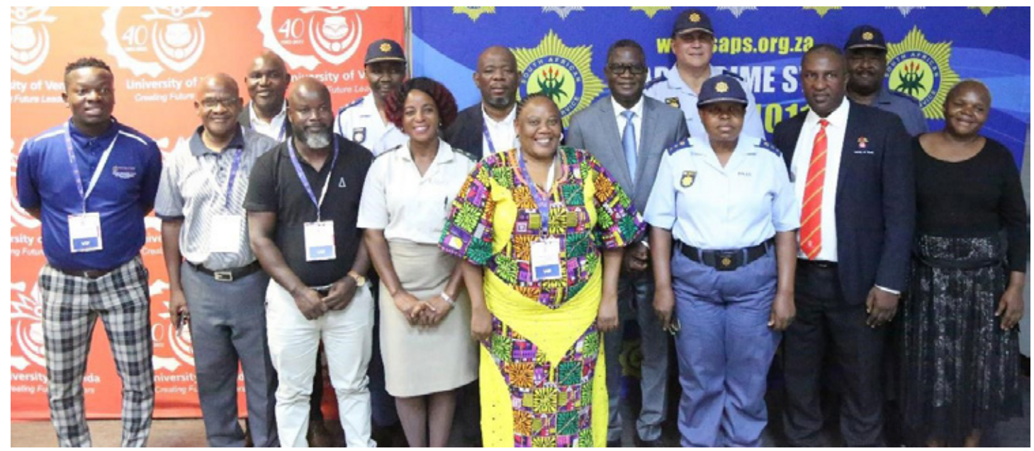
Group photo of some of the members who participated on the programme