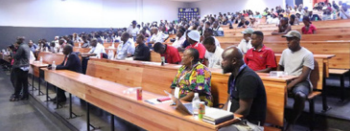
Some of the attendees during the Launch