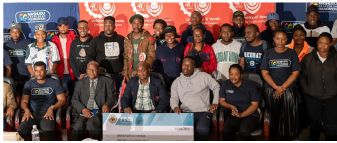
A group photo of some of the attendees of the ceremon