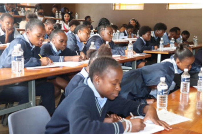
Learners during one of the event activities