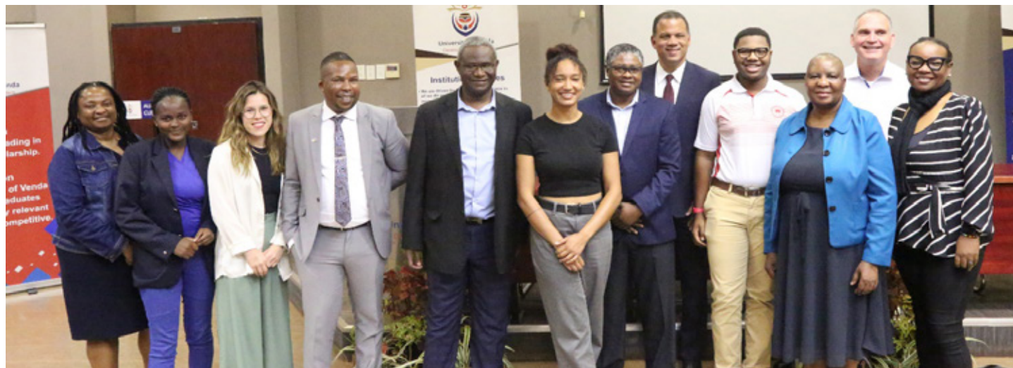
UNIVEN and Guilford College staff members posing for a photo at Research Conference Centre