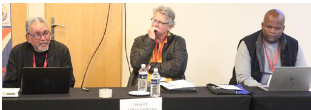
Delegates sharing their grant proposal writing experiences