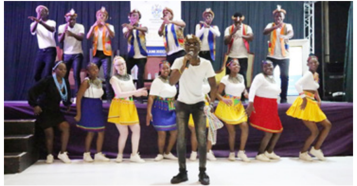
UNIZULU Choir entertaining participants