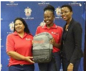
Students receiving the laptops from Take Note IT