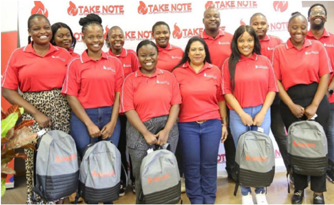
Take Note IT beneficiaries pose for a photo with some of Take Note IT staff.