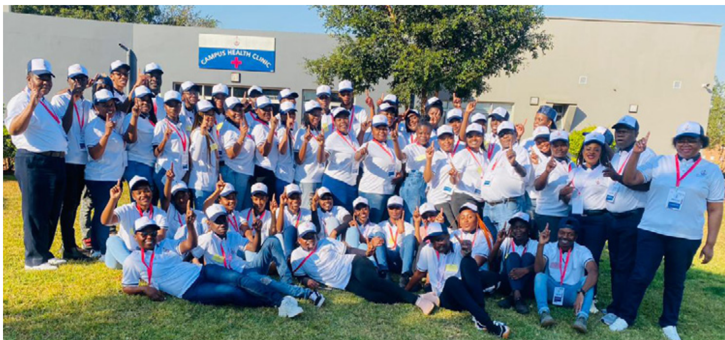
Campus Health Staff members and Peer Educators posing after the event