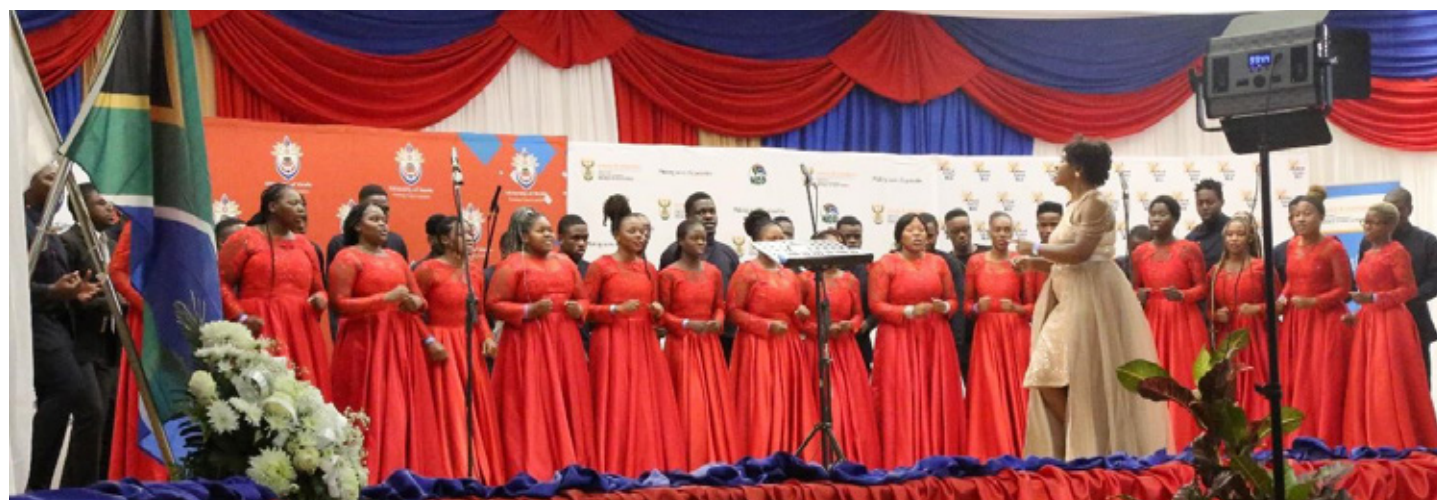
UNIVEN Choir entertaining the audience