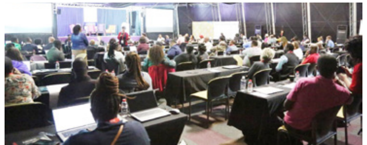
Some of the conference participants during the conference