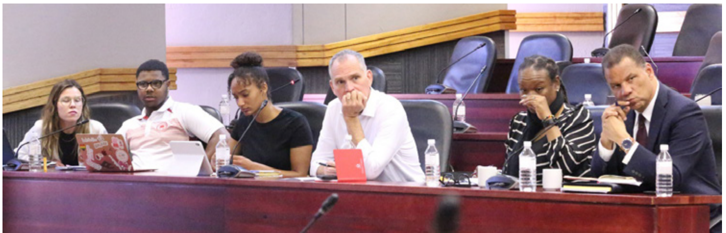
Delegates from Guilford College