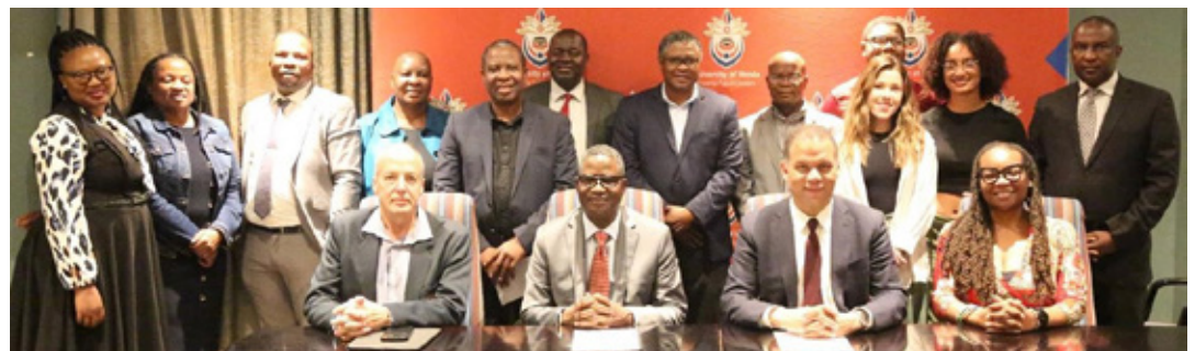
A group photo of attendees of the MoU signing