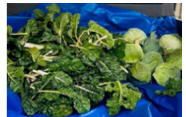
Vegetables donated to SOWOSA