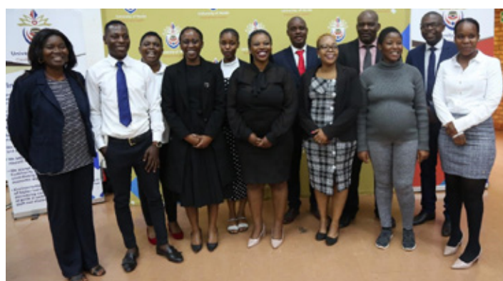
Law Clinic staff and presenters posing for a photo