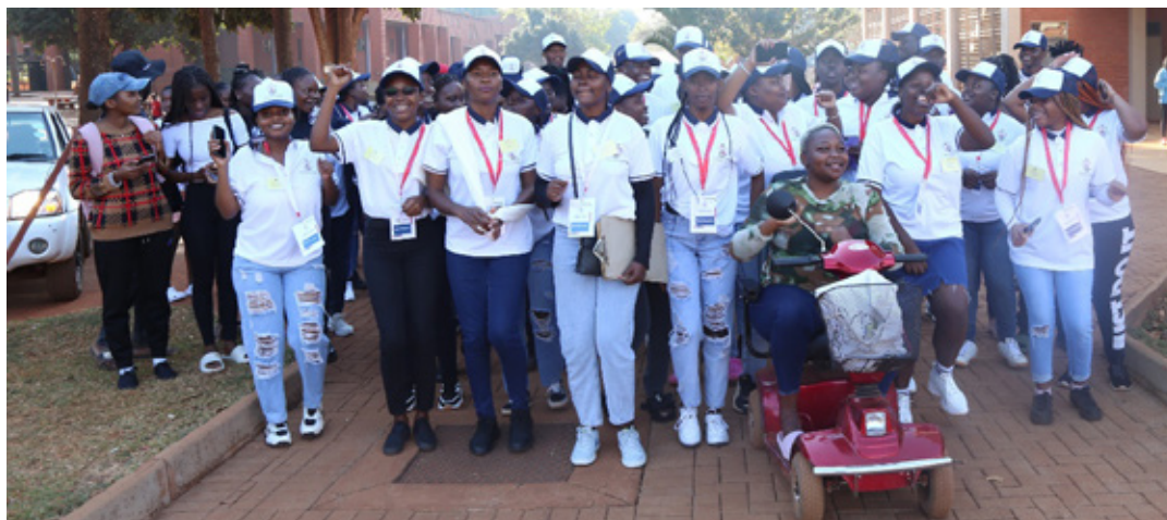
Staff and students participating in the fun walk from Sports Hall to the venue where the event took place before the event

'Education is contraception's best friend.' This was the theme of the Sexual and Reproductive Health Awareness Campaign that recently took place at the University's Lecture Hall 01 of the School of Education. During this health awareness campaign, Campus Health Services advised students about disadvantages of falling pregnant while they are still students. Students were educated about how to avoid unwanted pregnancies, how to avoid being infected by sexually transmitted diseases, and to give students the opportunity to be accountable for their health.