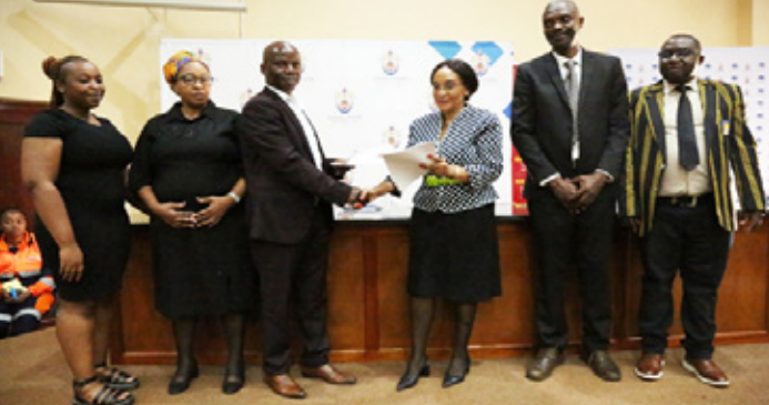
Exchange of the Signed MOU by the two institutions