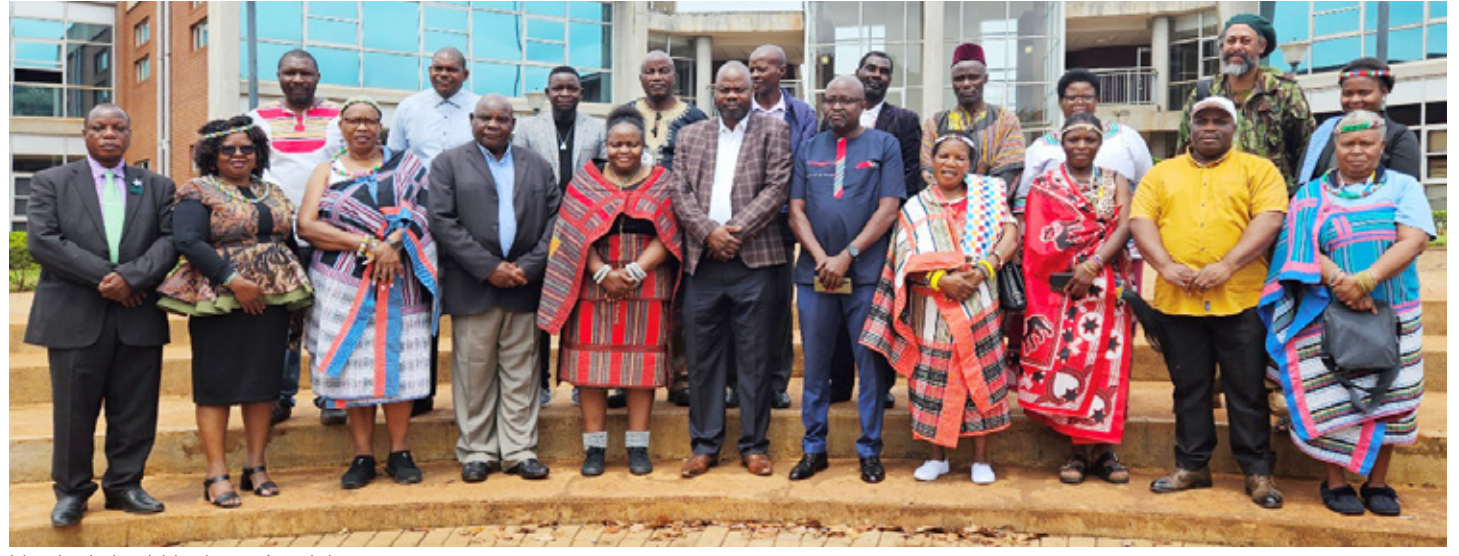
Internal and external delegates pose for a photo

As the country is observing an annual Heritage Month in South Africa, the Department of Indigenous Knowledge Systems (IKS) and Heritage Studies under the Faculty of Humanities, Social Sciences and Education at the University of Venda organised the 2023 Heritage Day celebration that took place on Friday, 29 September 2023 at the University D-Block.