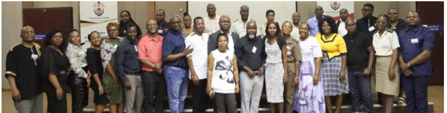
A group photo of stakeholders from various institutions, government departments, and organisations

On Thursday, 12 October 2023, the University of Venda's (UNIVEN) Department of Social Work held a Colloquium under the theme 'Redefining the pedagogy of Social Work: Roles and responsibilities of institutions in fieldwork trajectory'. This colloquium took place at the University's Research Conference Centre and was attended by staff and students from the universities of Venda and Limpopo (UL).