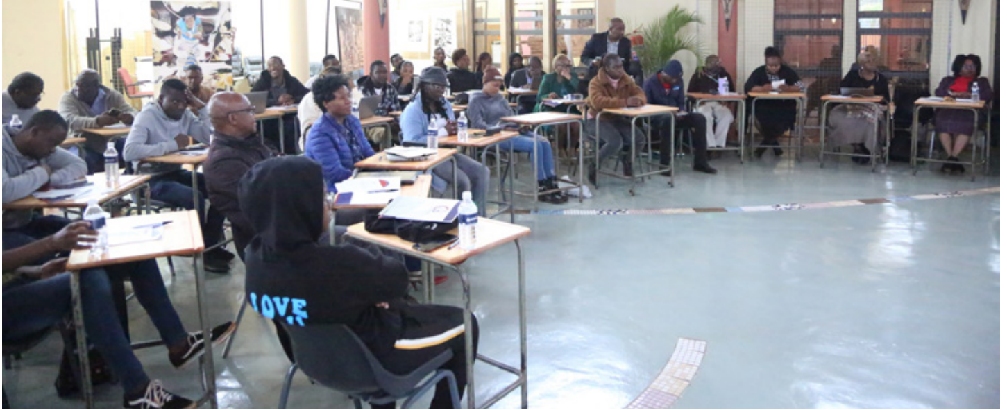
Attendees listening to speakers on day one of the Research Day