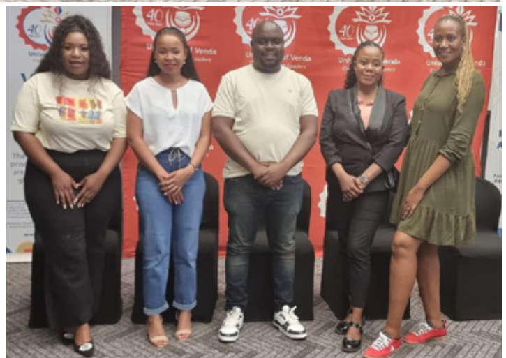
The top Five of the newly elected committee