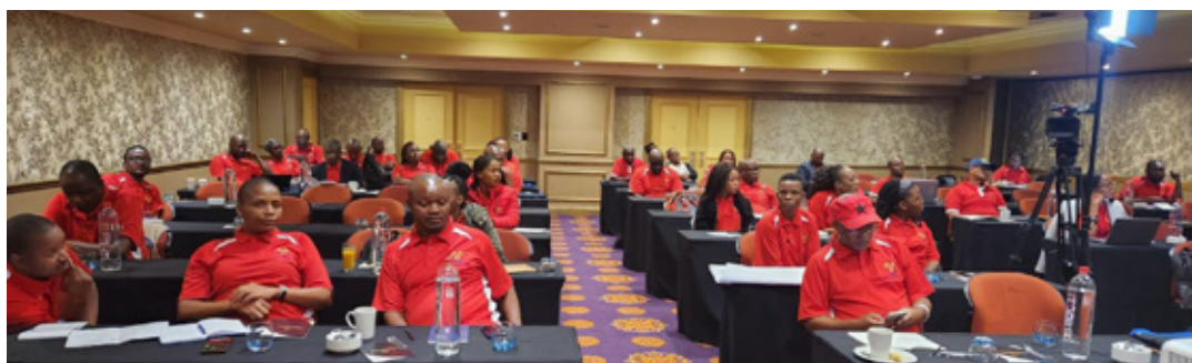
Delegates paying attention to the speakers

This was followed by group presentations where groups presented their plans on how to achieve their goals.