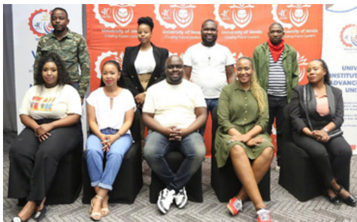
The newly elected UNIVEN Mpumalanga Lowveld Alumni Chapter committee