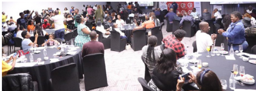
Some of the attendees who have attended the launch

He informed the audience that the University introduced Performance Management System and developed an Automated Performance Management process which has been rolled out to the entire University. All employees, from the gardener to the vice chancellor, are subjected to performance management with a view to improving individual and overall institutional performance.