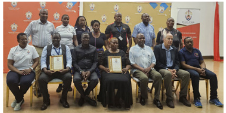
30 and 40 years - employees who served the university for 30 and 40 years pose for a photo with members of the senior management