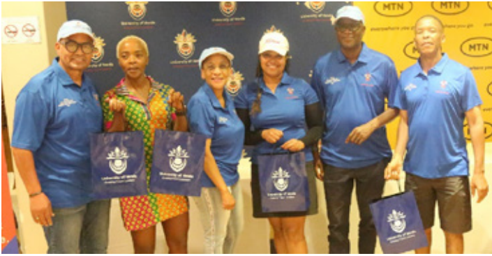
2nd Prize winners