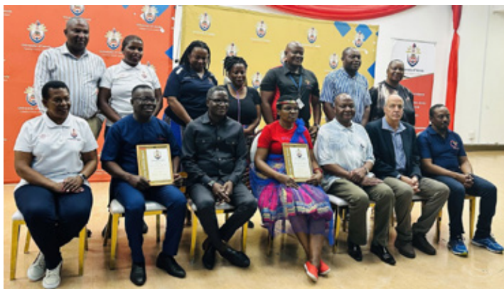
20 years - employees who served the university for 20 years pose for a photo with members of the senior management