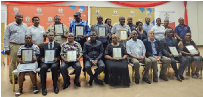
Some of the retirees pose for a photo with the University Senior Managers