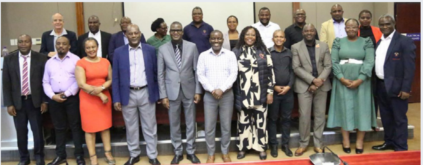
Participants of the DHET site visit

"We need to work together as a team in order to achieve our intended goals."