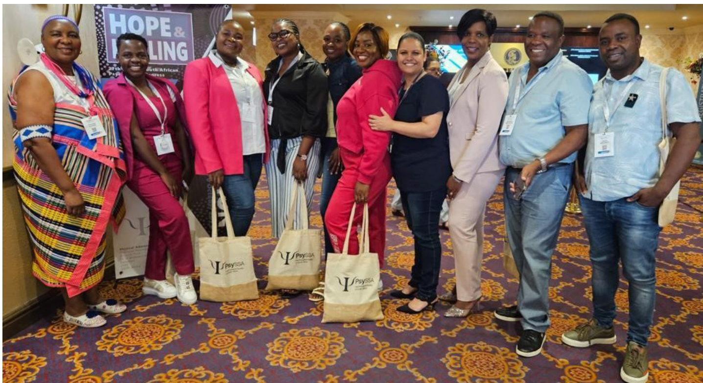
Some of the UNIVEN staff members who attended the 2023 PsySSA Congress