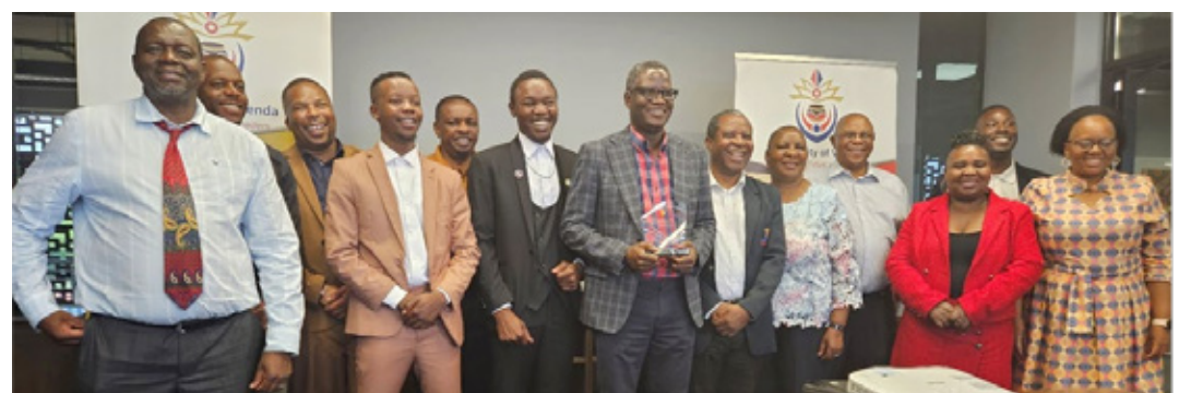
UNIVEN Faculties Representatives

"we want our students to embrace this entrepreneurial mindset of making sure that they change the lives of people around them."