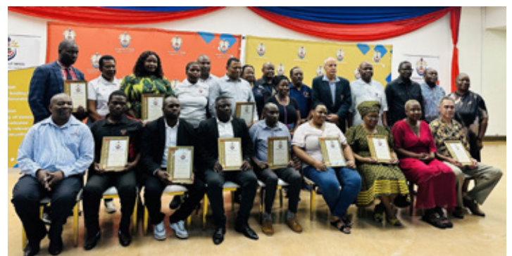
10 years - employees who served the university for 10 years pose for a photo with members of the senior management.