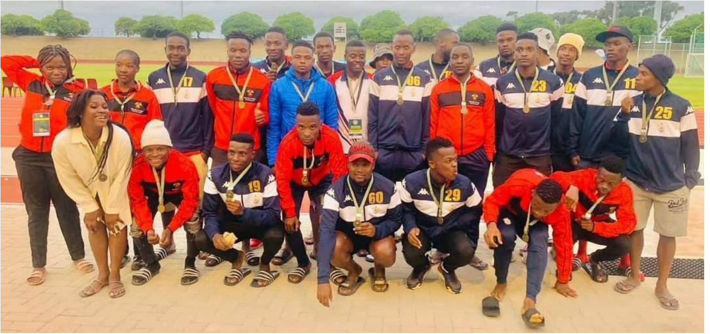
UNIVEN FC was rewarded with a bronze medal for obtaining 3rd position at the USSA tournament

The University of Venda (UNIVEN) Football Club is a University Sport South Africa (USSA) affiliated club. This UNIVEN FC male team was recently crowned a Bronze Medal after obtaining the third position.