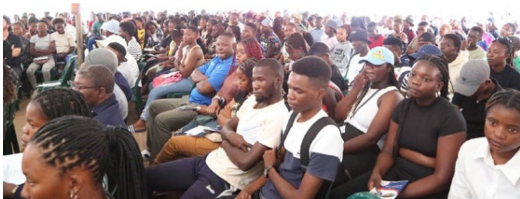
First entering students who attended the 2024 Official Opening of the Orientation Programme