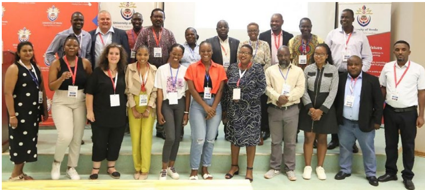
Participants of the UNIVEN/ICGEB Workshop

Weeds, including invasive alien plant species, remain a significant constraint to food production and a major threat to biodiversity in the country. Even though chemical pesticides (including herbicides) have played a significant role in pest control over the years, the misuse or overuse of these products may pose challenges. It is for this reason that the University of Venda's Faculty of Science, Engineering and Agriculture (FSEA) in collaboration with the Department of Science and Innovation (DSI) and the International Centre for Genetic Engineering and Biotechnology (ICGEB) held a workshop