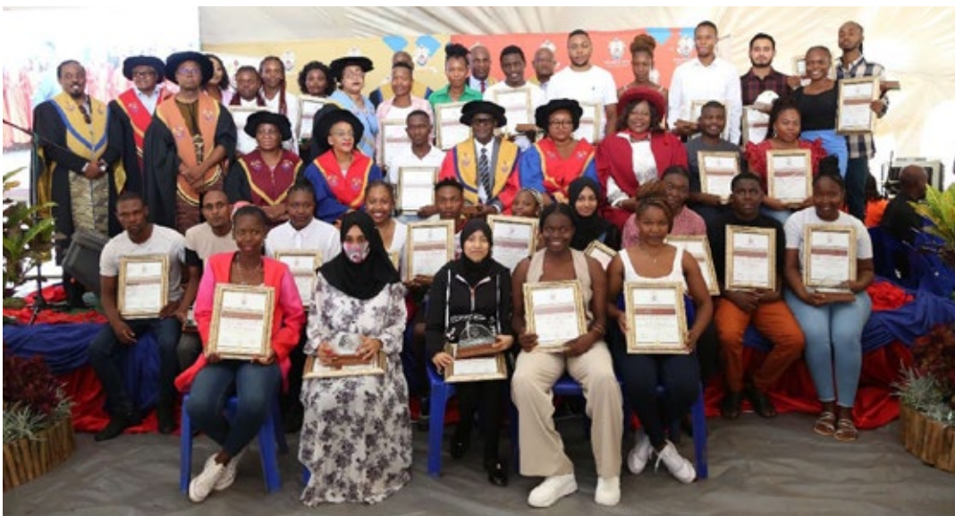
Awards recipients displaying the awarded certificates and trophies