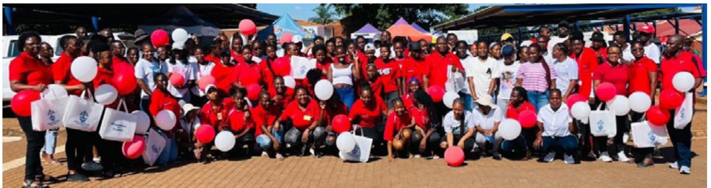
Campus Health staff members and Peer educators on Valentine's Day