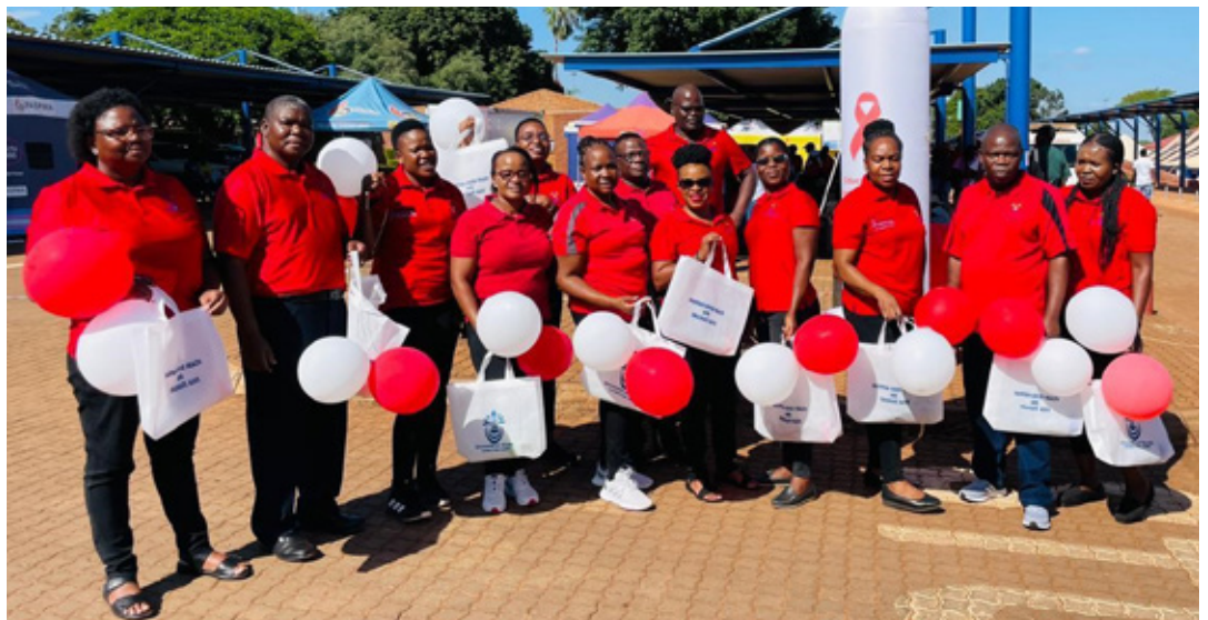
Campus Health staff with Valentine gift pack for students