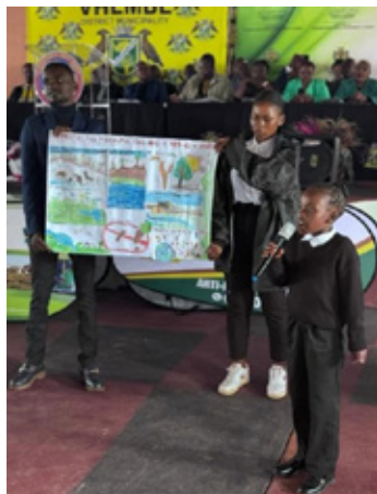
Learners during their wetlands presentations

Thirty-five percent World 's Wetlands and forests have been lost due to human activities," said Executive Mayor Cllr Nkondo.