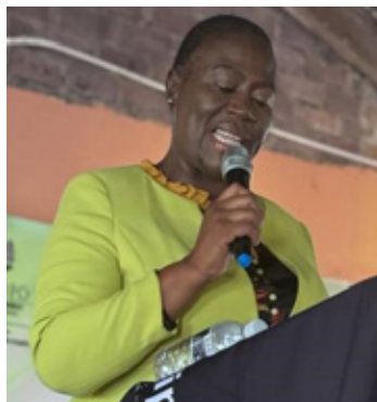
Vhembe District Municipality Executive Mayor, Councillor Tsakani Freda Nkondo delivering keynote address