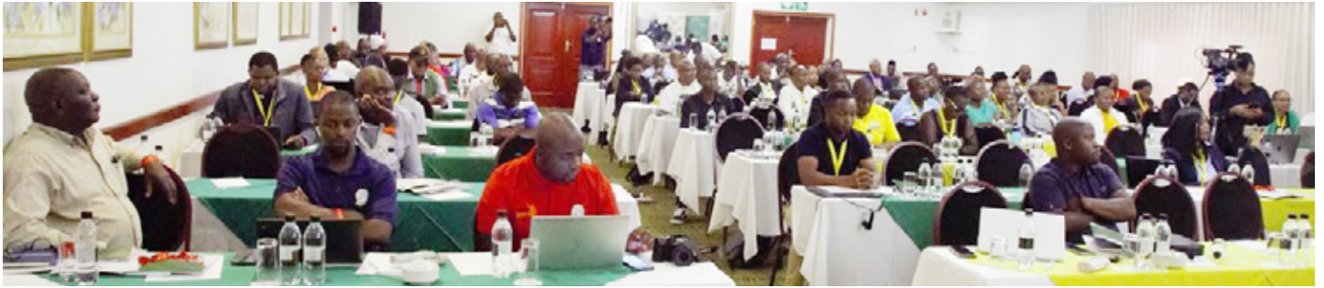
Some participants at the LRF on day one of the 2024 Limpopo Research Forum

Limpopo Provincial Government in partnership with University of Venda, University of South Africa, University of Limpopo, and Tshwane University of Technology hosted the annual Limpopo Research Forum (LRF) from the 15-16 February 2024 at the Ranch Hotel. The forum was hosted under the theme: 'Advancing Economic Renewal through Research: Growing Limpopo Together.'