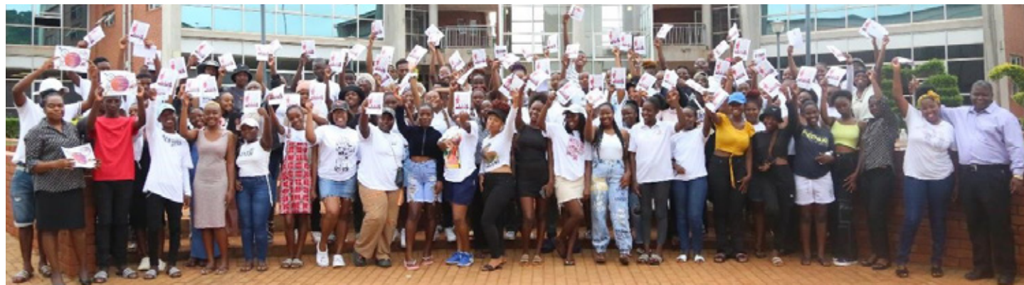
A total number of 77 students participated in this training.

themes: Definition of Peer education, Roles, and qualities of a good peer educator; basic HIV/AIDS, Sexual and Reproductive Health, STIs, TB, GBV, Mental Health, PEP, PrEP; Counselling Skills; Communication Skills; Alcohol and Substance abuse Prevention; and Monitoring and Reporting.