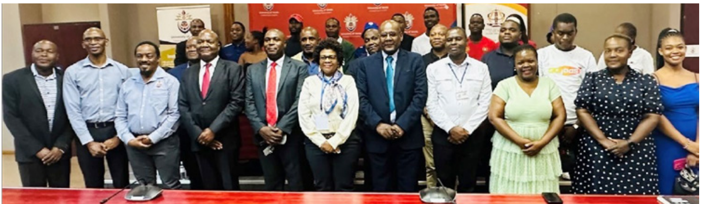
The session was attended by members of the Senior Management and Student leadership of the University of Venda.