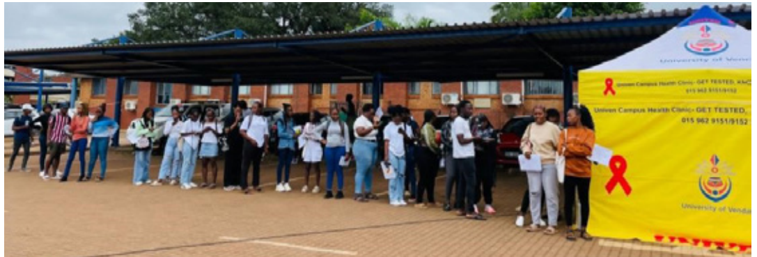
Students on the que for HIV Testing Services by Campus Health, ANOVA and PAPSWA