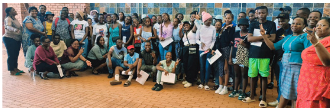
New Students: Ubuntu Movement Ambassadors with Coordinators posing for a photo outside the orientation venue

Ubuntu is an African philosophy that emanates from a proverb that is derived from the Nguni proverb 'Umntu Ngumuntu Ngabantu', which means 'a person is a person because of or through others'.