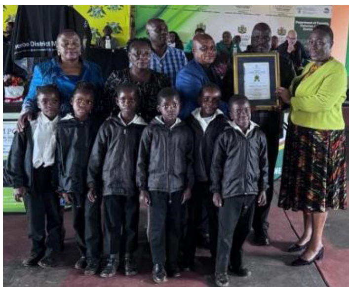
Awards giving ceremony

The Executive Mayor provided the background on the celebration of Wetlands that was adopted during the Convention of Wetlands on 02 Feb 1971. "It should become our responsibility not to abuse our Wetlands because they are homes of plants and animals. Practices such as overfishing, deforestation, and overgrazing are a severe threat to our wetlands.