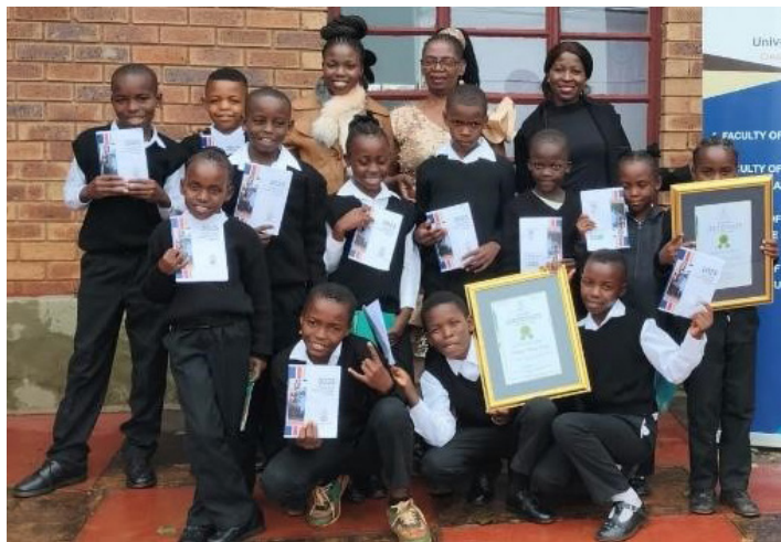
Khakhu Secondary School learners celebrate their first-prize achievement

They mentioned that climate change, overexploitation, and natural processes such as erosion, sedimentation, and