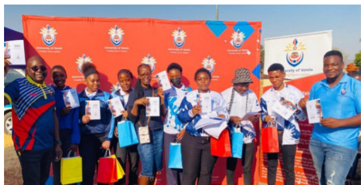
Photo above: Excited grade 12 learners during the exhibition