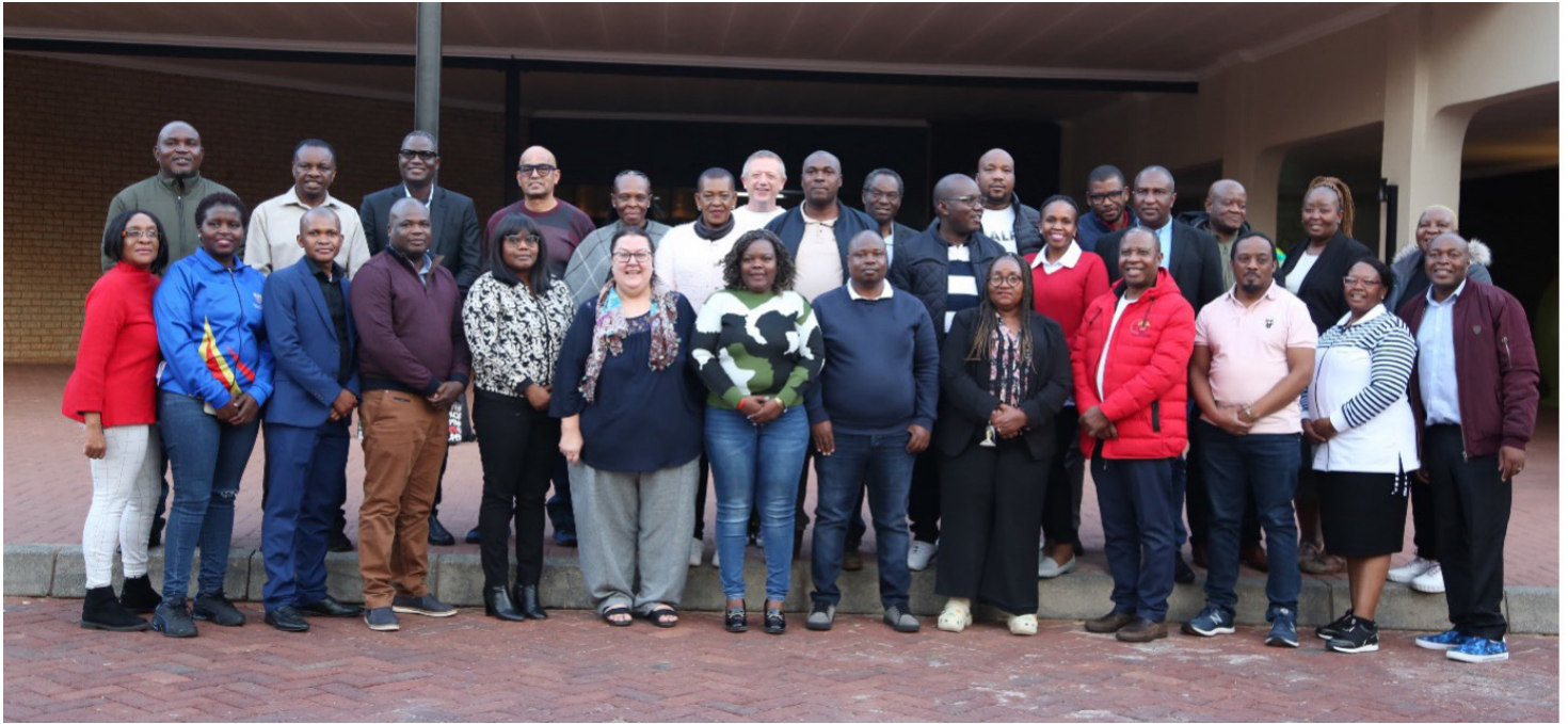
On photo: Attendees of the 2024 Mid-Term Strategic Plan Review Workshop