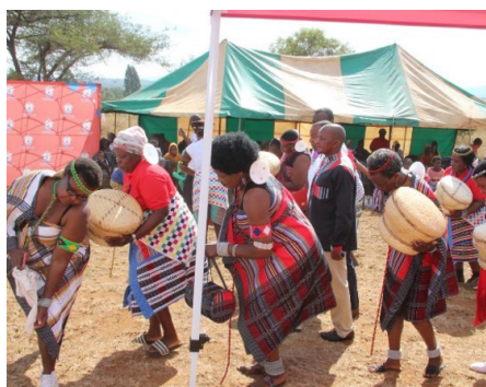
On Photo: Ha Muraga elders performing a dance