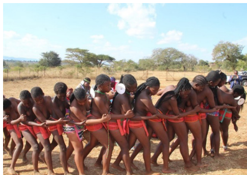
On Photo: Youth of Ha Muraga performing Domba