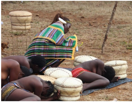
On Photo: Young people embracing their traditions

our young people, nurture their talents, and support their dreams.