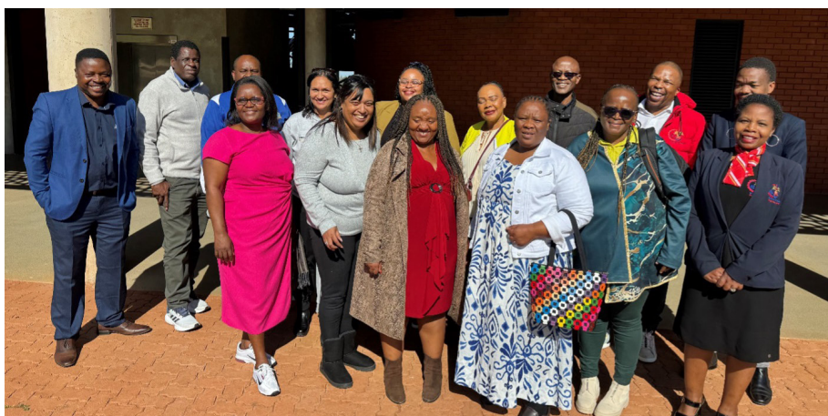
On photo: SAHDIA members after the Faculty of Health Sciences Site Visit

One of the key benefits of this collaborative approach is the ability to harness diverse perspectives and experiences. This diversity enriches the academic environment, fostering a more inclusive and comprehensive understanding of complex social issues. By working together, HDIs can develop curricula and research agendas that are more attuned to the needs of their communities, ultimately producing graduates who are well-equipped to address local and global challenges.