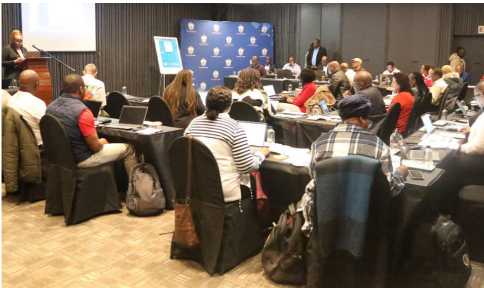
On photo: Attendees During one of the workshop sessions