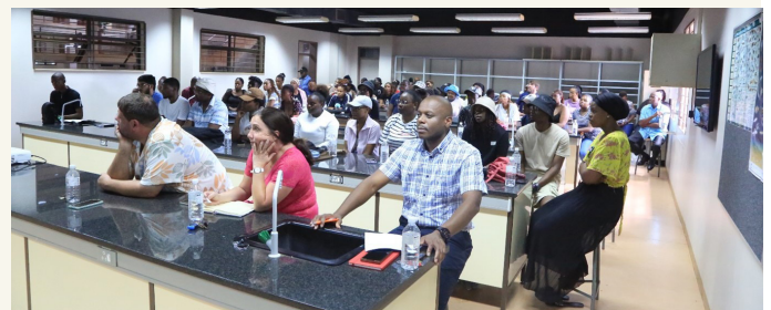
Attendees of the lecture