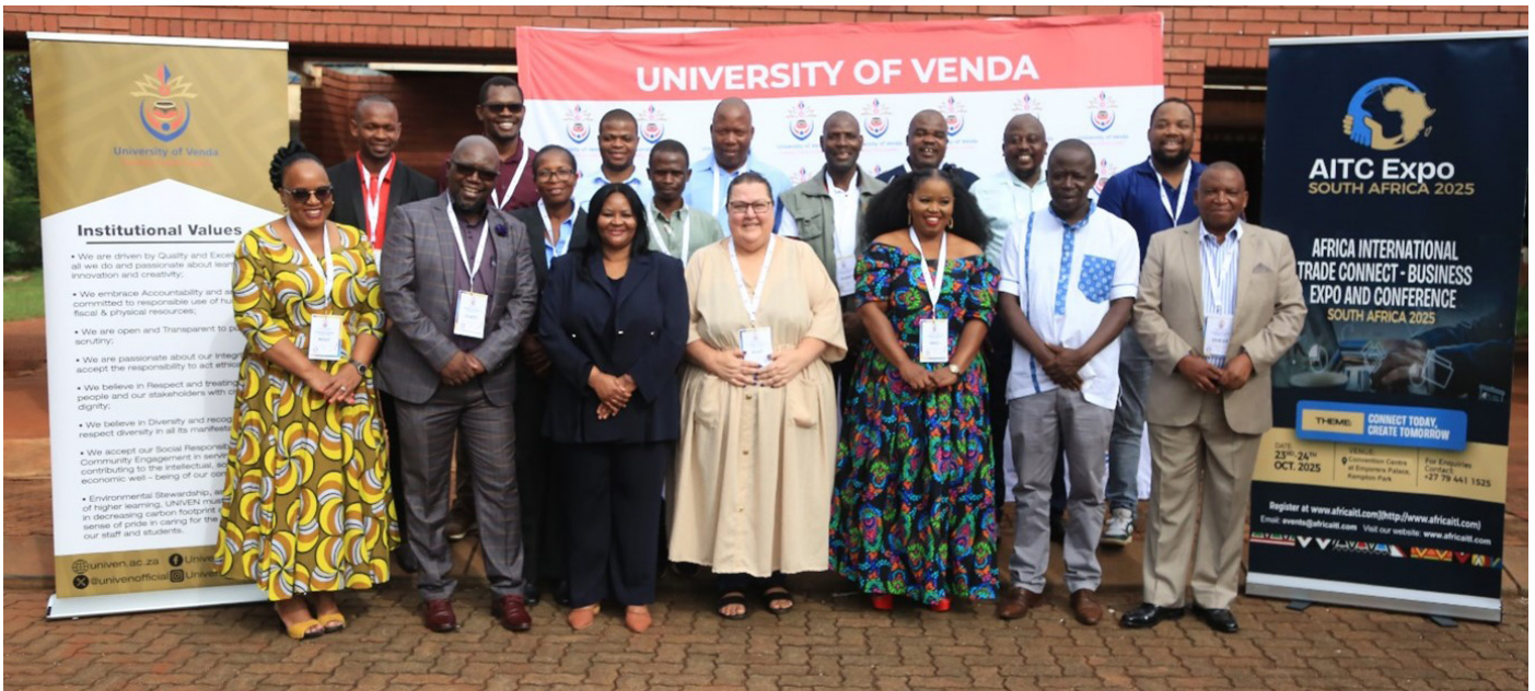
University of Venda staff and guests

On Wednesday, 9 April 2025, the University of Venda's Faculty of Science, Engineering, and Agriculture, in partnership with Africa International Trade Connect, held an inspiring and insightful workshop for farmers. This workshop took place at the University of Venda (UNIVEN) Agricultural Hall. Over 280 farmers, students, and industry stakeholders attended this impactful workshop, which aimed to prepare participants for the annual Farmers Day in August.