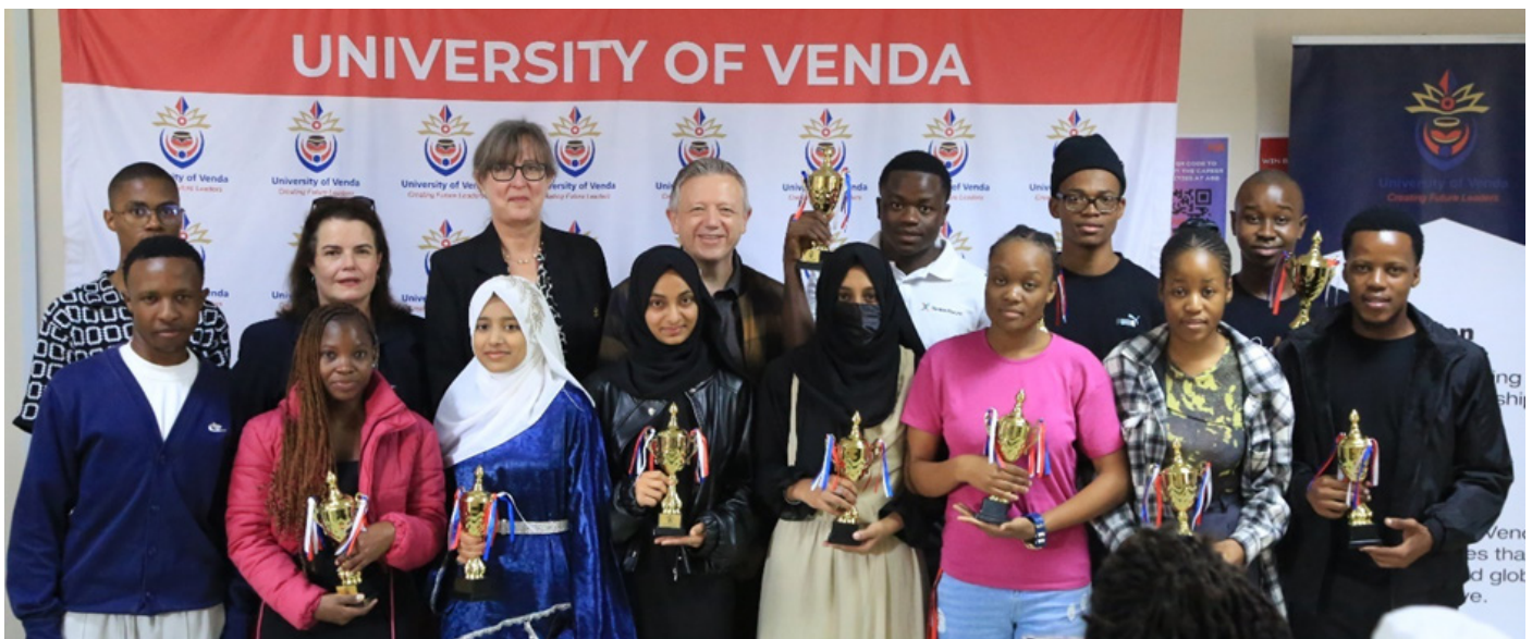
Overall best students in FMCL posing for a group photo with some UNIVEN staff members

The University of Venda's Faculty of Management, Commerce, and Law hosted its 2024/2025 Excellence Awards ceremony at the Student Parliament on Friday, 23 May 2025, recognising outstanding students from first to third year. The purpose of the ceremony was to award certificates of excellence to the best-performing students in the faculty undergraduate programmes for academic year 2024.