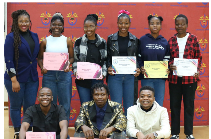
Certificate recipients and their Lecturers

This event just marked another milestone in the Section's continued efforts to celebrate and cultivate academic excellence, and the university community is encouraged to join in congratulating these high-achieving students.