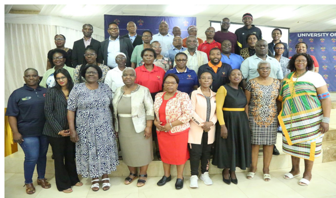
Project Leaders, Review Panel Members and DCEIIC Staff Members