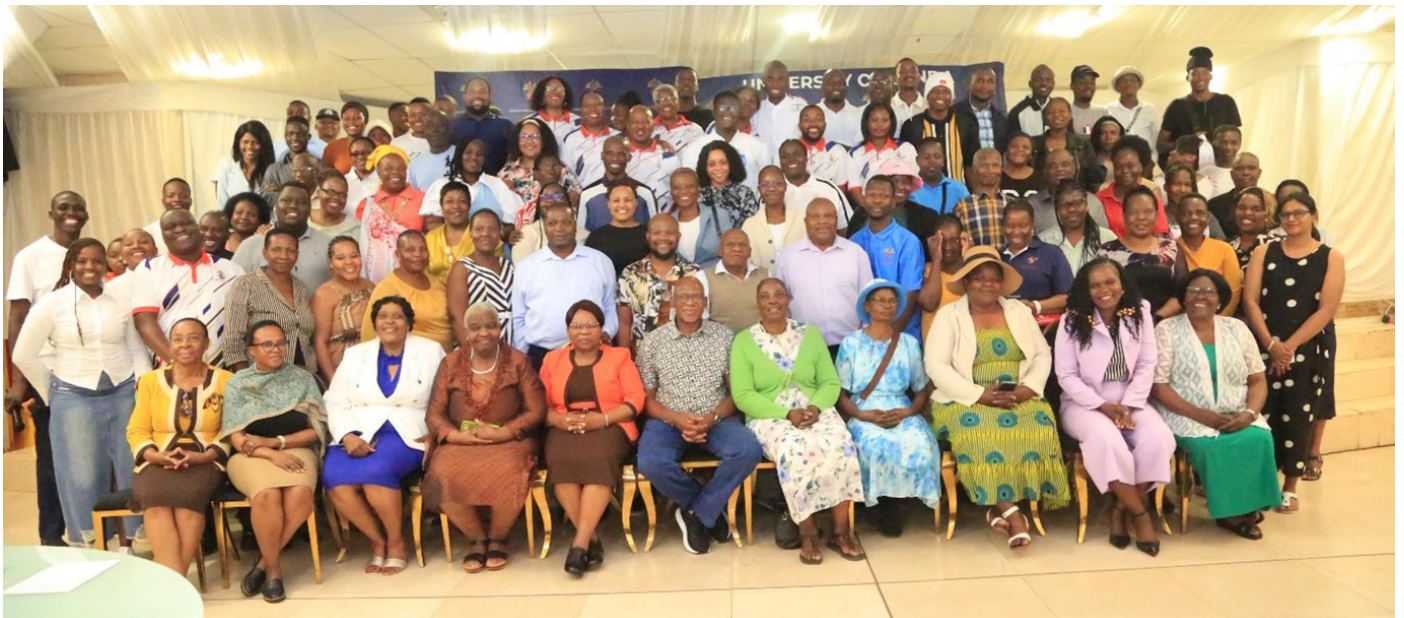
Attendees pose for a group photo

The workshop held on the 26 and 27 August 2025 at 2Ten Hotel in Sibasa, was convened with the support of DHET - University Capacity Development Programme (UCDP) to elevate awareness of the principles of the scholarship of community Engagement and co-creation methodologies. As UNIVEN concludes its strategic plan 2021-2025, the workshop also served an opportunity for member check. Member checking, also known as respondent validation or participant feedback, is a qualitative research technique where researchers return collected data (e.g., interview transcripts, preliminary analyses, or synthesised findings) to participants. This step allows participants to confirm, clarify, or correct the interpretation of