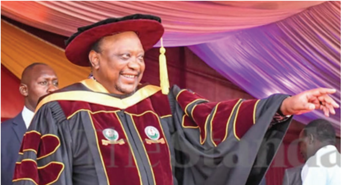
His Excellency, Hon Uhuru Muigai Kenyatta

of the Republic of Kenya, at Kabarak University's graduation ceremony. The event underscored a powerful message of collaboration between education and national leadership, inspiring graduates to embrace innovation and service.