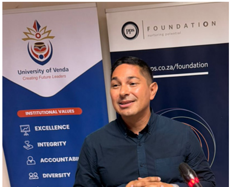
Above are the speakers during the Thoho Ya Nzie Student Welfare Programme