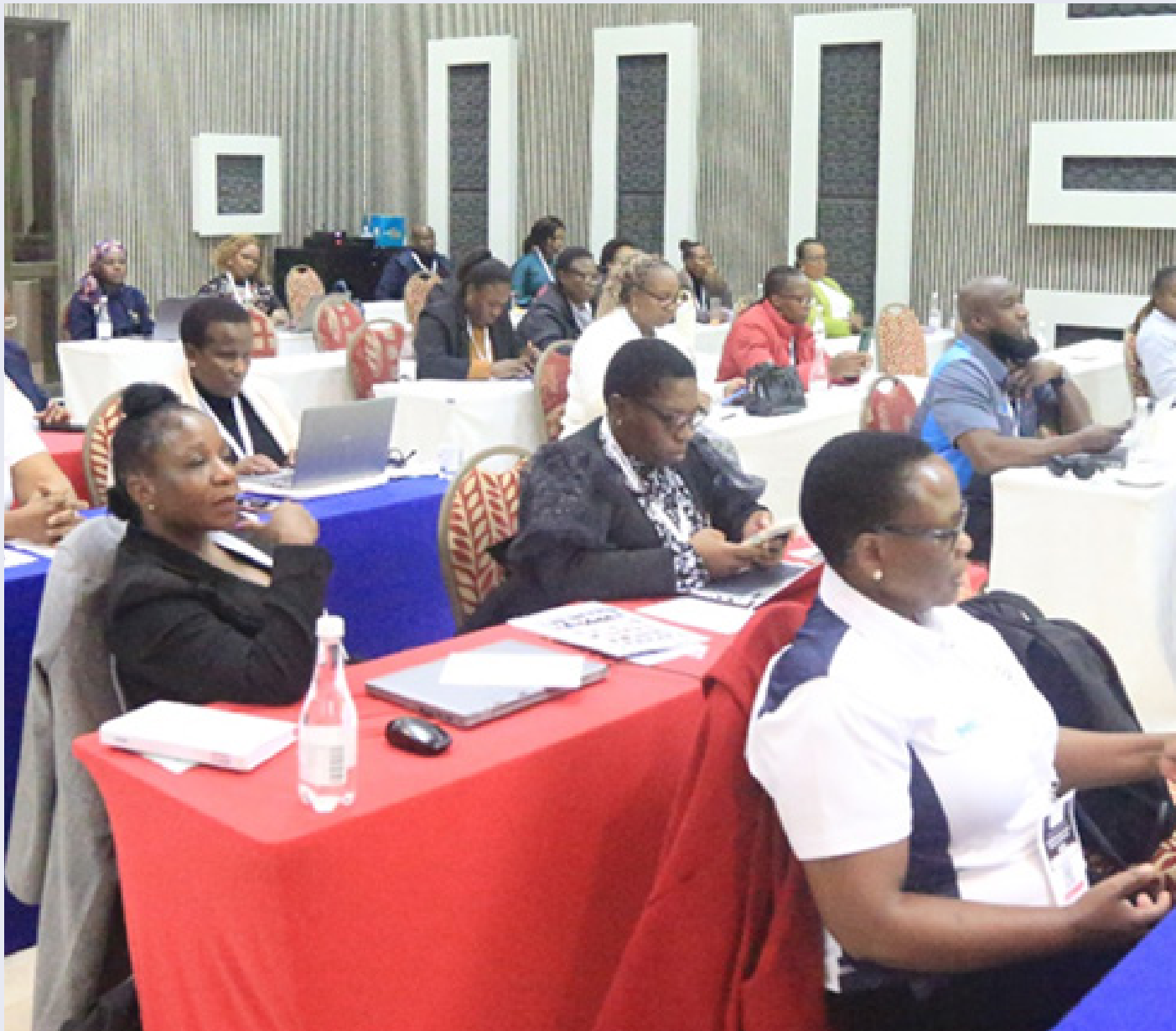
Some of the Conference Participants on day 1

The Faculty of Health Sciences recently organised the Health Sciences Conferences in collaboration with the South African Medical Research Council (SAMRC). This Conference took place at 2Ten Hotel from 22-25 April 2026 under the theme: 'Collaborative care for Healthier Futures'. During this Conference, thirteen (13) posters and 26 presentations were delivered. The conference aimed to develop a multidisciplinary model integrating