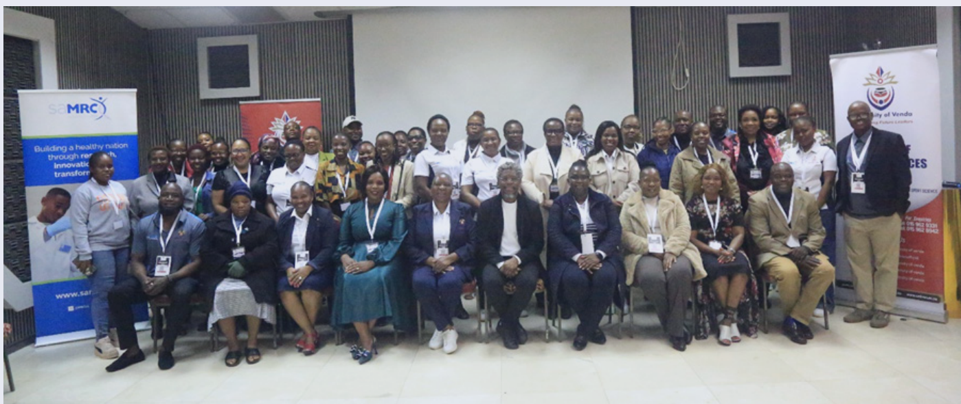
Group Photo of some of the conference participants