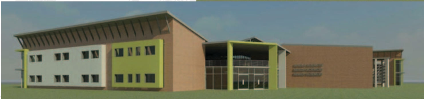
New School of Health Sciences building.