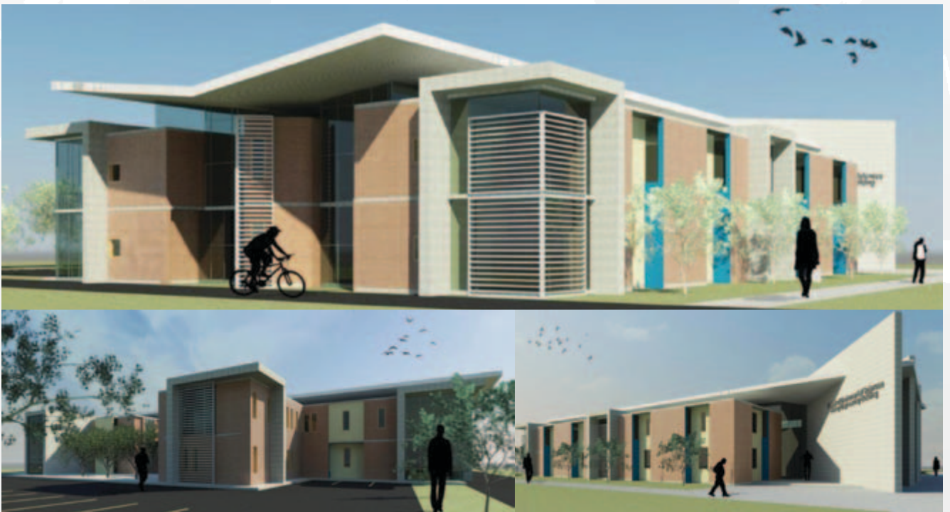
Proposed new engineering building.