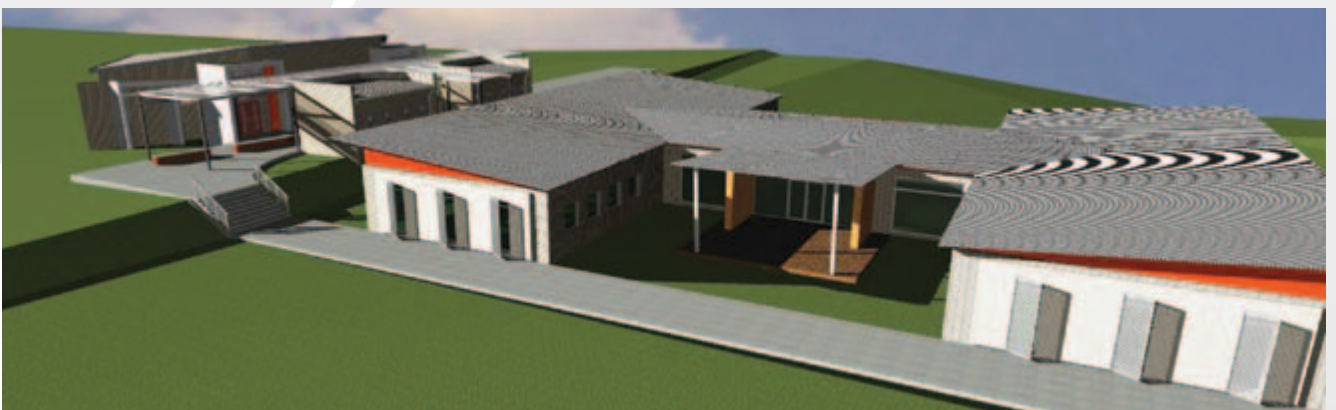
Proposed office complex.