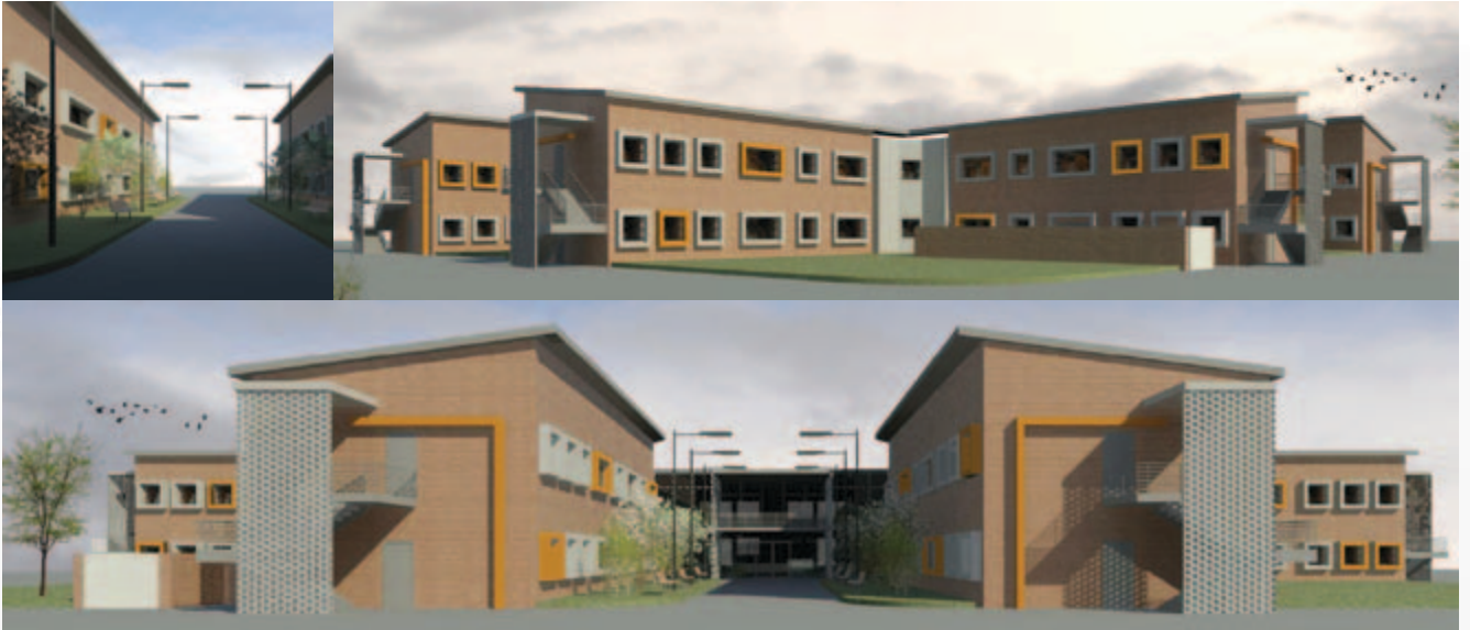
Proposed new residences.